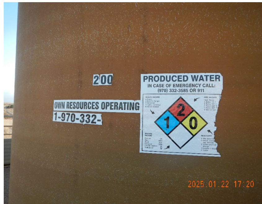
6. Produced water tank. Note labels/stickers peeling.