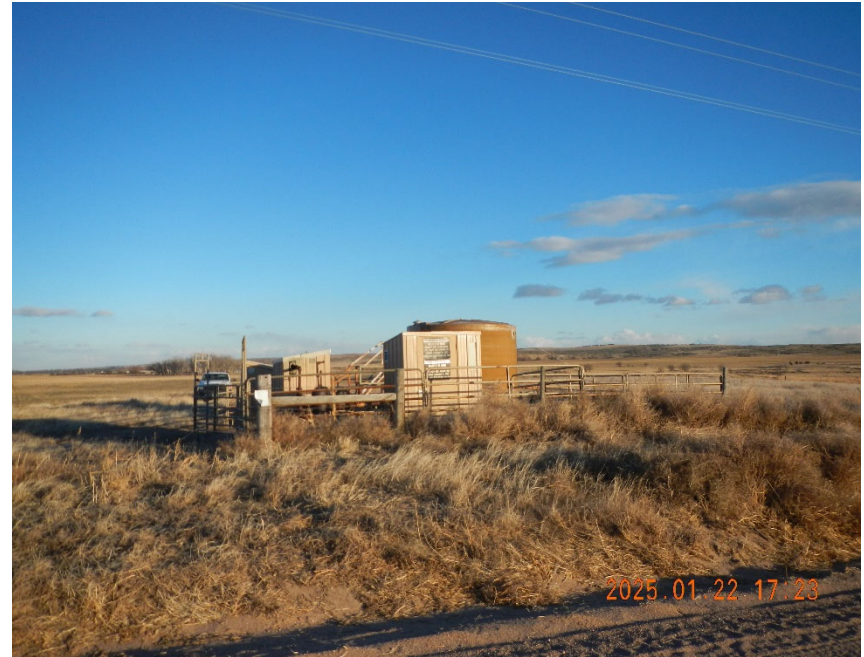
8. Remote tank/gathering location overview.