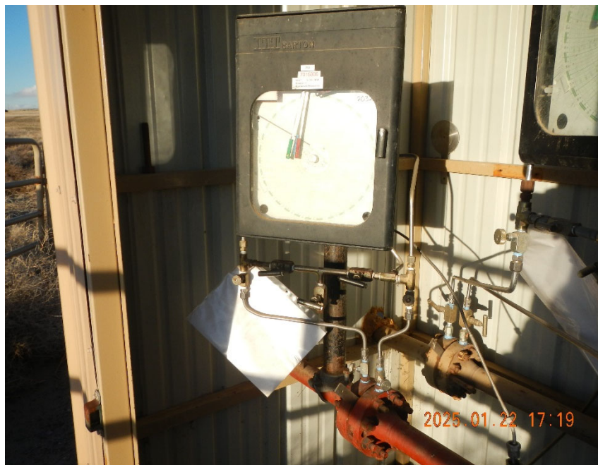
5. Gas meter inside meter shed.