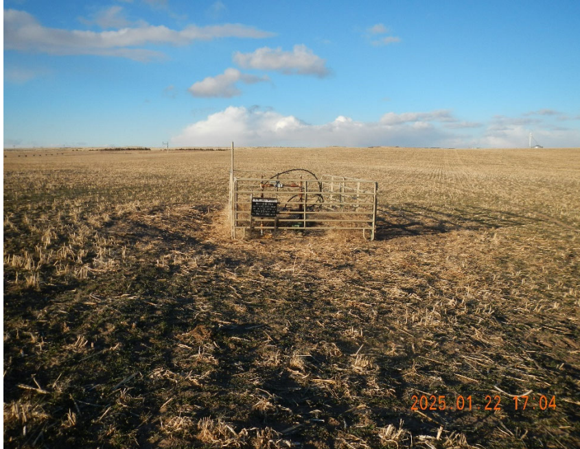
3. Well location overview. Note black poly visible against fencing.