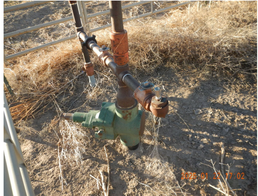
2. View of wellhead. Note dried vegetation inside fencing.