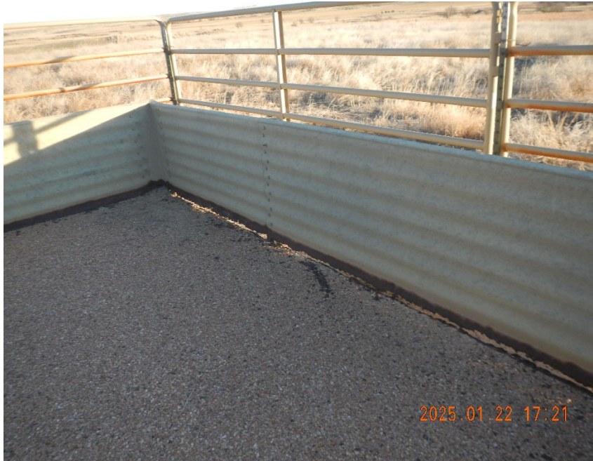
7. Metal containment is rusted through at grade. Note visible daylight along base of metal wall.