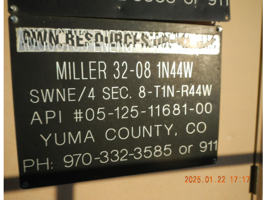
4. Lease sign at remote gathering location.