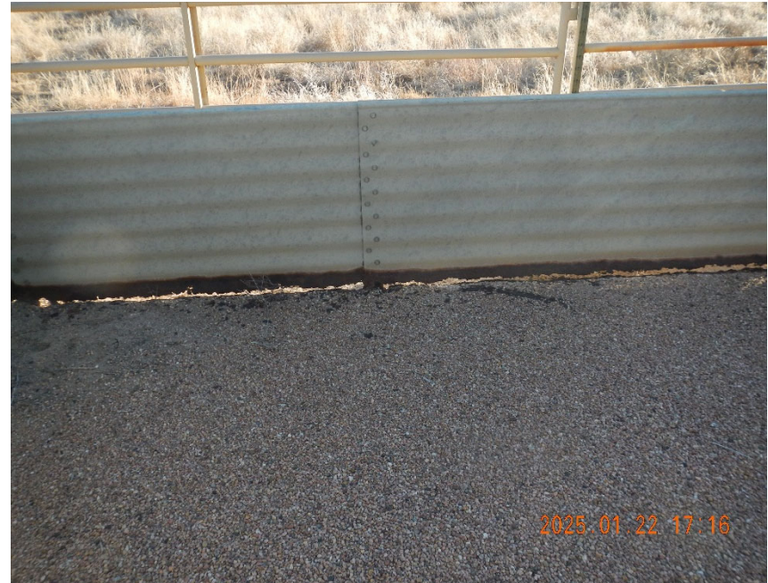
8. View of metal containment wall around tank that has rusted through at grade level.