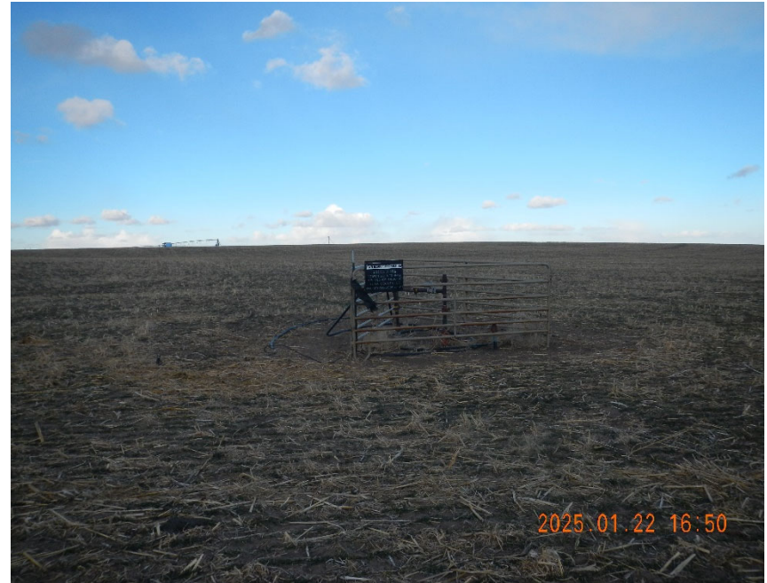
4. Well location overview.