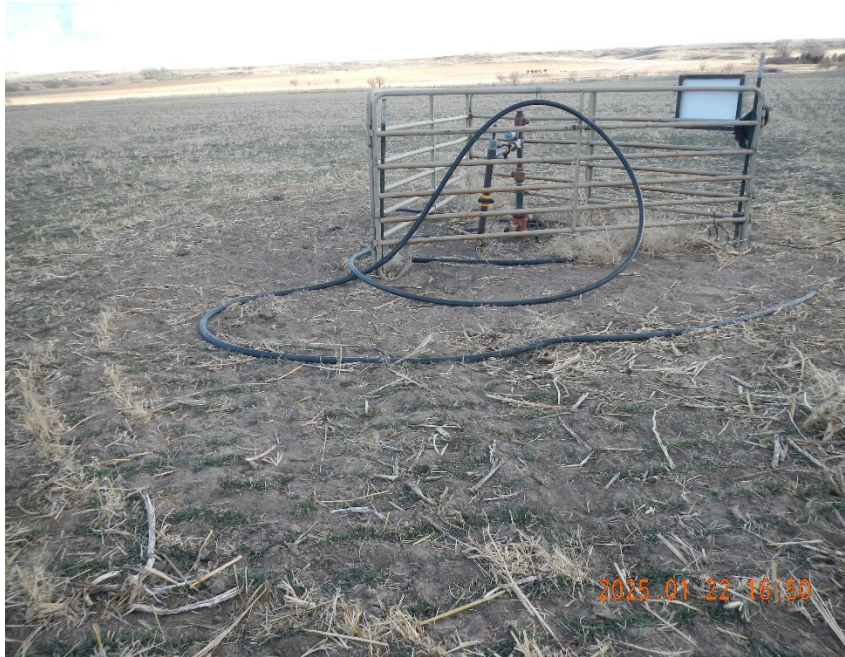
3. Black poly line outside well fencing.