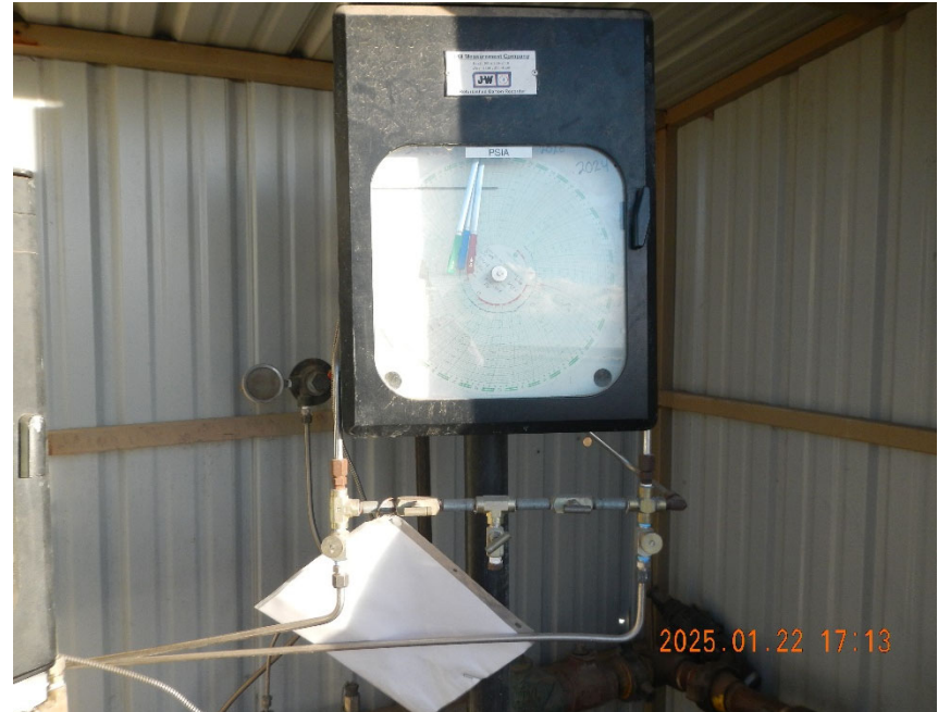
6. Gas meter inside meter shed.