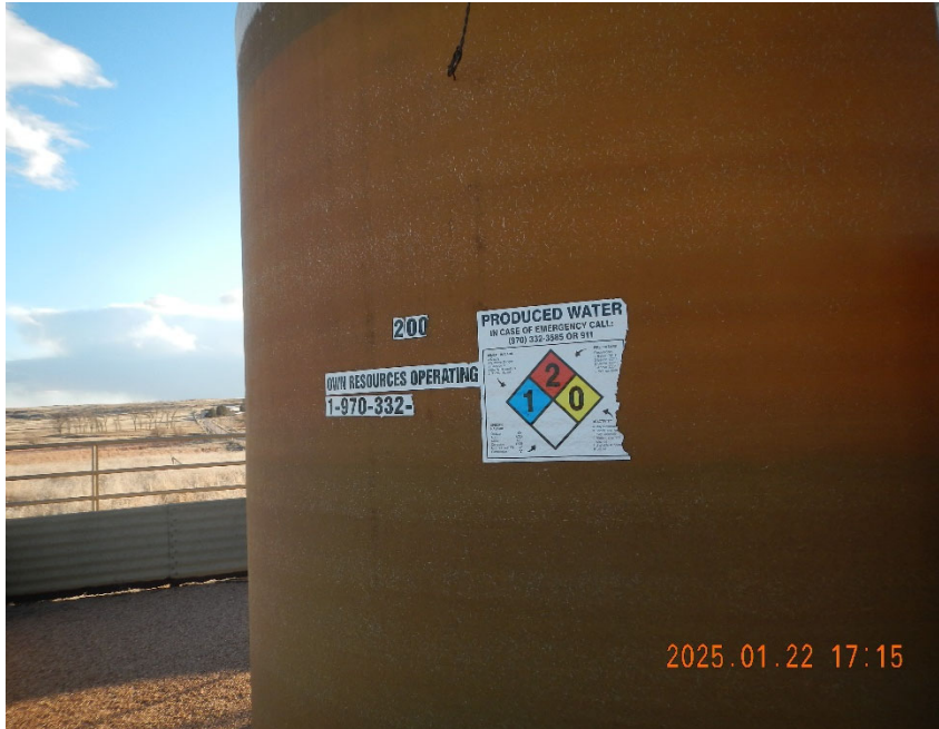
7. Produced water tank at remote battery. Note labels/stickers are peeling and require replacement.