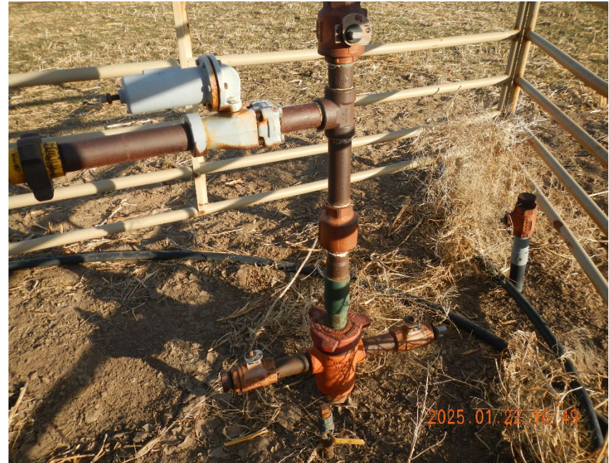
2. View of wellhead. Note dried vegetation inside fencing.