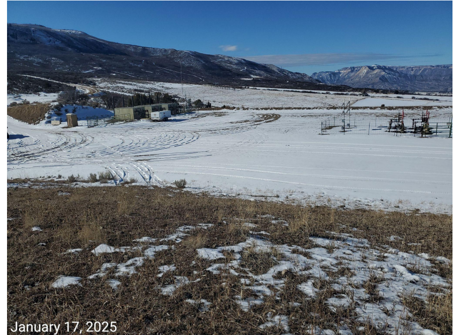
Photo 1: Photos 1-2 taken from the east end of the location. Photos provide an overview of the Location from south, southwest, northwest to north.