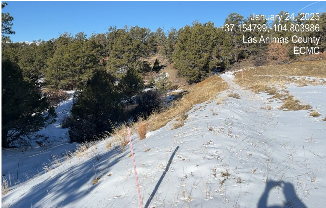
Photo 3. Facing toward the fill slope which is stabilized with vegetation.