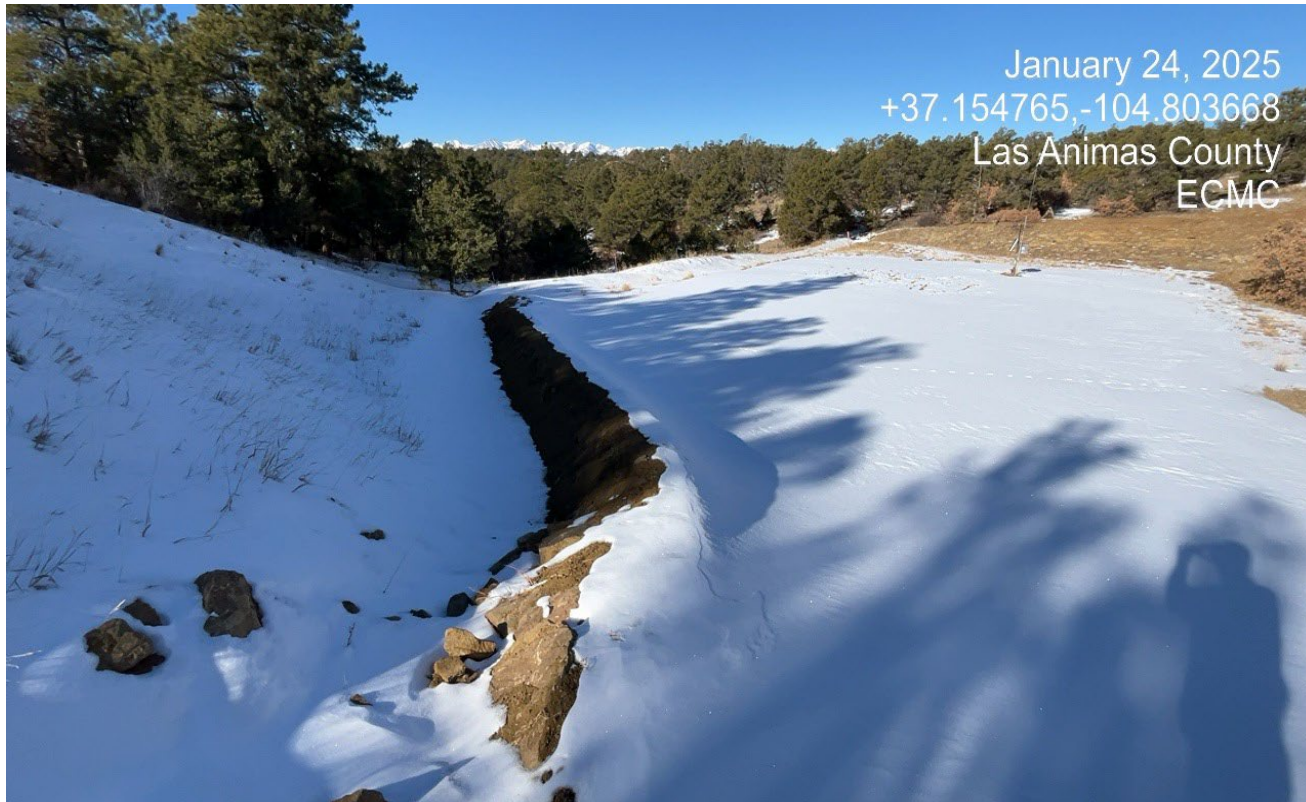
Photo 2. There is rock rip/rap and a berm installed at the base of the cut slope.