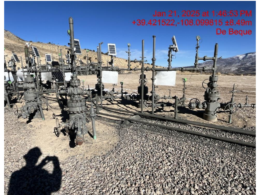
Photo # 3023 Paint staining the ground around equipment & flowlines in multiple areas on location