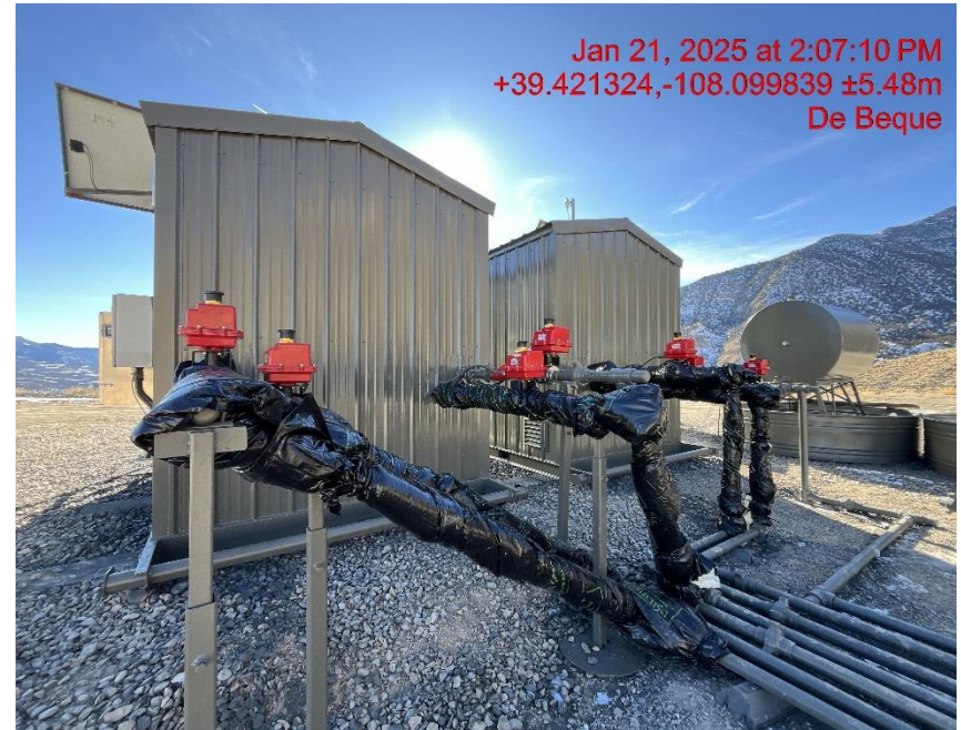
Photo # 3035 Paint staining the ground around equipment & flowlines in multiple areas on location