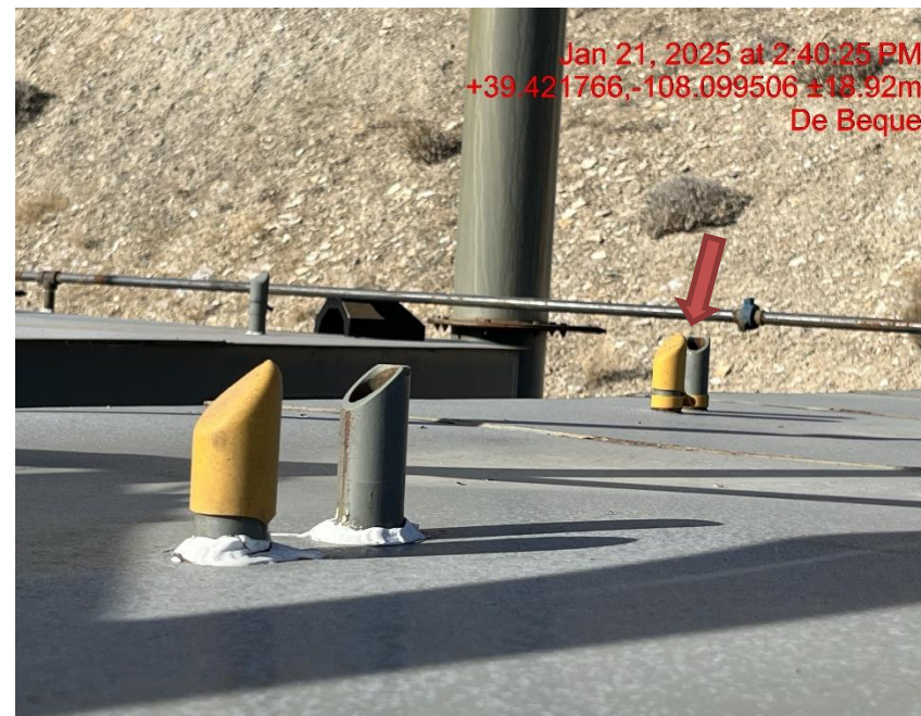
Photo # 3076 PRV vent lines do not comply with CECMC pressure safety device rules