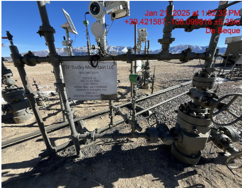
Photo # 3027 Paint staining the ground around equipment & flowlines in multiple areas on location