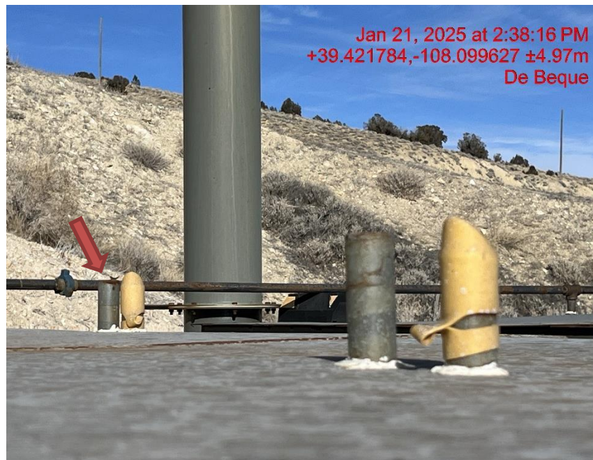
Photo # 3074 PRV vent lines do not comply with CECMC pressure safety device rules