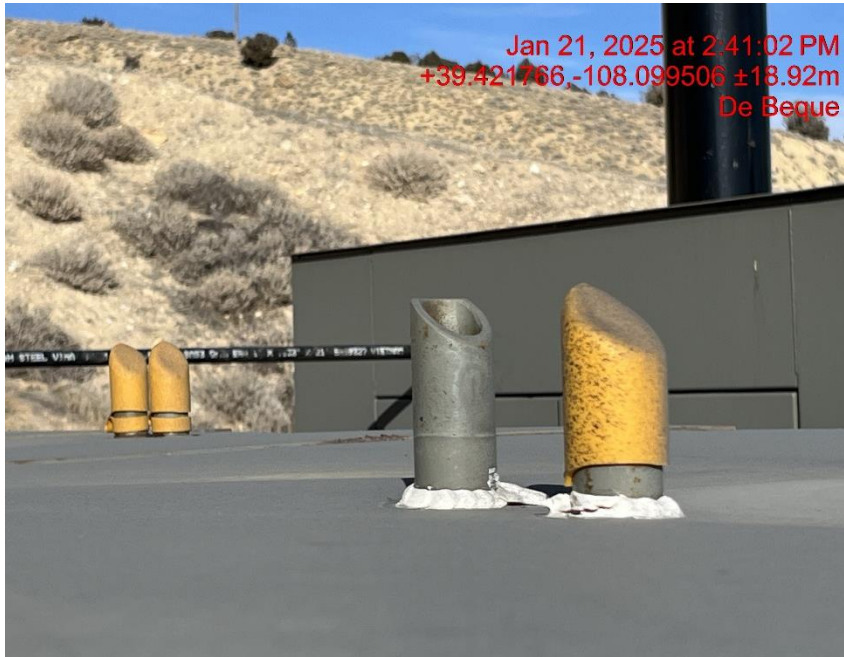
Photo # 3077 PRV vent line does not comply with CECMC pressure safety device rules