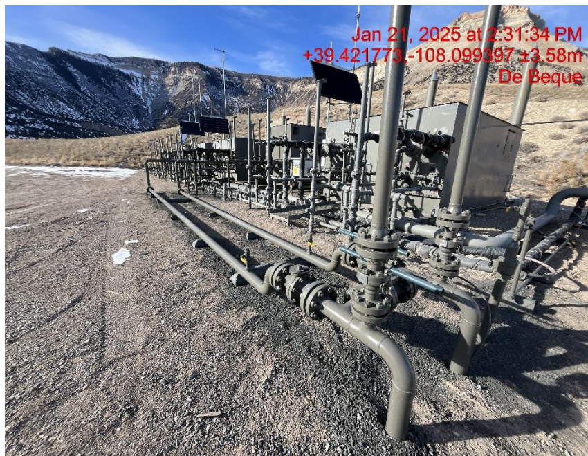
Photo # 3065 Paint staining the ground around equipment & flowlines in multiple areas on location