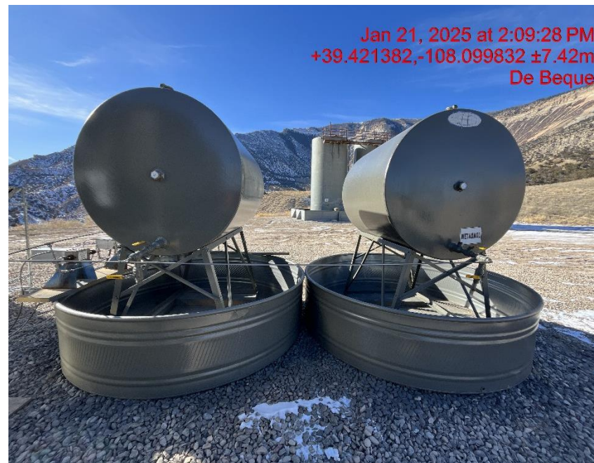
Photo # 3039 Chemical tanks lack required labeling/do not comply with CECMC rules