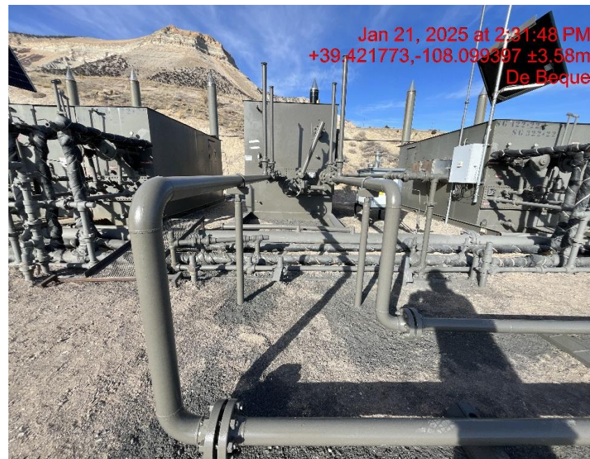
Photo # 3066 Paint staining the ground around equipment & flowlines in multiple areas on location