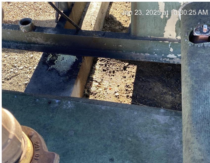
Oily waste and staining at treater