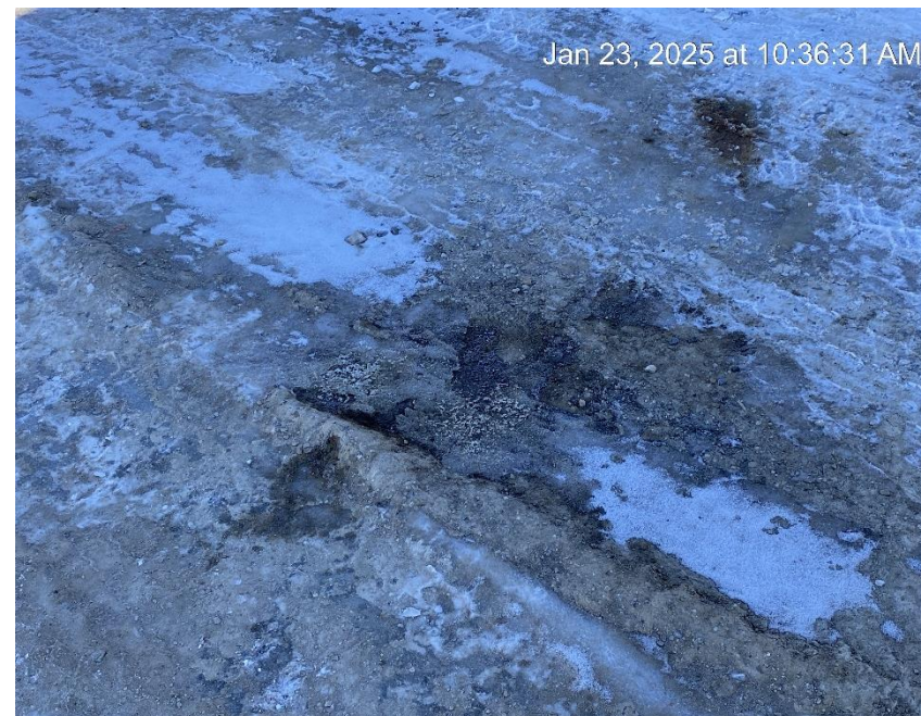
Soil staining at truck load out