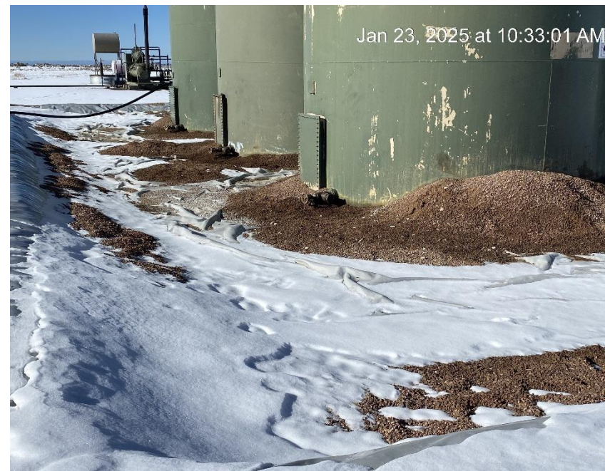
Stained material throughout tank battery