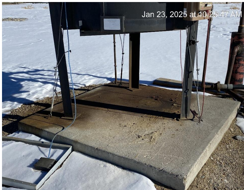
Staining below combustor