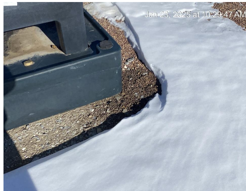
Staining around chemical tank