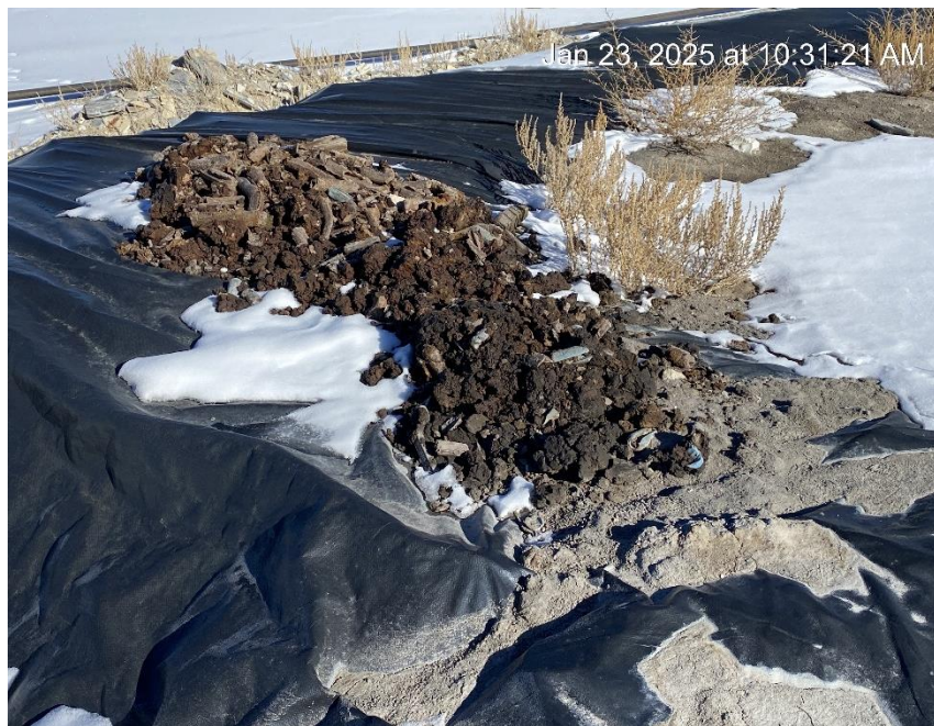
Oily waste inside unidentified drilling pit