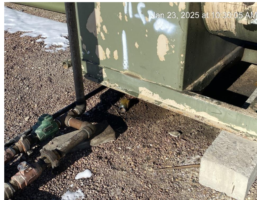
Staining around treater