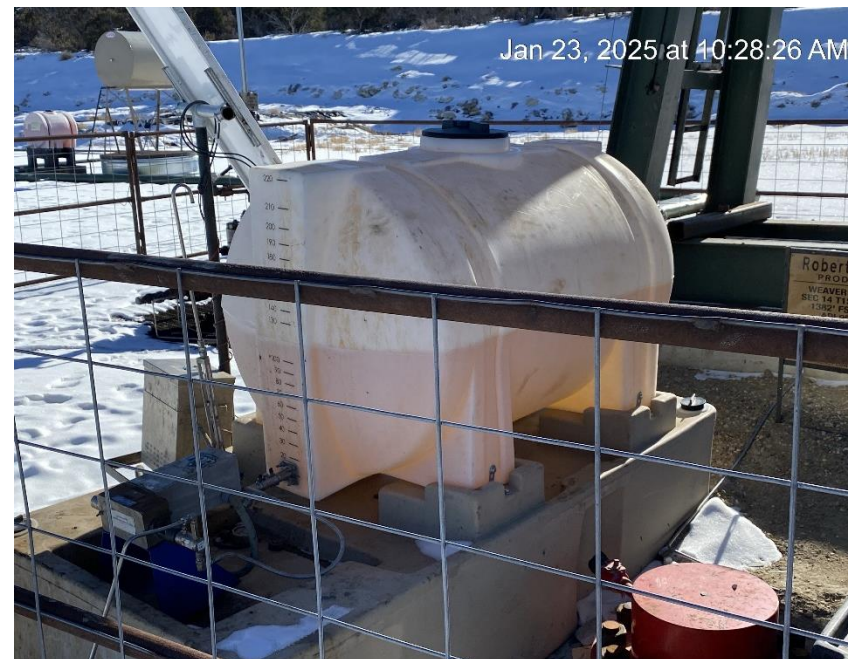
Unlabeled chemical tank