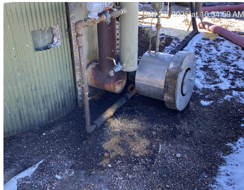
Oily waste and staining