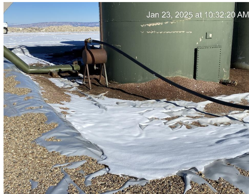
Stained material throughout tank battery