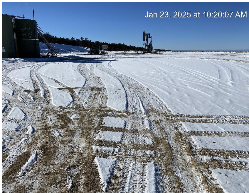
Location from Northeast entrance