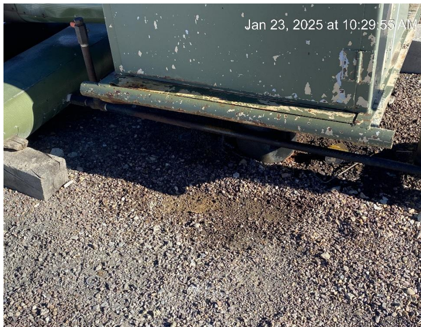
Staining around treater