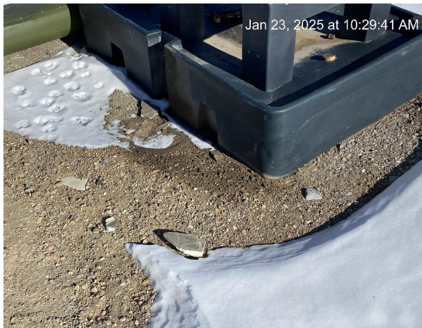
Staining around chemical tank