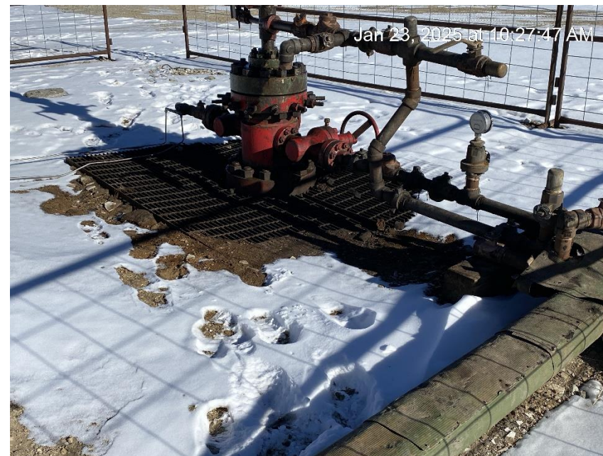
Staining around wellhead