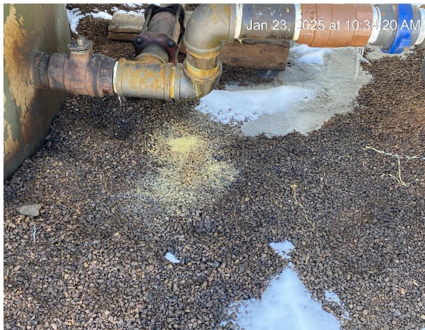
Oily waste and staining