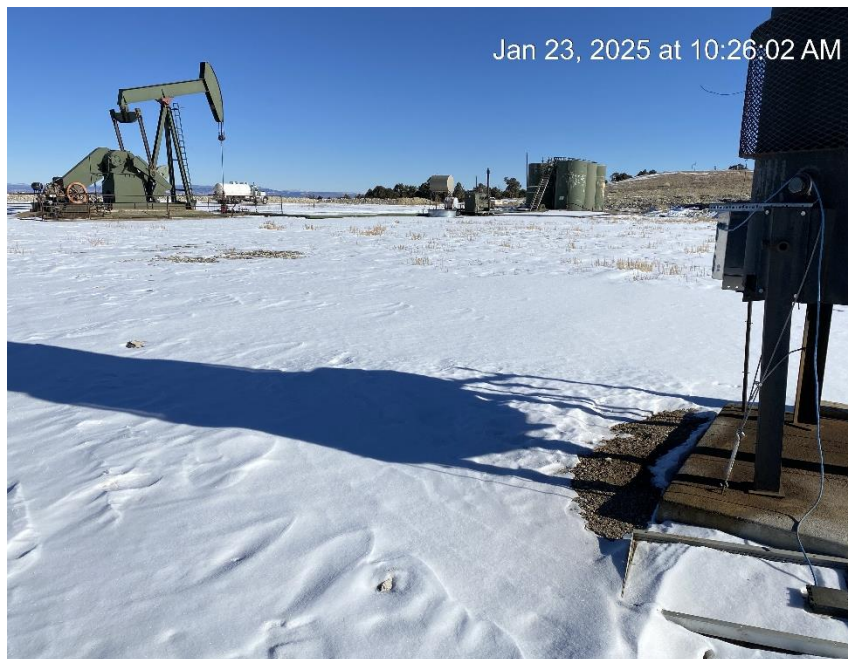
Location from Southwest corner