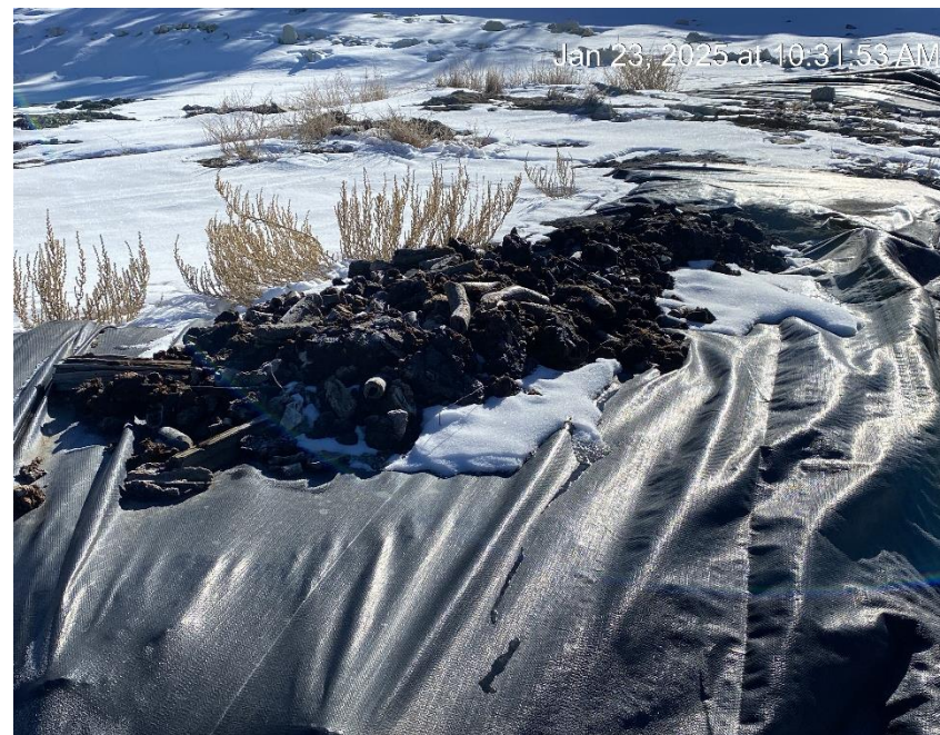
Oily waste inside unidentified drilling pit