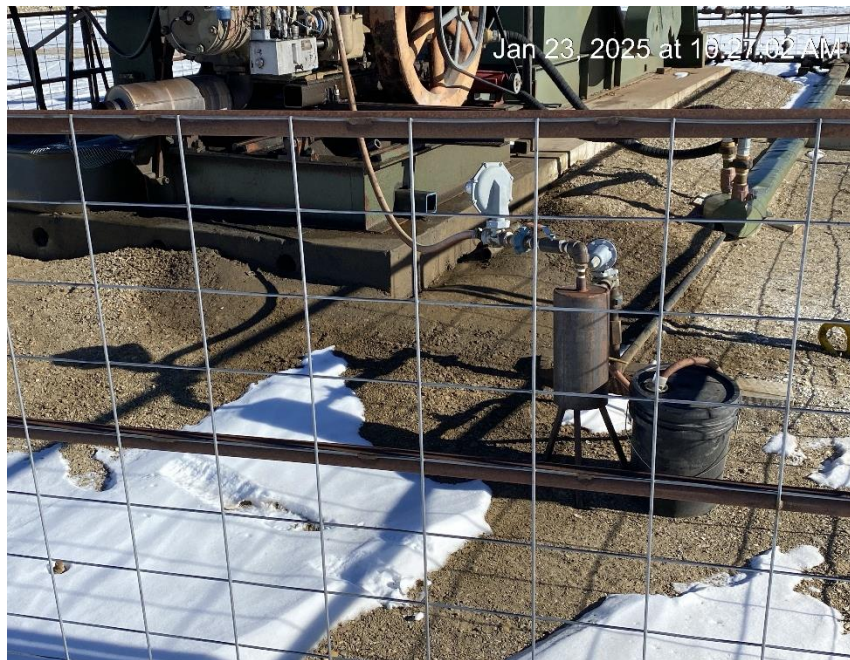
Staining from engine leaks