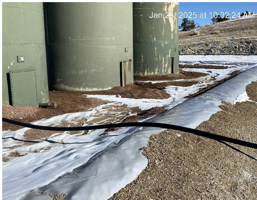
Stained material throughout tank battery