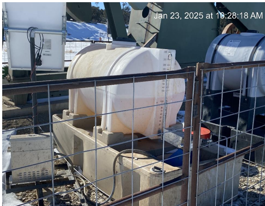
Unlabeled chemical tank