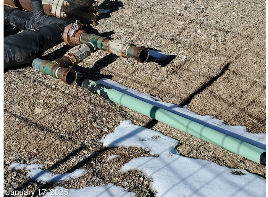
Photo 3: Pipe/Lines on the east end of the separator equipment are open/exposed.