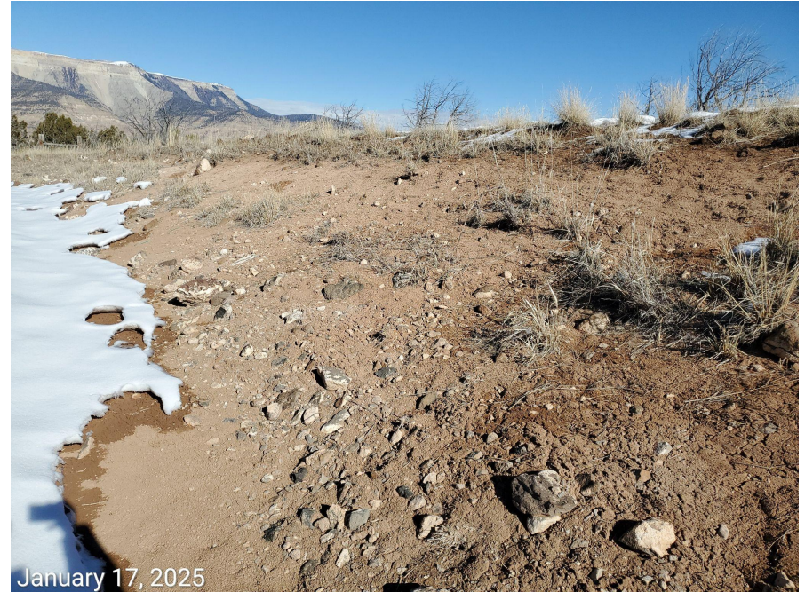
Photo 4: Photos taken from the east end of the Location. Photo shows areas of the Location where vegetation establishment is not uniform; soils are predominantly bare. Additional reclamation efforts required within these areas.