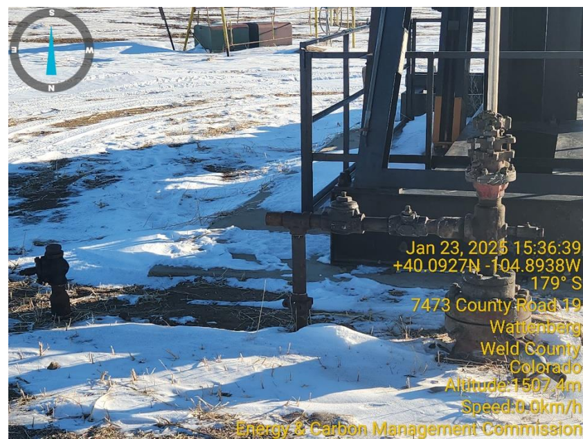
Photo 2 Wellhead.