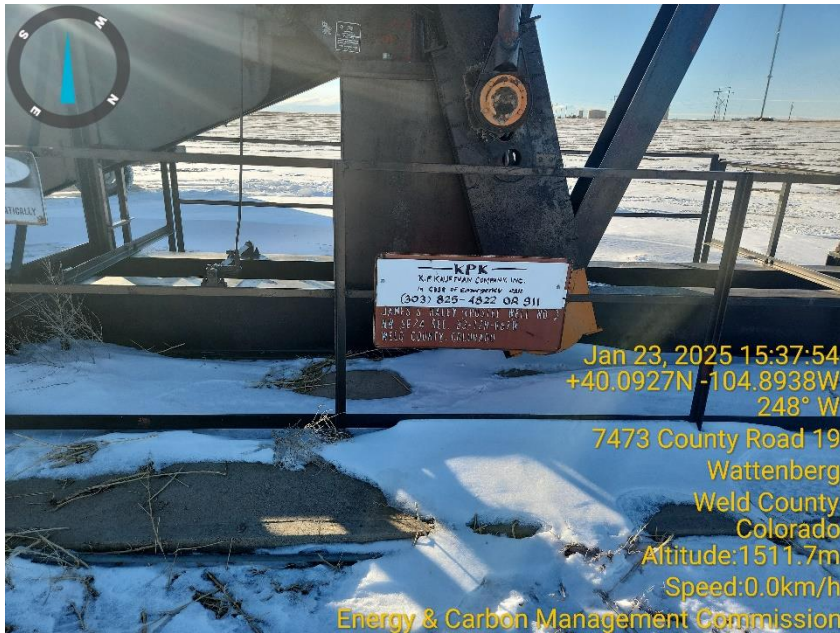
Photo 3 Wellhead sign.