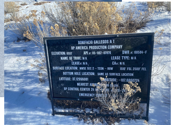
Photo 1. View of well pad taken from the access point facing center.