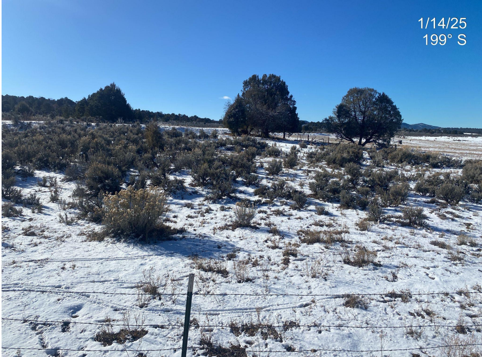
Photo 4. Reference area composed of Big Sagebrush, Rubber Rabbitbrush and Broom Snakeweed.