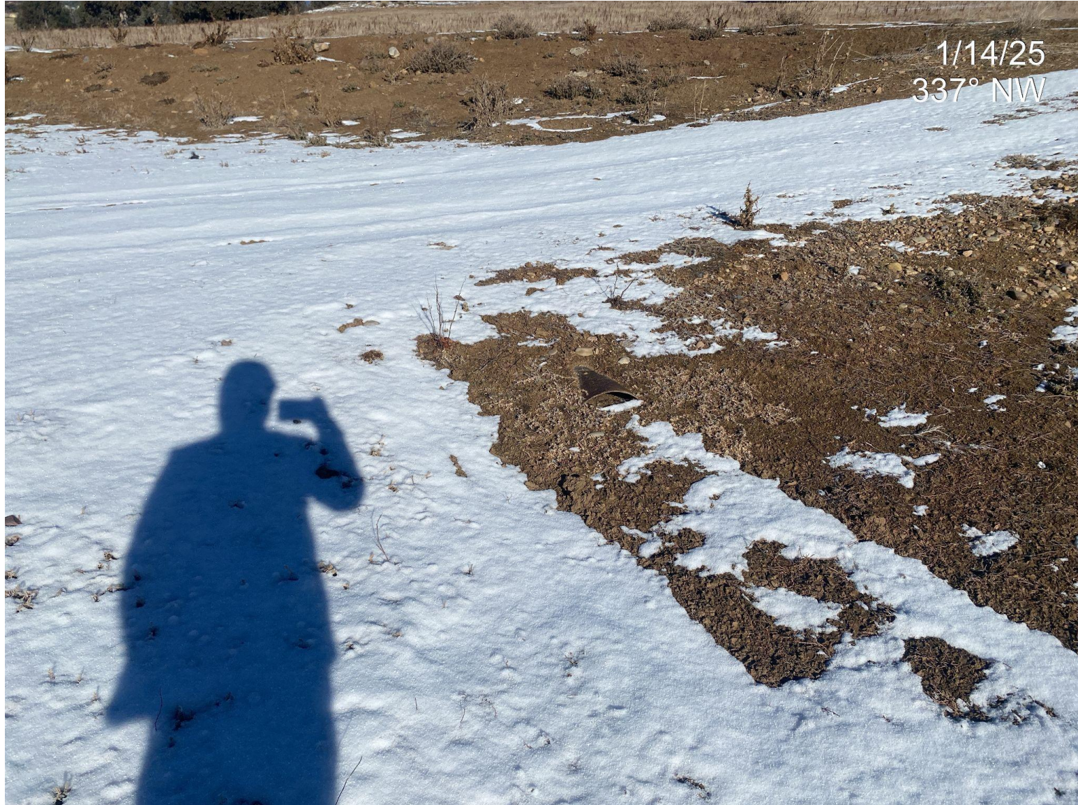
Photo 3. Culvert on the northern edge of the pad has filled with sediment and is no longer functioning properly.