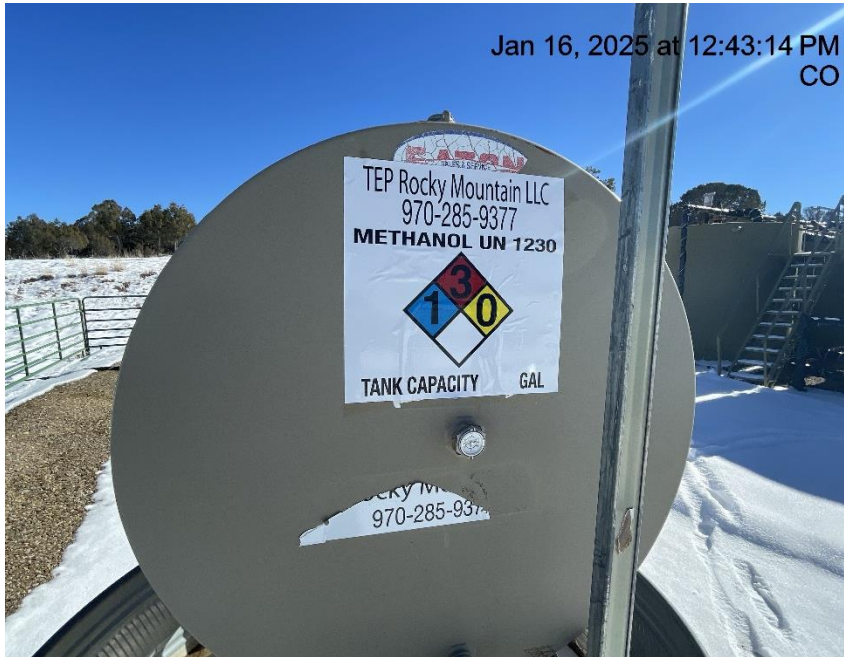
Photo # 9686 New tank label missing required information/ not in compliance with CECMC rules