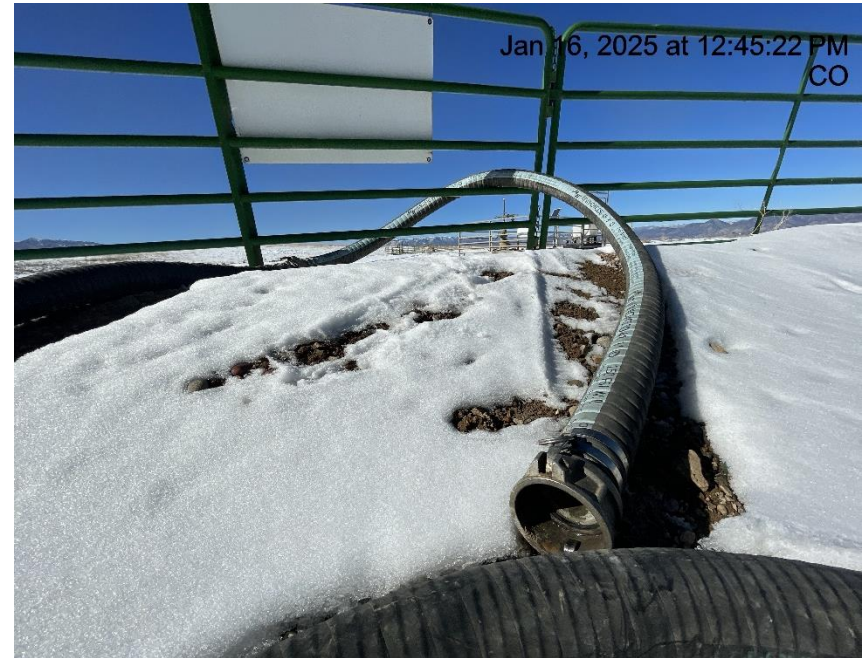
Photo # 9685 Open ended hose/load line - additionally this is also a wildlife hazard