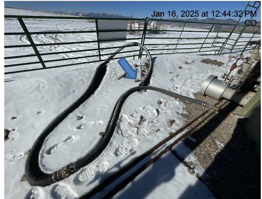
Photo # 9684 Open ended hose/load line - additionally this is also a wildlife hazard