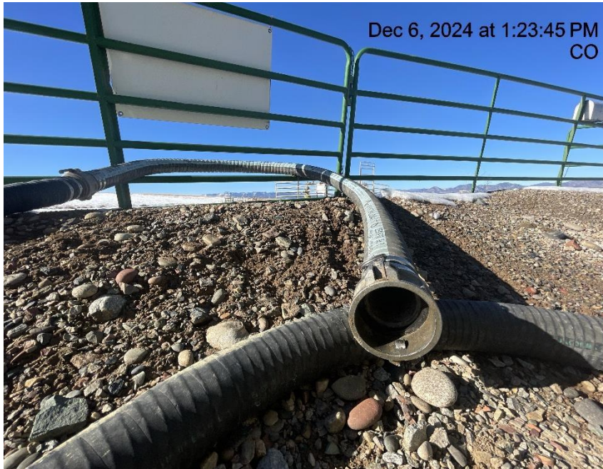
Photo # 2707 From inspection 708905240 conducted on 12/06/2024 Open ended load line