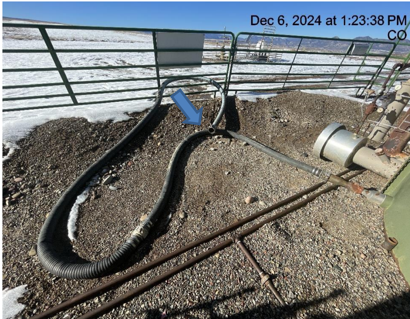
Photo # 2706 From inspection 708905240 conducted on 12/06/2024 Open ended load line