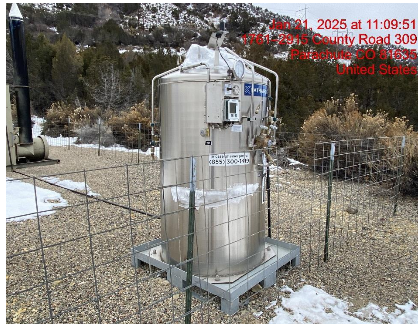
Location – Photo #06072