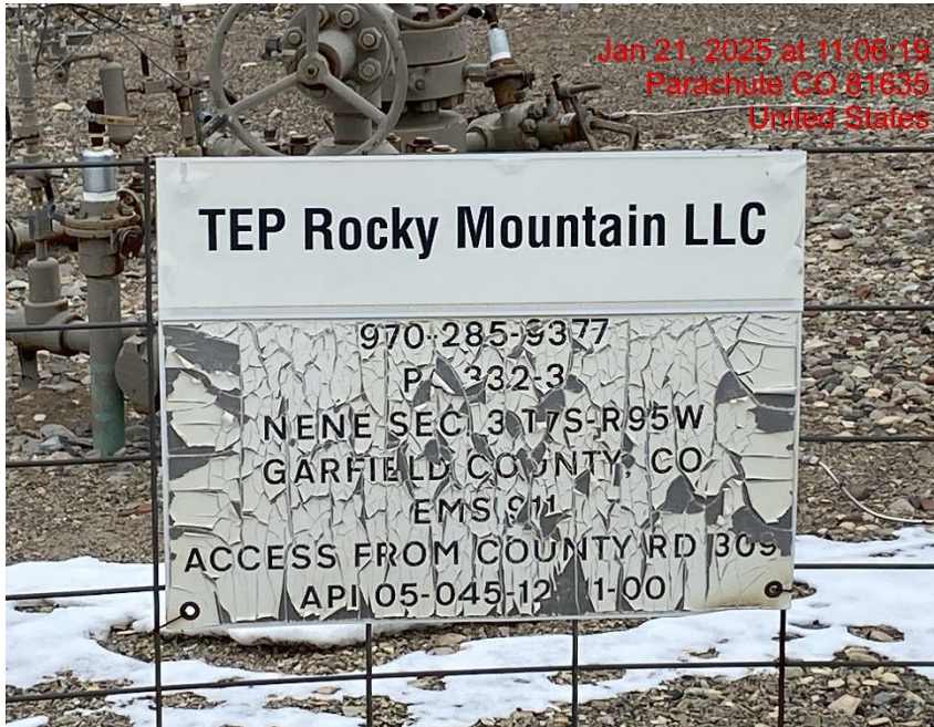
Weathered Wellhead Sign – Photo #06065