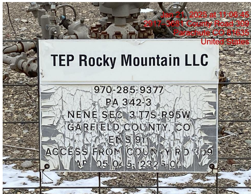
Weathered Wellhead Sign – Photo #06067