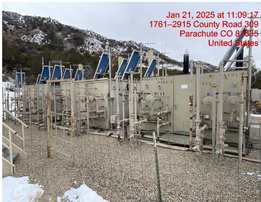
Location – Photo #06071