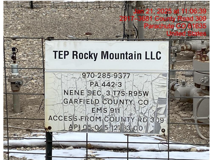
Weathered Wellhead Sign – Photo #06066