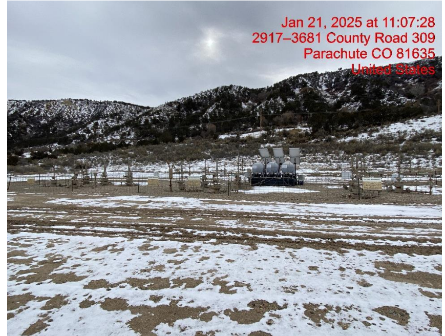
Location – Photo #06068