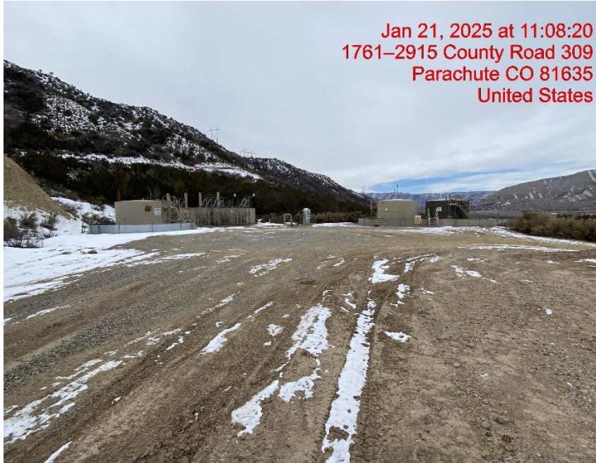
Location Overview – Photo #06069