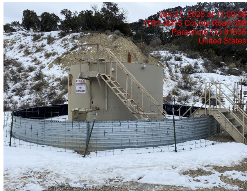
Location – Photo #06070