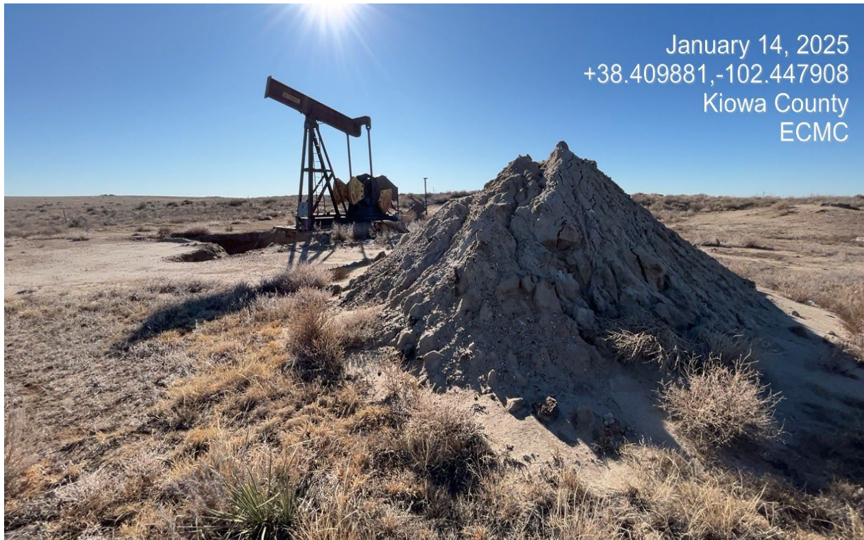
Photo 5. It appears this pile is impacted soils from the excavation. This pile is not stored with liner or berm to prevent contamination. Impacted soils need to be removed.