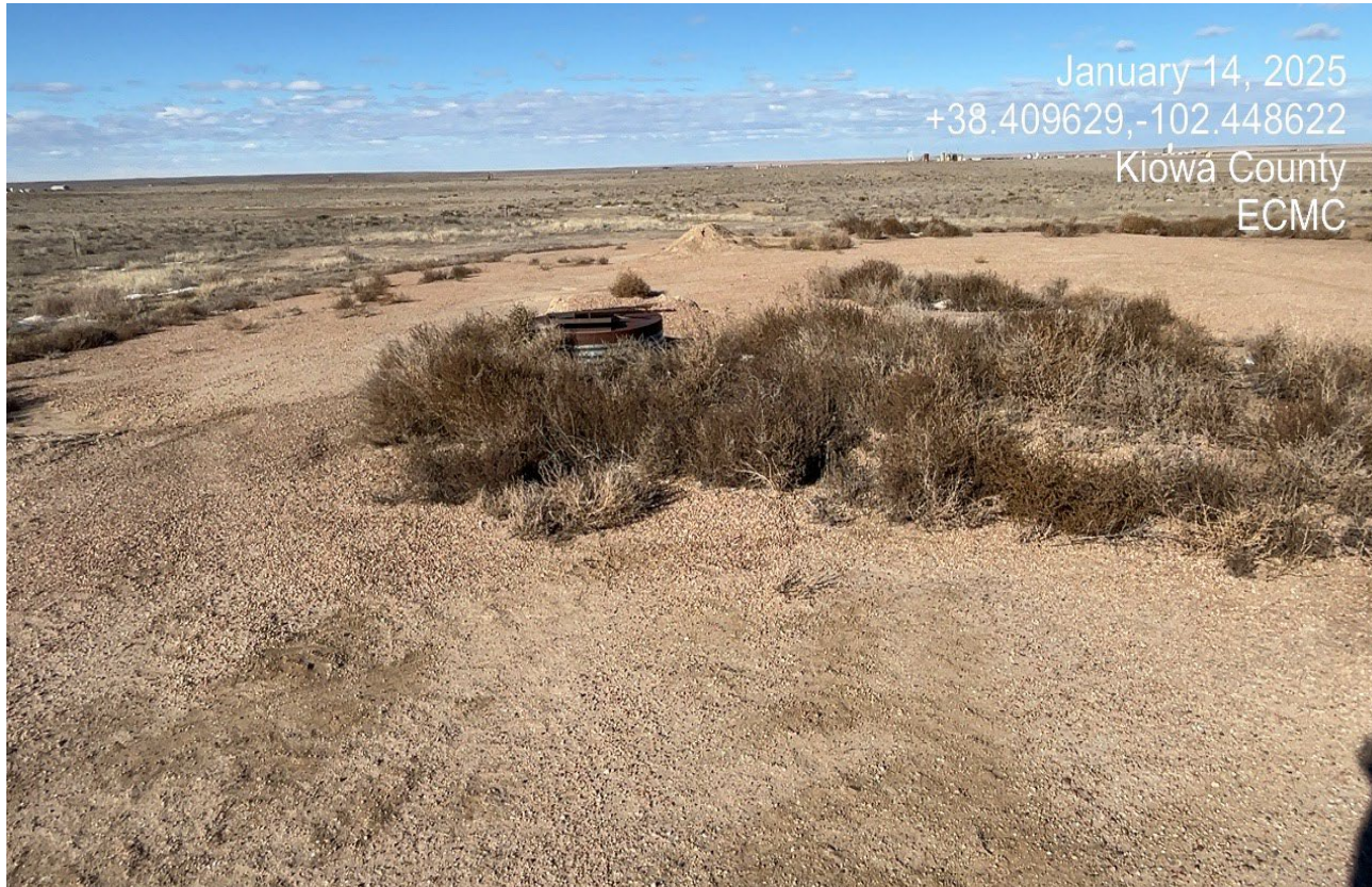
Photo 2. Facing north where the tank battery was location. The reclamation has not commenced at this location.