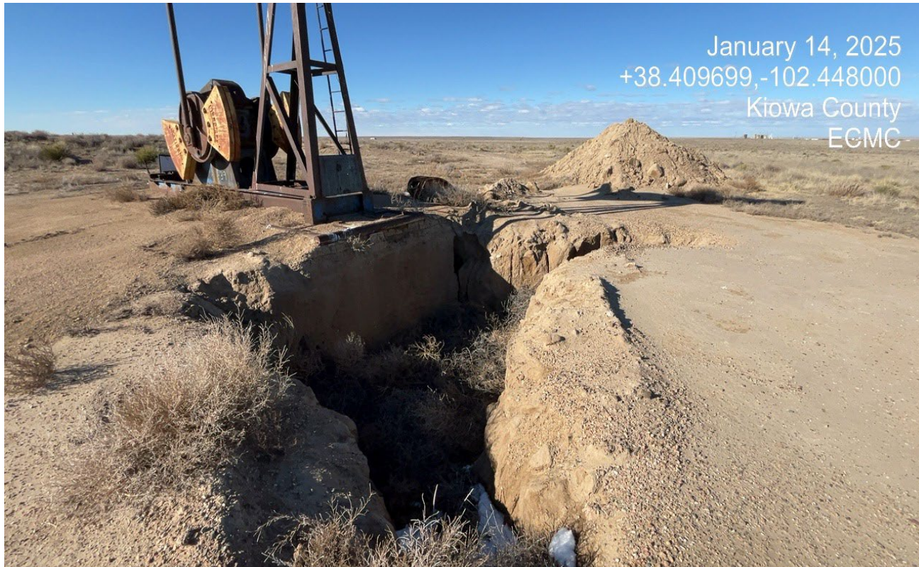
Photo 4. There is an open excavation at the wellhead from remediation. This area needs to be protected to prevent wildlife or livestock from falling in.