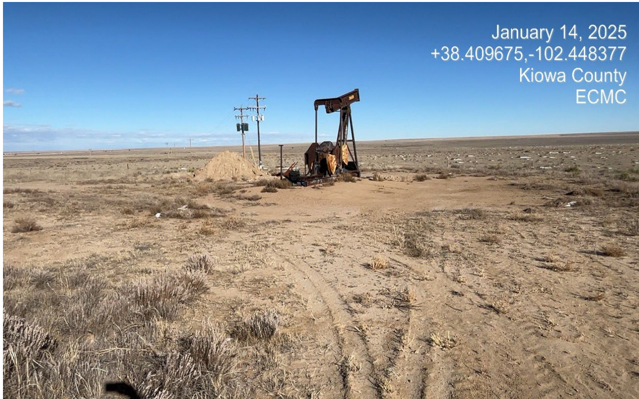
Photo 3. Facing northeast toward the wellsite. The well has been plugged and abandoned. The pumpjack and electric utilities must be removed.