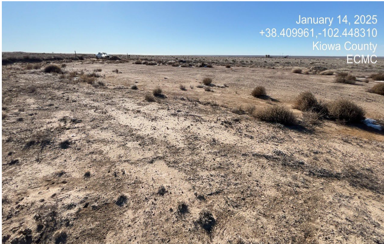
Photo 6. Facing southwest toward the disturbance area of the tank battery. It appears there may be impacted soils that will need to be remediated and reclaimed.