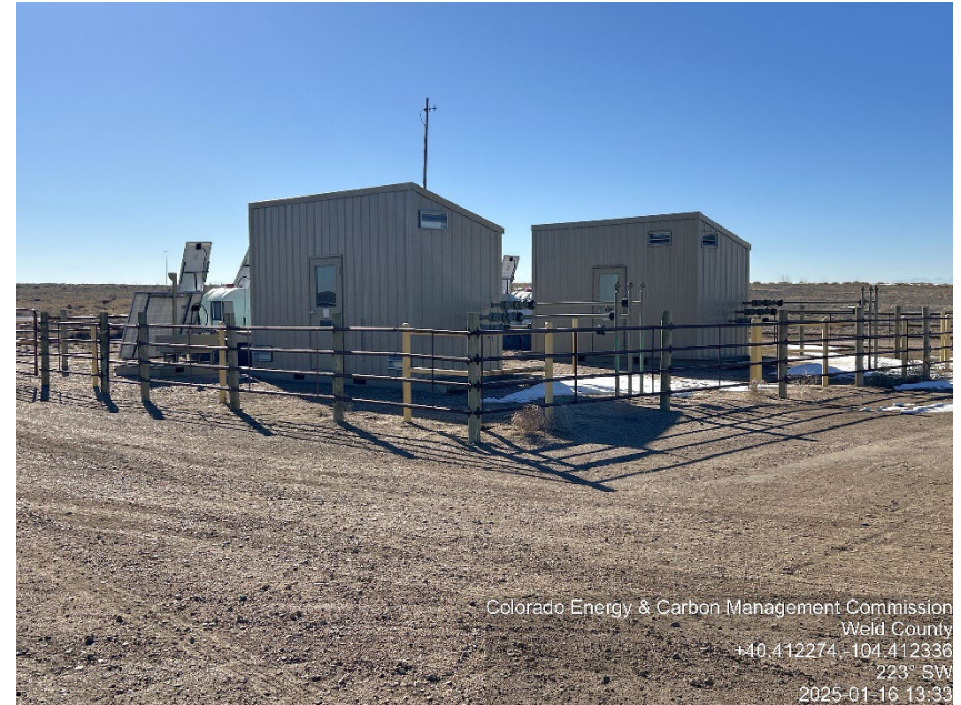
Photo #8 Wells Ranch BB11-12/Pad 6: Wellsites Gas Lift Manifolds Active