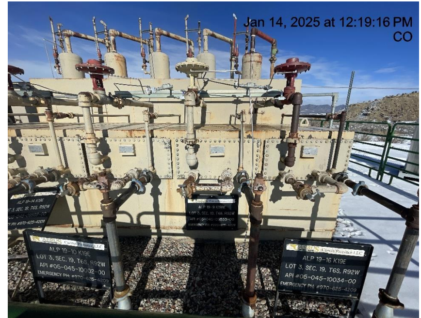
Photo # 8591 ALP 19-9 bradenhead line tied into separator /failure to comply with COA's