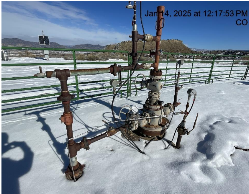
Photo # 8590 ALP 19-9 bradenhead line tied into separator /failure to comply with COA's