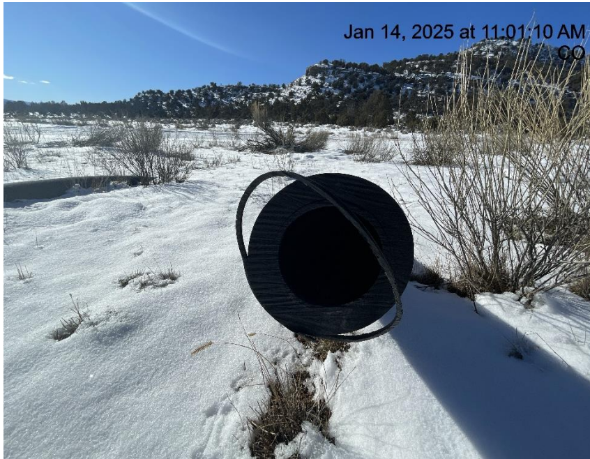
Photo # 8586 Poly pipe along lease road open ended /wildlife hazard/available for entry by wildlife