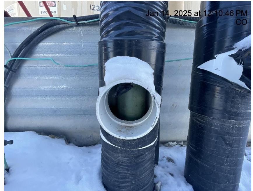
Photo # 8583 Flowline heating insulation open ended /wildlife hazard/available for entry by wildlife