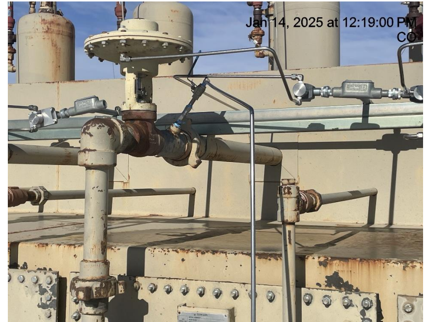
Photo # 8593 ALP 19-9 bradenhead line tied into separator /failure to comply with COA's