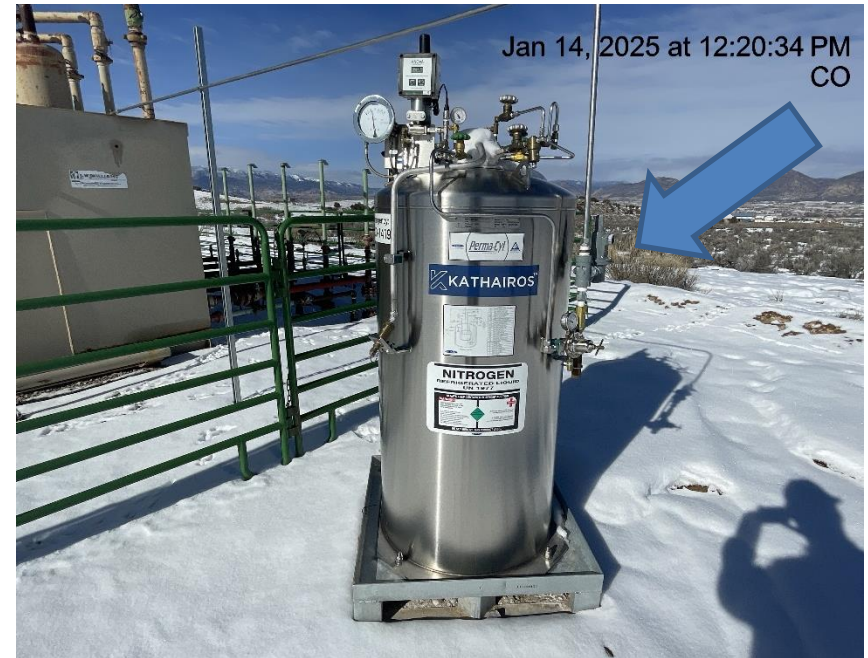
Photo # 8589 No FORM 4 SUNDRY for equipment/not in compliance with CECMC rules