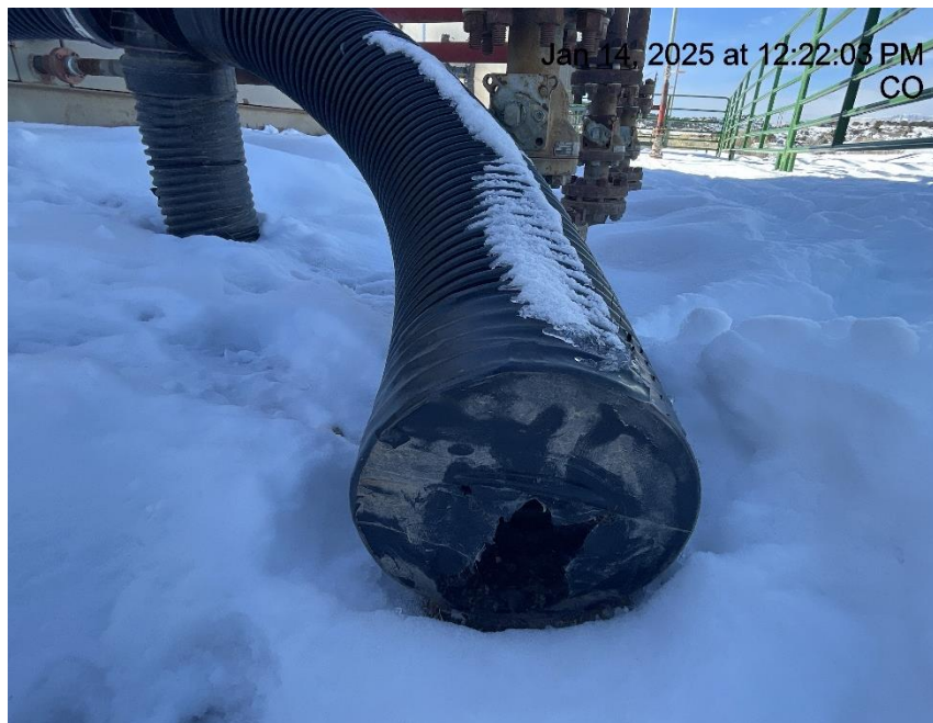
Photo # 8584 Flowline heating insulation open ended /wildlife hazard/available for entry by wildlife