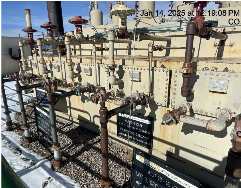
Photo # 8592 ALP 19-9 bradenhead line tied into separator /failure to comply with COA's