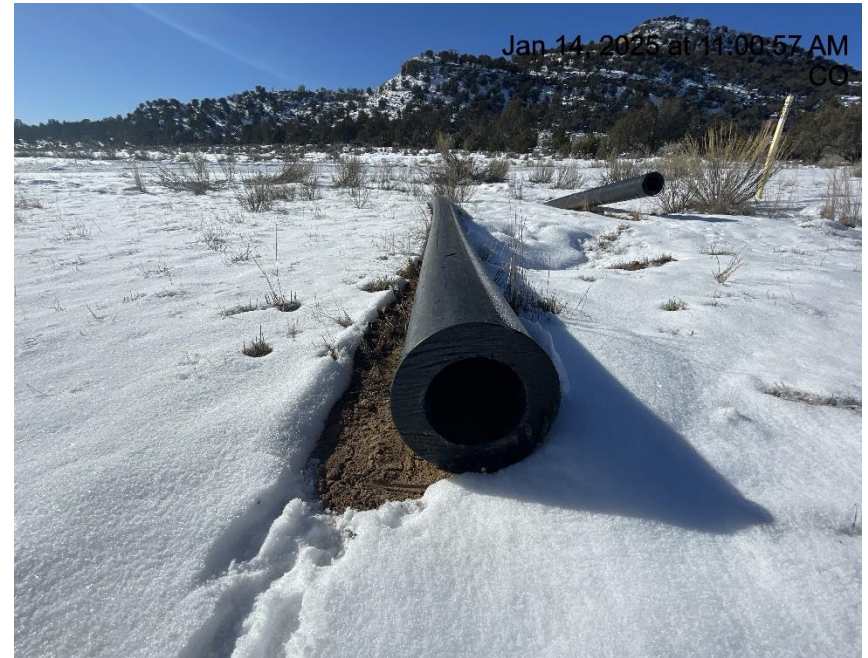
Photo # 8587 Poly pipe along lease road open ended /wildlife hazard/available for entry by wildlife