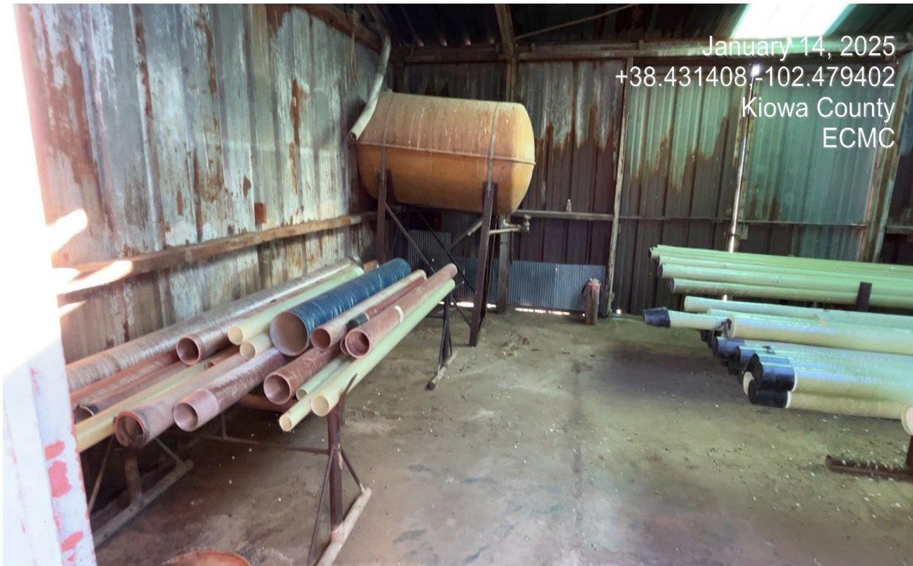
Photo 4. View of inside middle are of the shed. This area has been leaned out and pipe is stored inside.