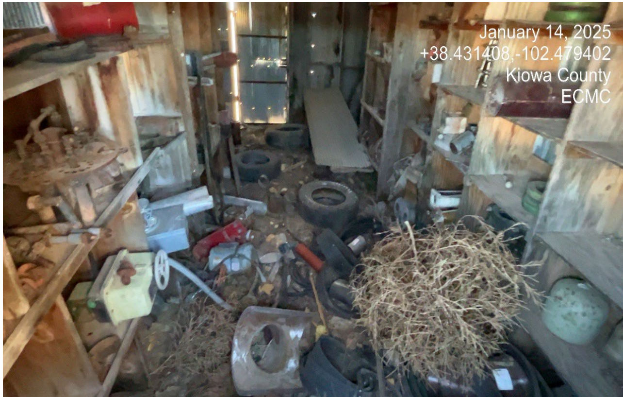
Photo 3. Facing inside the north side of the building. There is still various supplies and debris which must be cleaned up.