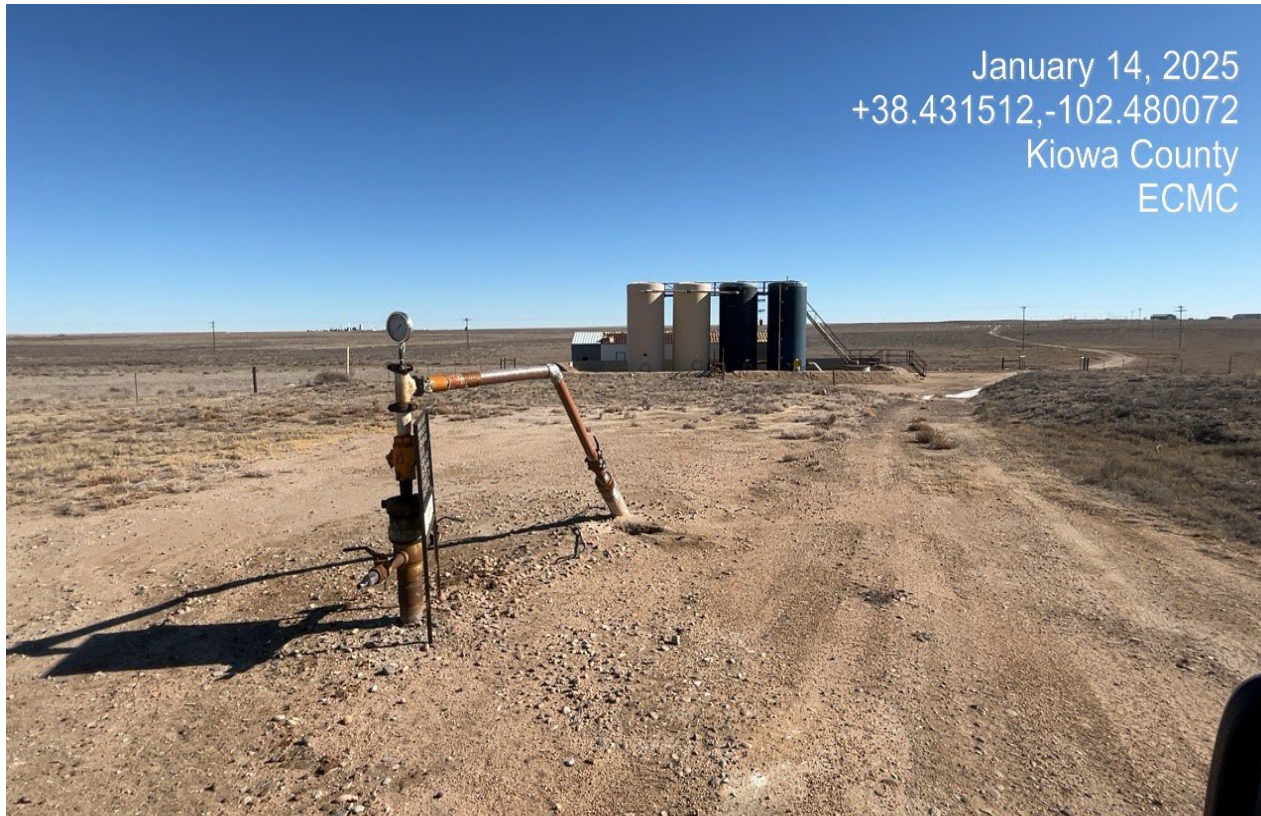
Photo 5. Standing at the wellhead facing east. Sign is posted at wellhead.