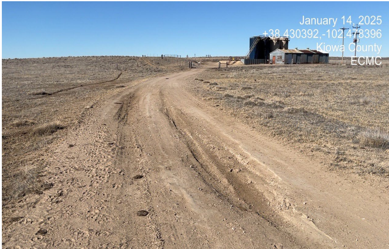
Photo 1. Facing northwest along the access road toward the location. This area of the road is rutted and will require maintenance.