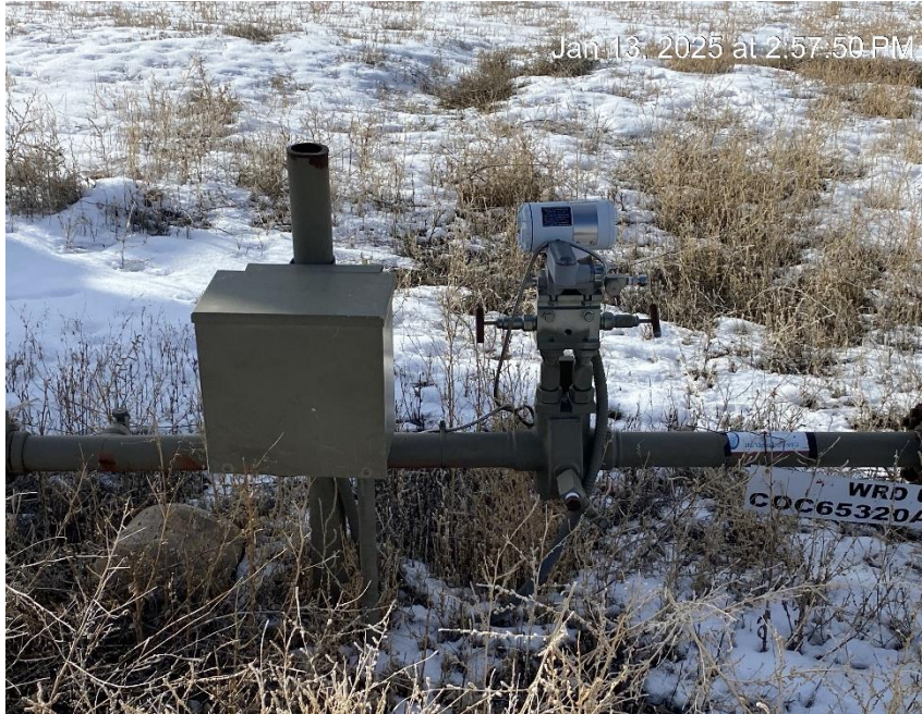
25-44W. No calibration card.