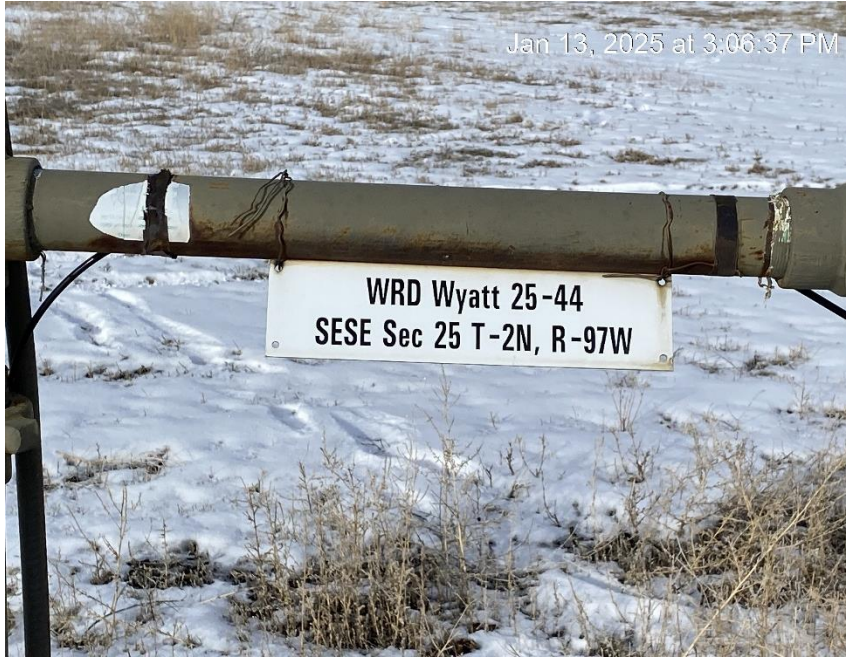
When replaced additional information is required