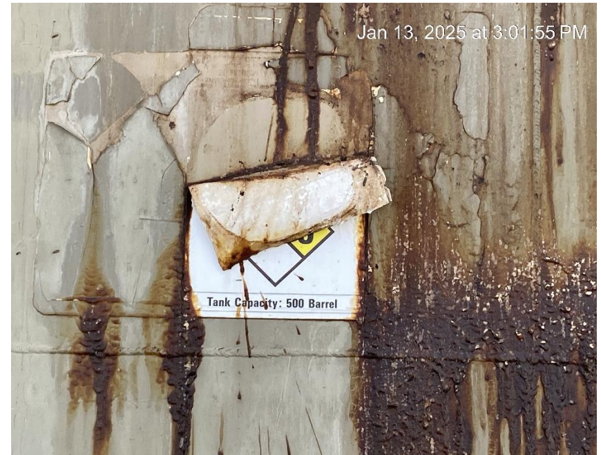
Oily waste. Damaged tank label.