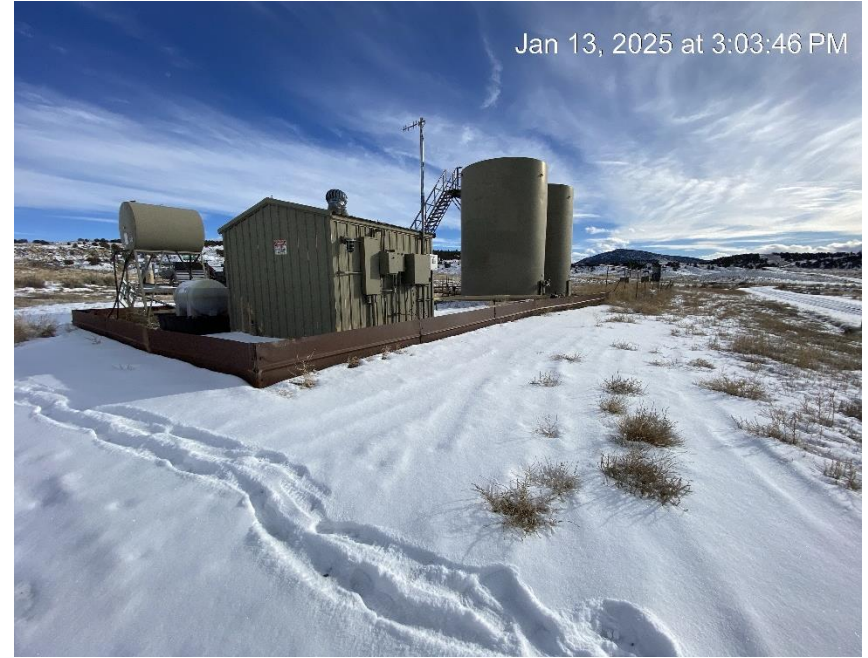
Location from Northwest corner and entrance