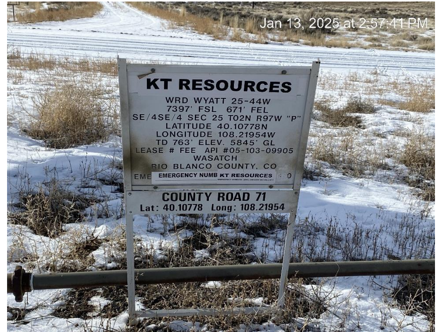
Sign along flow line. No production equipment.