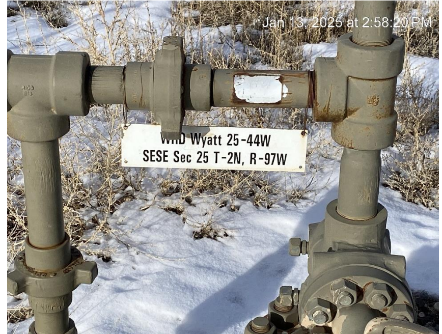
When replaced additional information is required