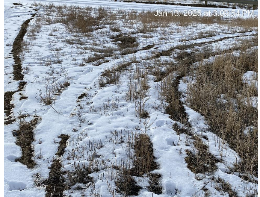
Erosion and vehicle tracking