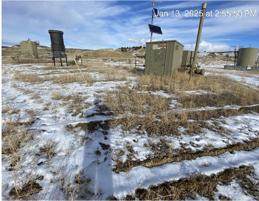
Location from Southwest corner and entrance