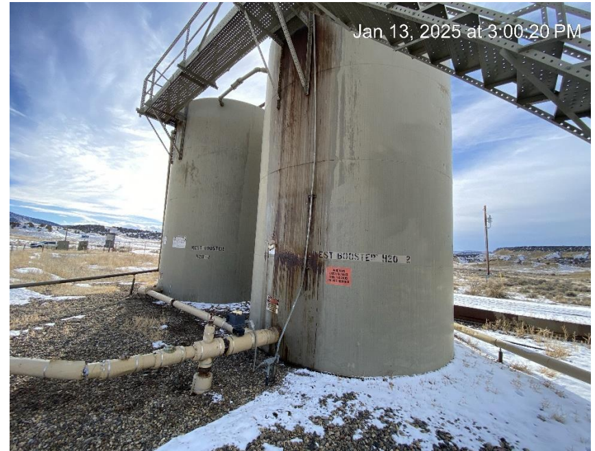
Previous spill and stained soils