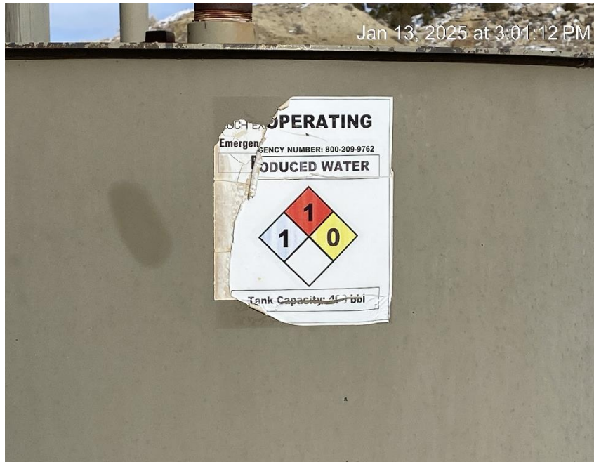
Damaged tank label