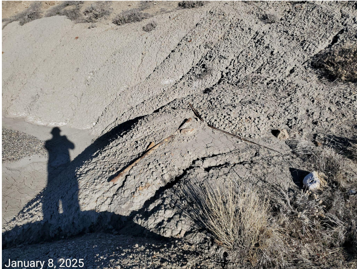
Photo 10: Photo shows trash/debris on the northeast end of the Location.