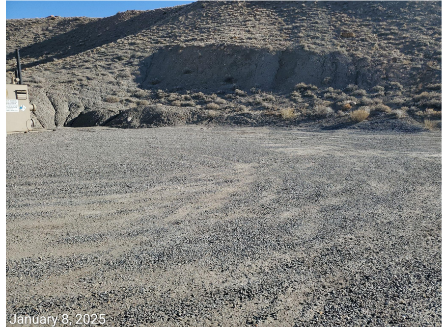
Photo 1: Photos 1-2 taken from the west end of the Location. Photos provide an overview of the Location north, northeast, southeast to south.