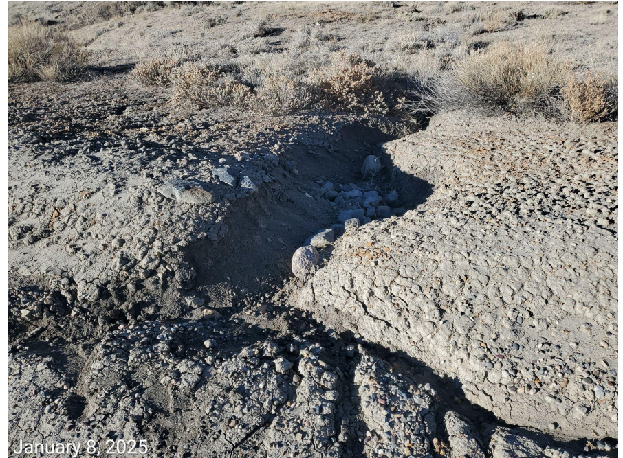
Photo 6: Photos examples showing erosion degradation on the west end of the Location has persisted; stormwater and erosion control measures to manage runoff in a manner that minimizes erosion, degradation and sediment transport remain missing or insufficient.