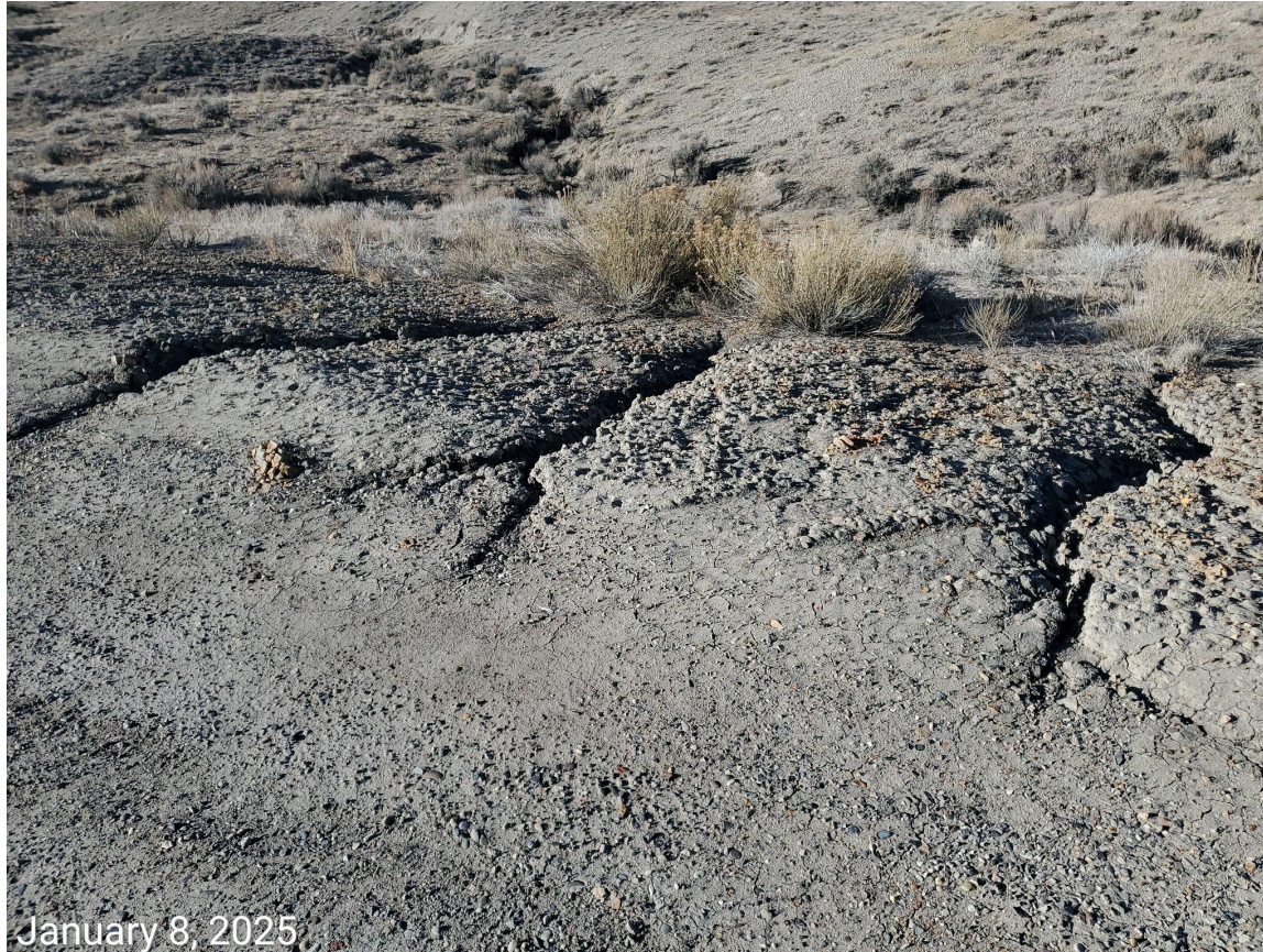
Photo 7: Photo examples showing erosion degradation on the west end of the Location has persisted; stormwater and erosion control measures to manage runoff in a manner that minimizes erosion, degradation and sediment transport remain missing or insufficient.