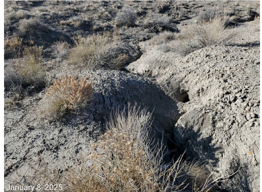
Photo 8: Photos examples showing erosion degradation on the south end of the Location has persisted; stormwater and erosion control measures to manage runoff in a manner that minimizes erosion, degradation and sediment transport remain missing or insufficient.