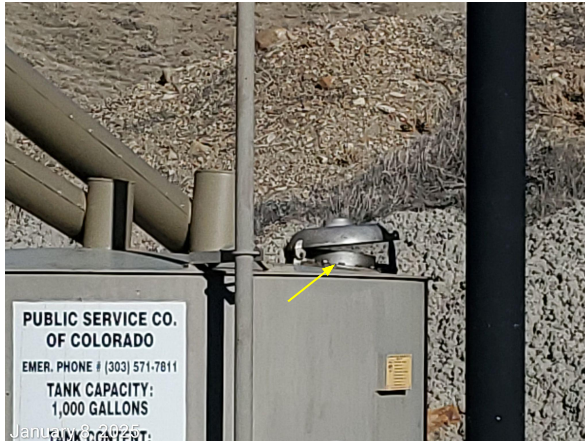
Photo 3: Photo shows hatch (arrow) at the produced water tank is open and currently venting to atmosphere.