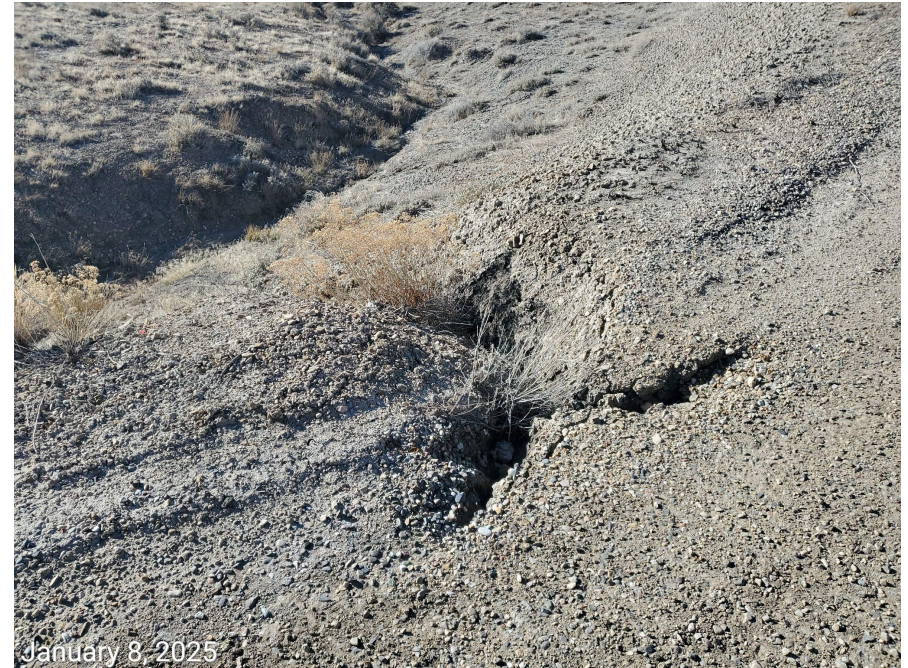
Photo 9: Photos examples showing erosion degradation at the access road has persisted; stormwater and erosion control measures to manage runoff in a manner that minimizes erosion, degradation and sediment transport remain missing or insufficient.