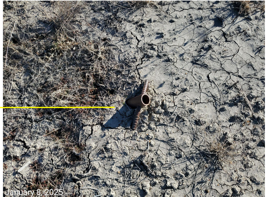
Photo 2: Photos 2-5 examples showing anchors on the Location have not been marked in accordance with 603.j/1003.a requirements.