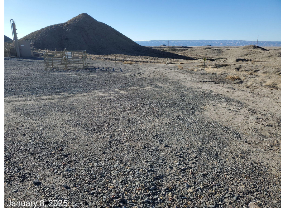
Photo 1: Photos taken from the north end of the Location. Photos provide an overview of the Location from southeast to southwest.