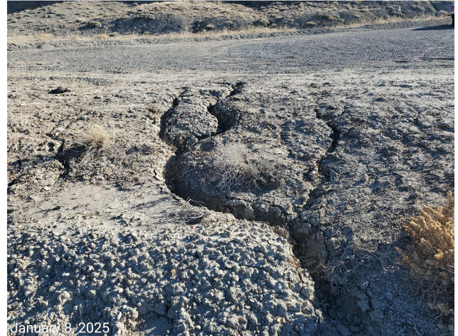
Photo 6: Photos 6-8 examples showing erosion degradation on the Location and access road has persisted; stormwater and erosion control measures to manage runoff in a manner that minimizes erosion, degradation and sediment transport remain missing or insufficient.