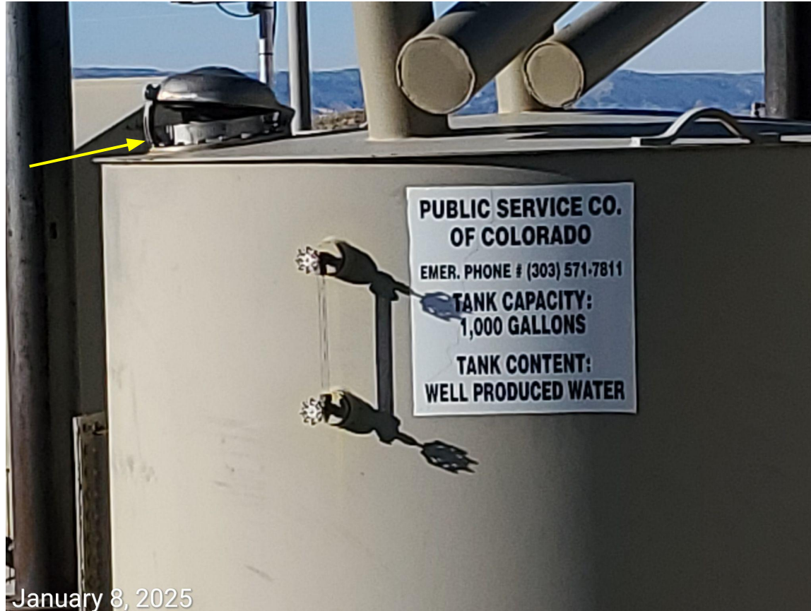
Photo 9: Photo shows hatch (arrow) at the produced water tank is open and currently venting to atmosphere.