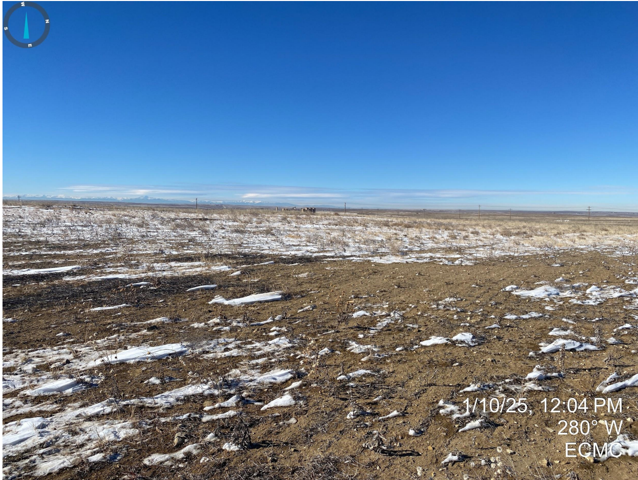
Photo 5. Facing west near the former well and tank battery location; see comments in Photo 2.