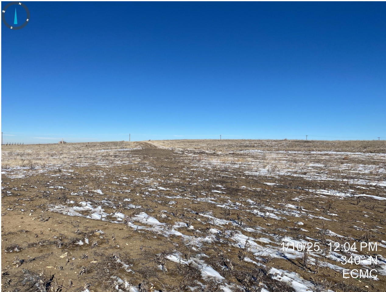
Photo 2. Facing north near the former well and tank battery location. It appears that road base material has been removed and the disturbance areas have been contoured and reseeded with evidence of drill rows and crimped mulch (much of the straw appears to have blown away).