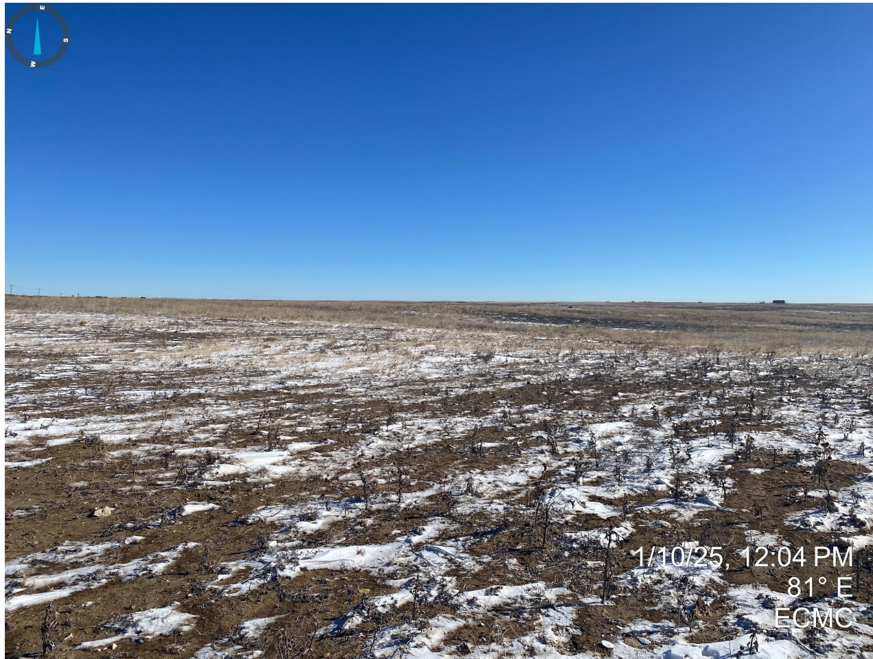
Photo 3. Facing east near the former well and tank battery location; see comments in Photo 2.