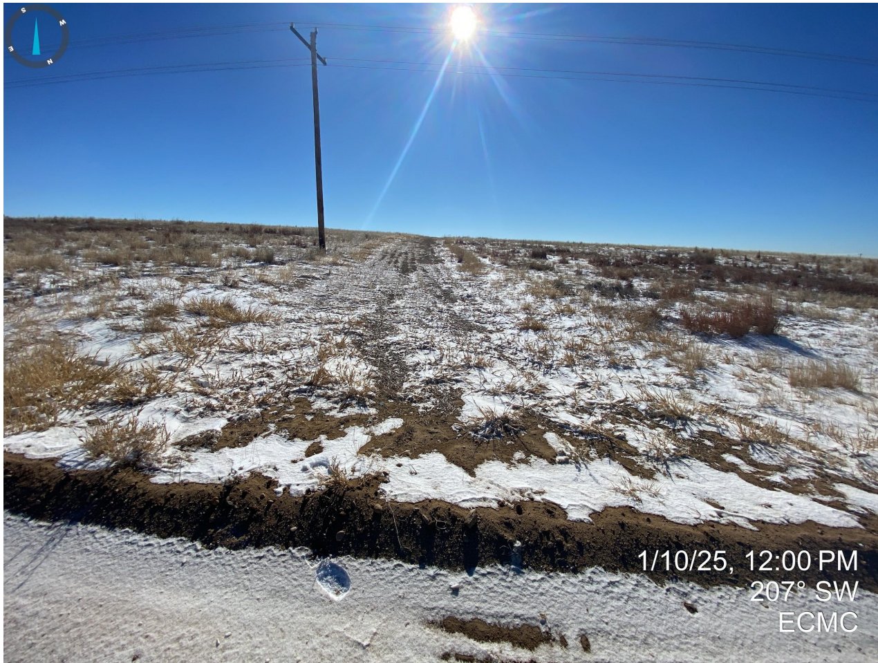
Photo 1. Facing southwest at the start of the access road. It appears that the access road has been contoured and graded to reflect the adjacent topography and the disturbance areas have been reseeded.