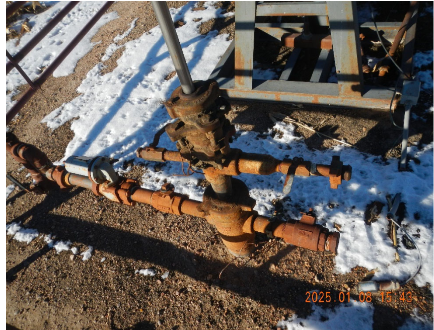
2. View of wellhead.