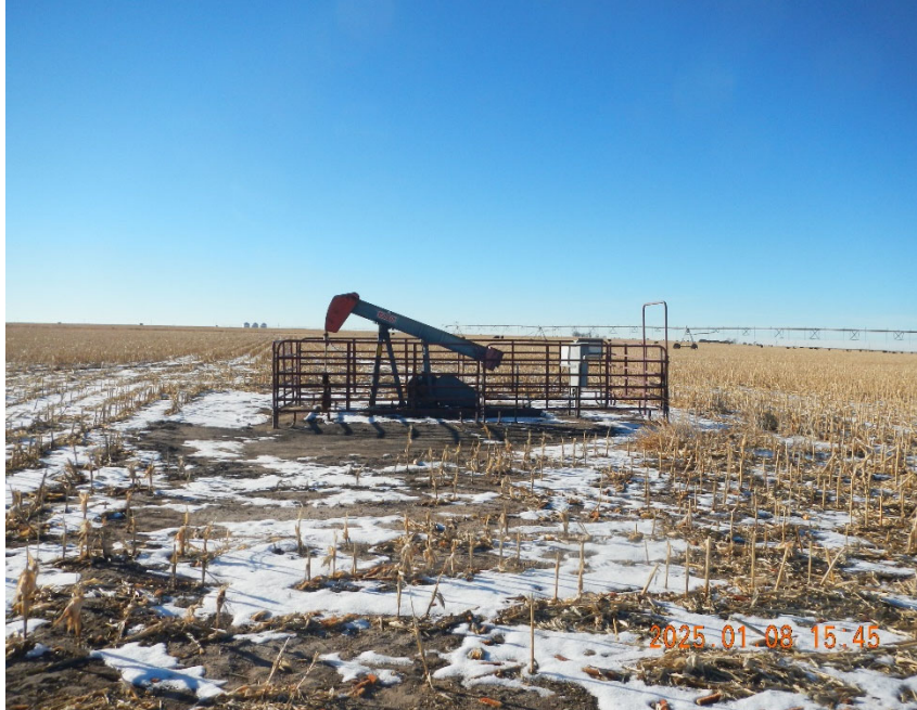
3. Well location overview.