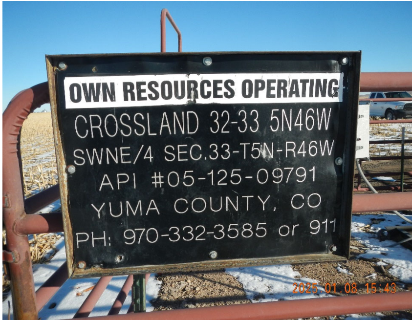
1. Lease sign at well location.