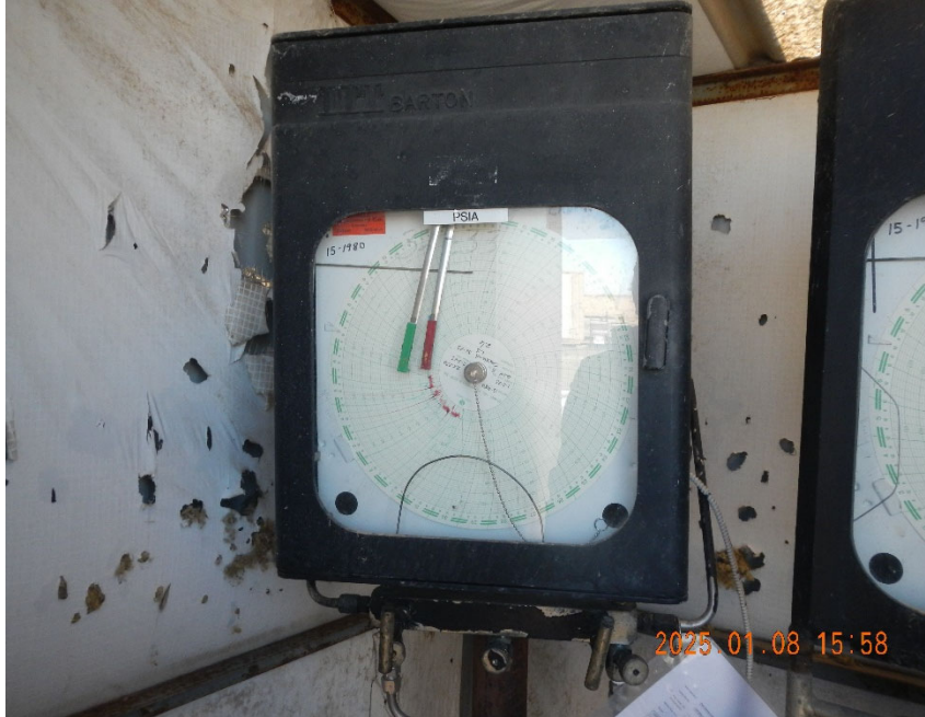
5. Gas meter inside meter shed.