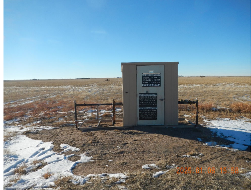
6. Gathering location overview.