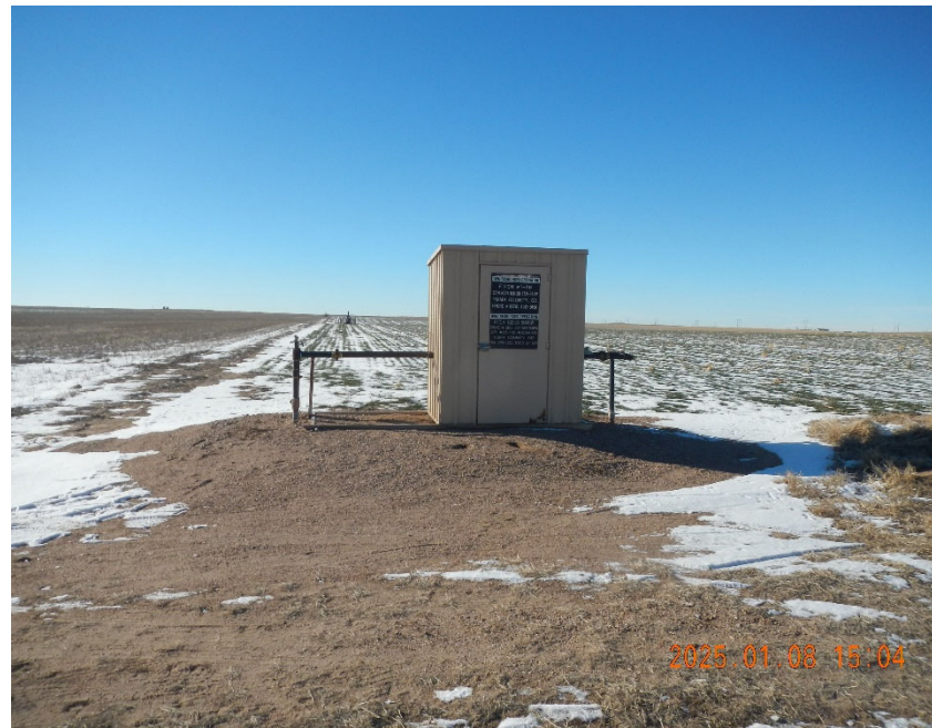
6. Gathering location overview.