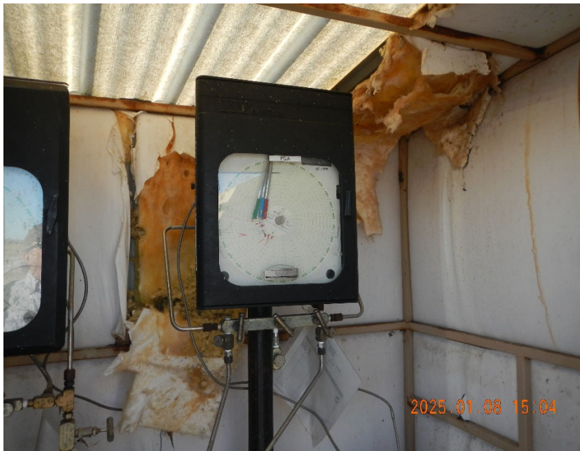
5. Gas meter inside meter shed.