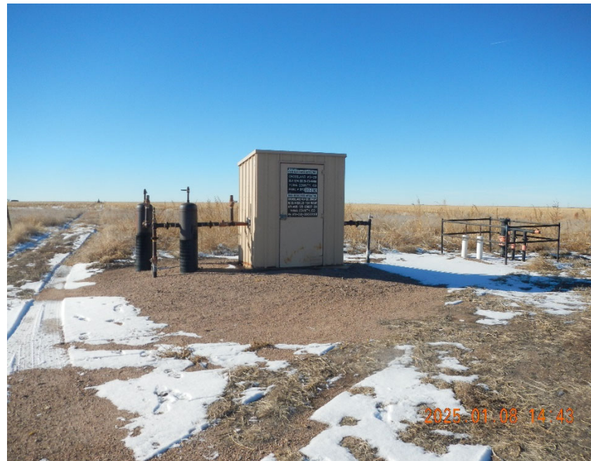
6. Gathering location overview.