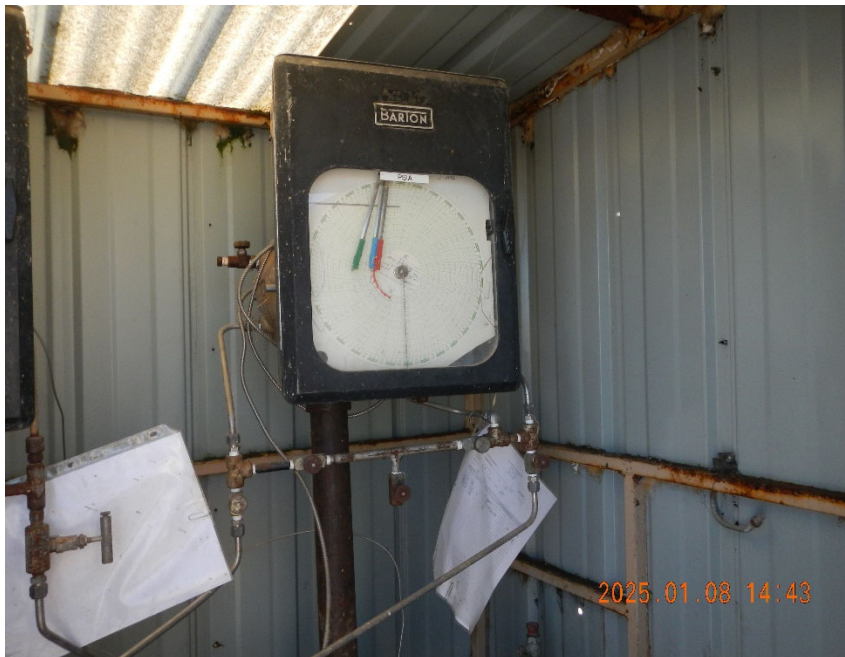
5. Gas meter inside meter shed.