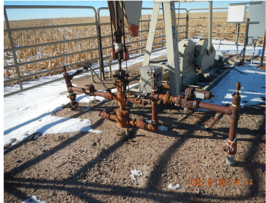
2. View of wellhead.