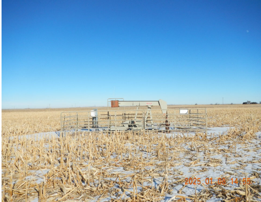
3. Well location overview.