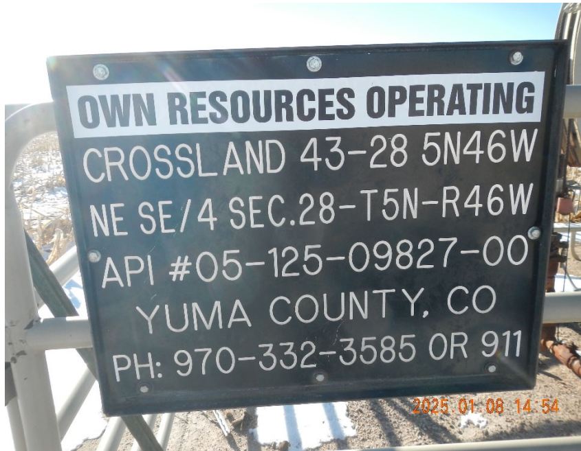
1. Lease sign at well location.