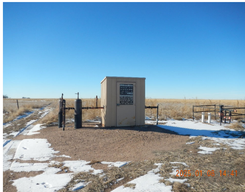
8. Gathering location overview.