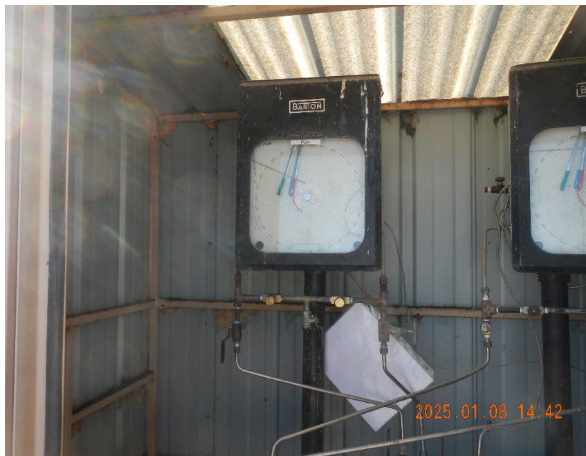
7. Gas meter inside meter shed.