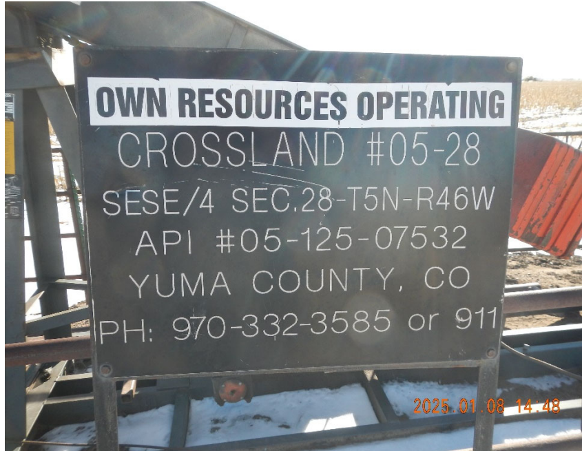
1. Lease sign at well location.