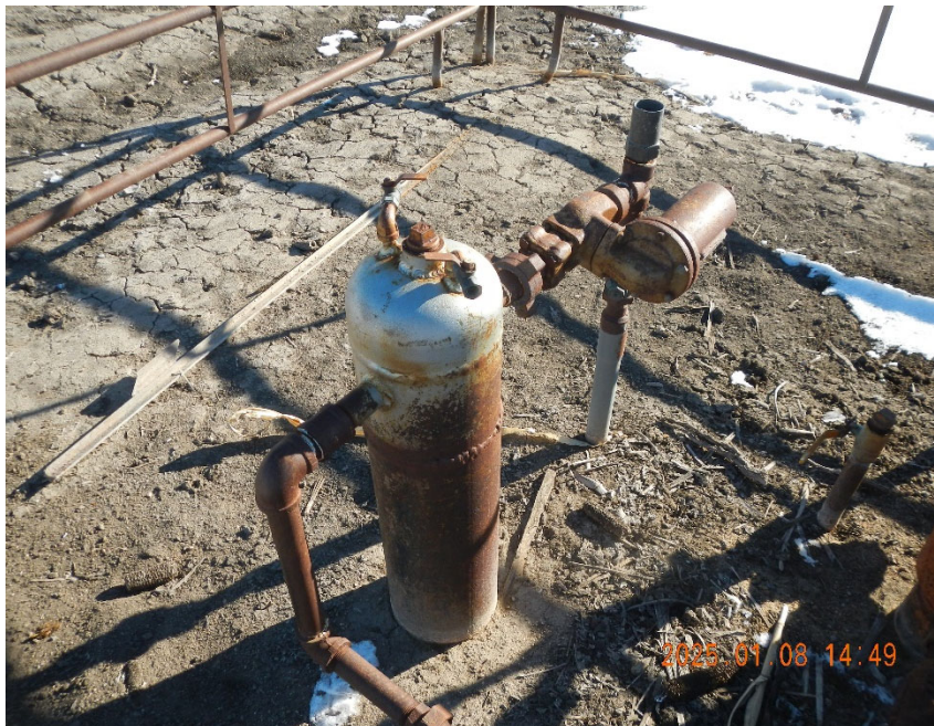
3. View of domestic tap at well location.