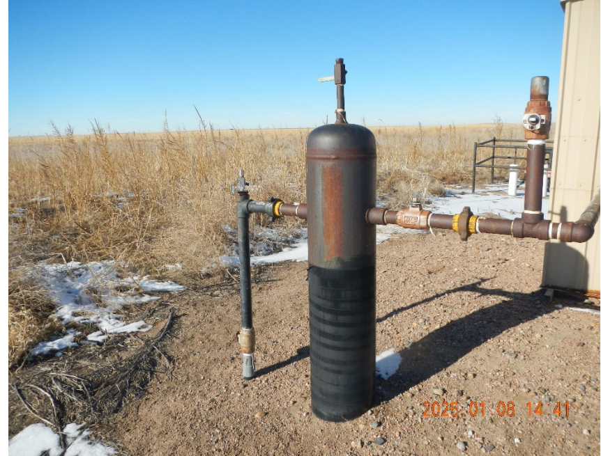
6. Dehydrator on flowline inlet to meter shed.