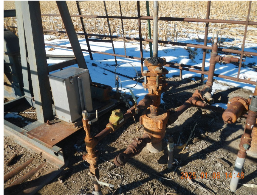
2. View of wellhead.