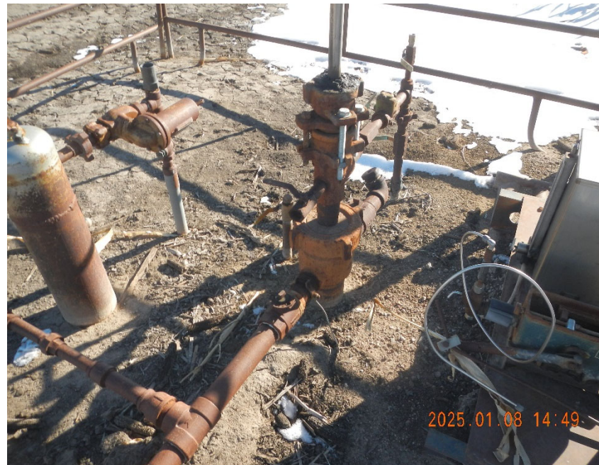
4. View of domestic tap and wellhead.