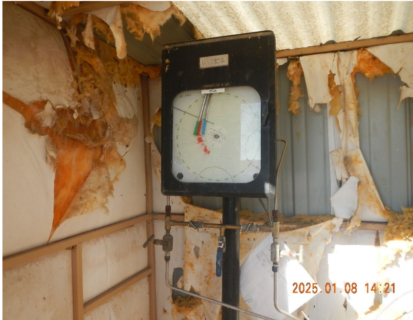
5. Gas meter inside meter shed.