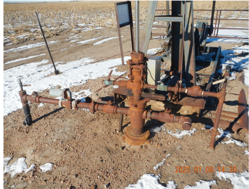
2. View of wellhead.