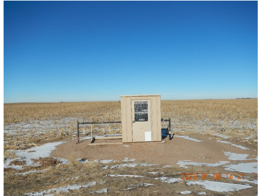
6. Gathering location overview.