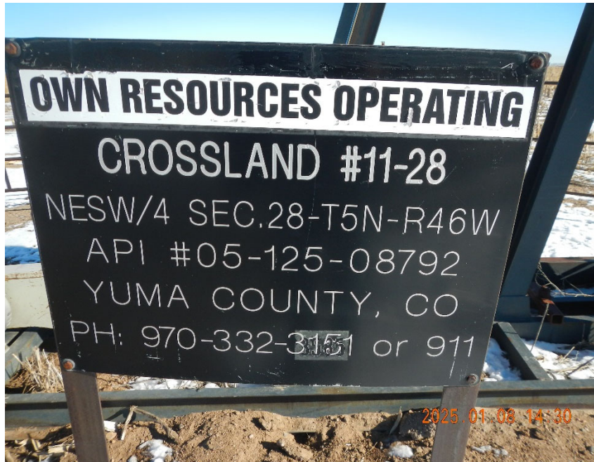
1. Lease sign at well location.