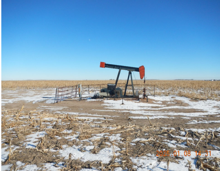
3. Well location overview.