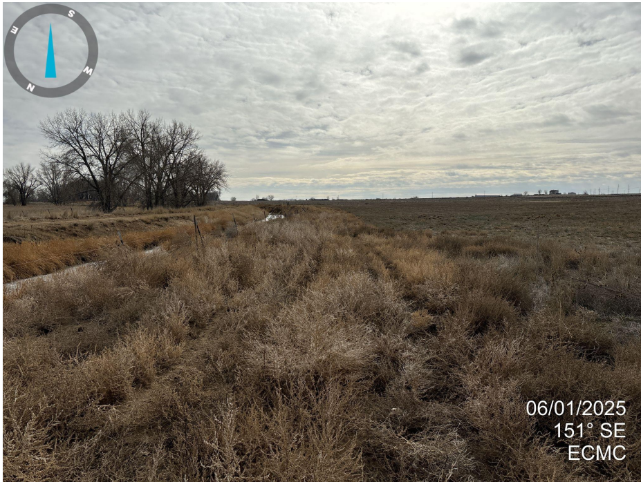
Photo 1. Looking south down access road from 9th street. Undesirable weedy species Russian thistle and Kochia are dominant on the access road. List B noxious weed Scotch thistle is present on location and access road.