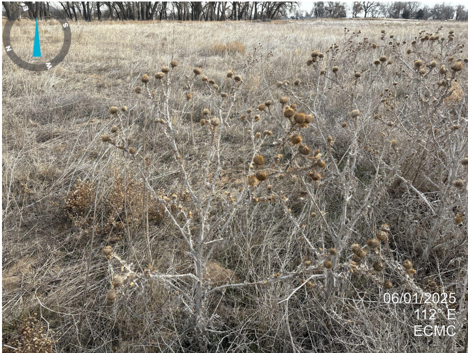
Photo 7. photo taken at the southern side of well site looking east. List B noxious weed Scotch thistle is present on location.