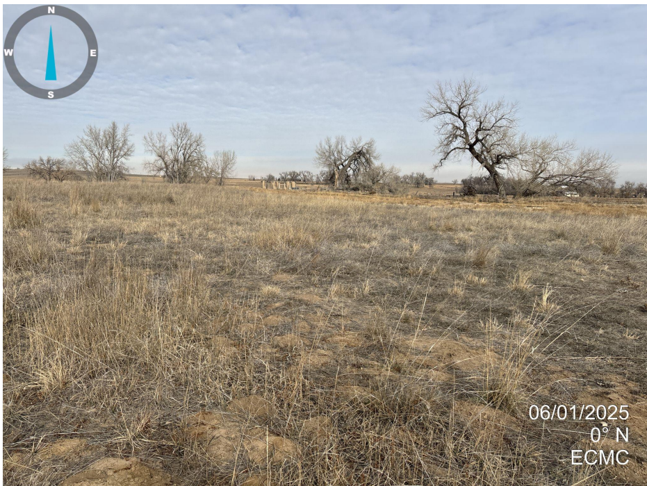
Photo 5. looking north from well location. See Photo 4 comments.