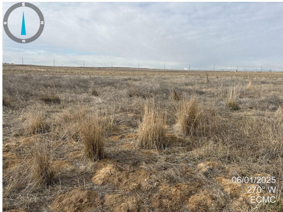
Photo 6. looking west from well location. See Photo 4 comments.