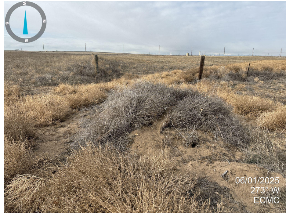
Photo 2. Looking west at midpoint of access road near gate. Pile of soil and plant debris on access road.