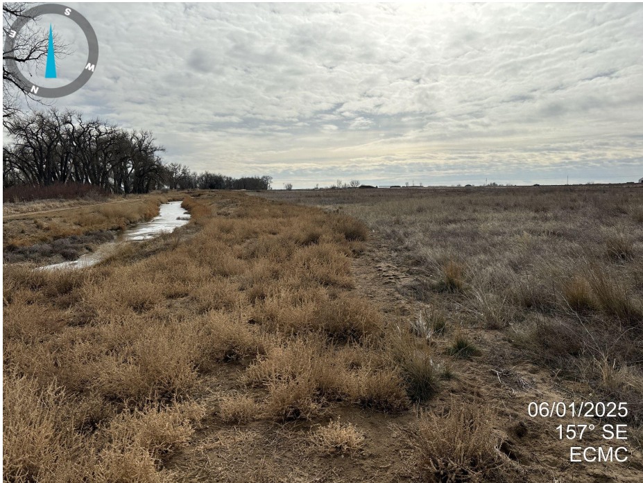
Photo 3. Looking south at wellsite. Undesirable and noxious weeds are present on access road and location.