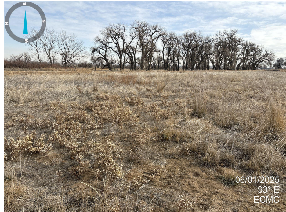
Photo 4. Looking east from well location. Some desirable perennial vegetation has established. Undesirable annual weeds Kochia and Russian thistle are present on location. Noxious weeds Downy brome and Scotch thistle are present on location.