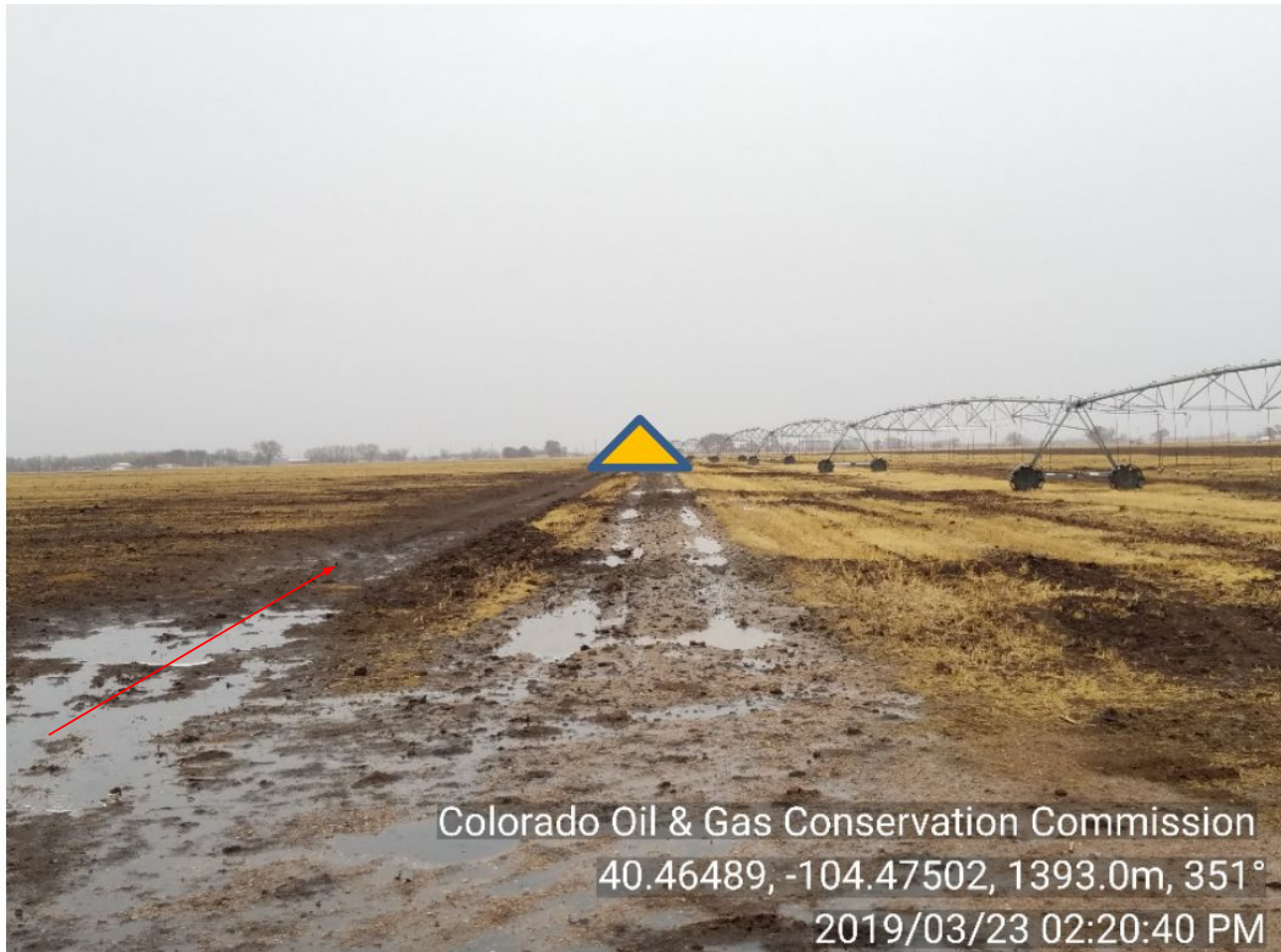
Photo 1. Photo from FIR (doc #696100614) conducted 03/23/2019, approximately 4 months after plugging and abandonment operations. Photo illustrates an access road west/left of the existing access road. It is unsure whether the access road (indicated by red arrow) is from P&A operations and/or flowline removal.