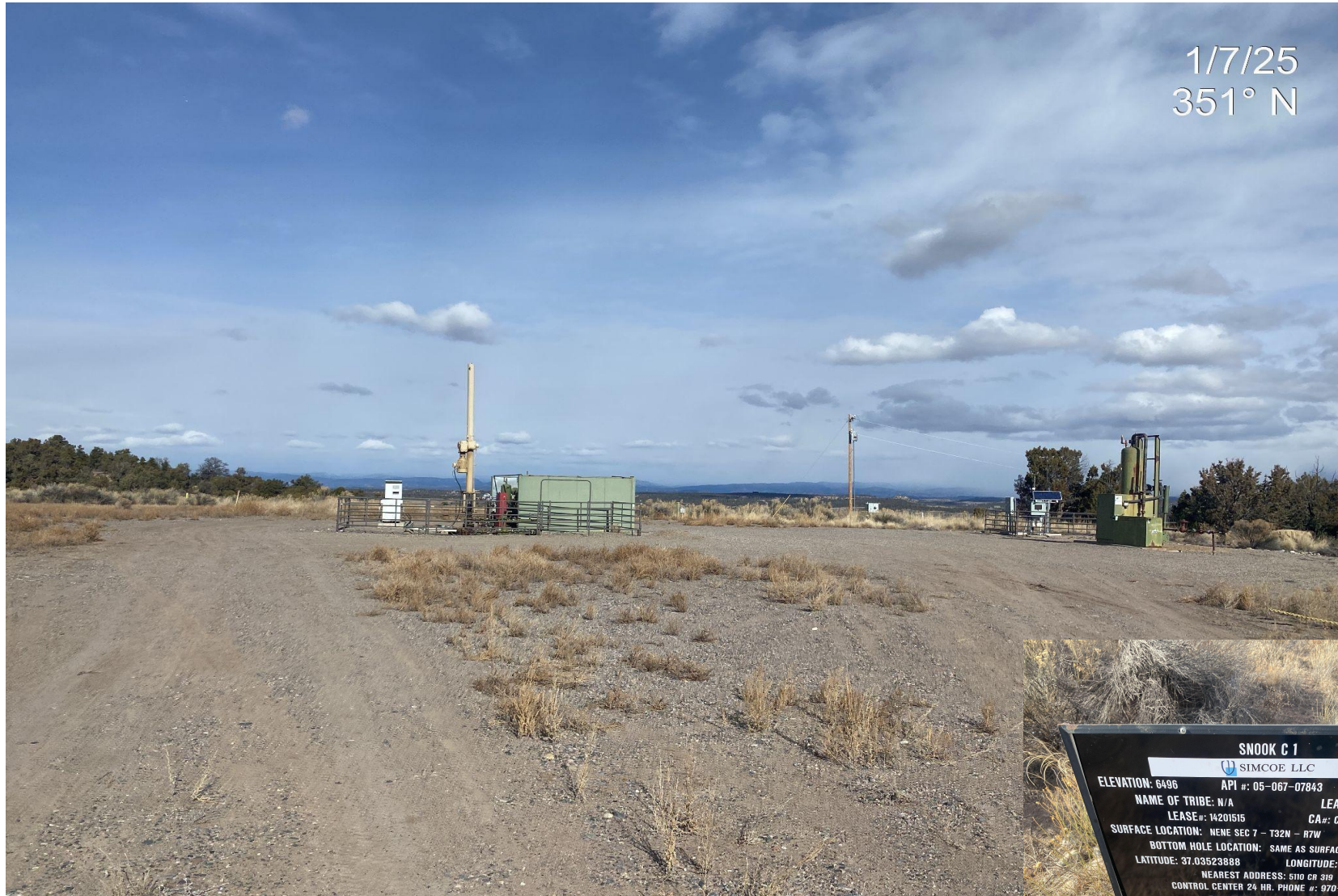
Photo 1. View of well pad taken from the access point facing center.