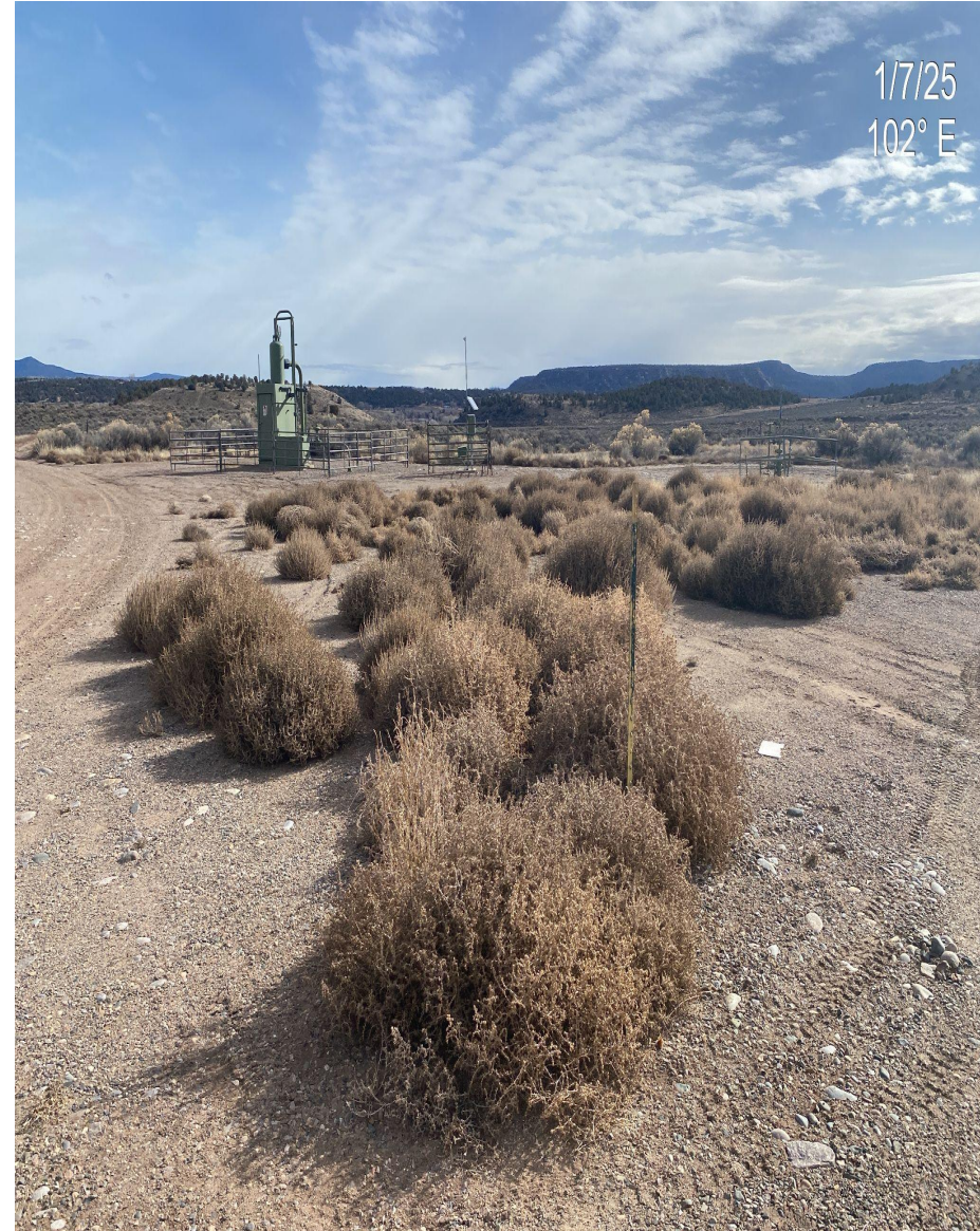
Photo 2. View of weedy debris that remain in large patches on the location.