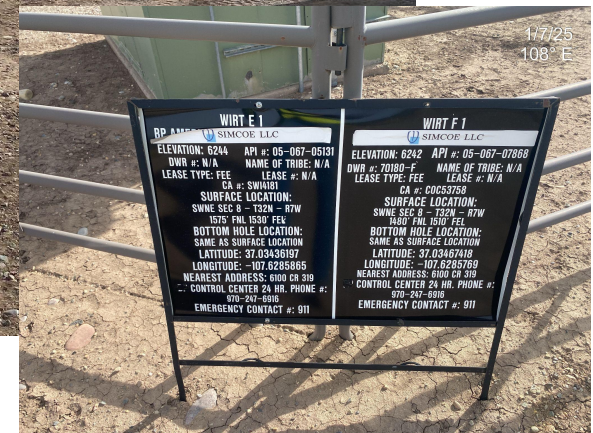
Photo 1. View of well pad taken from the access point facing center.