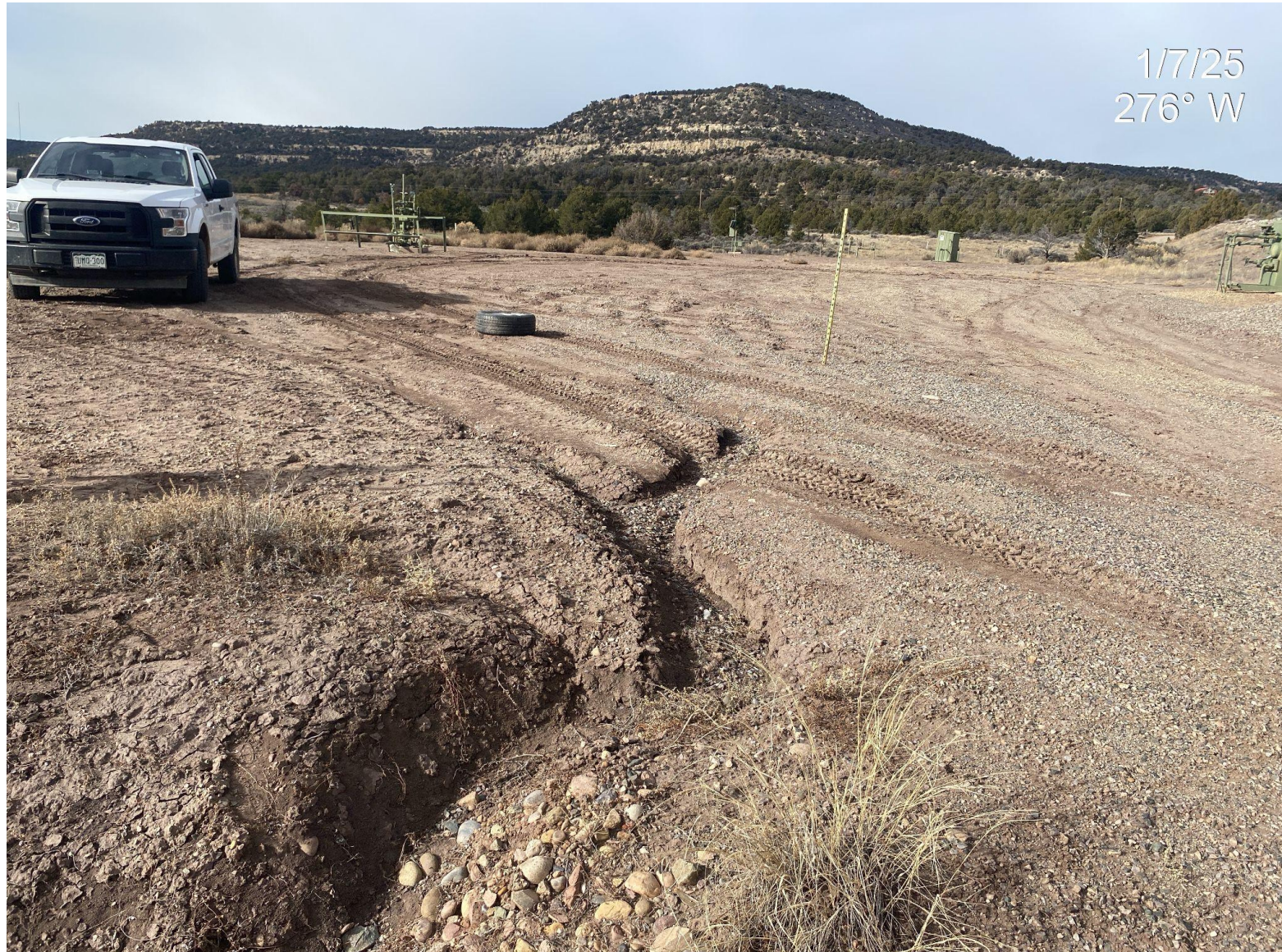
Photo 2. Gully erosion forming at location access point.