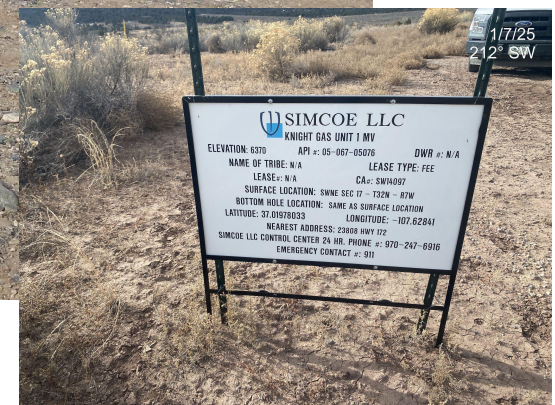
Photo 1. View of well pad taken from the access point facing center.