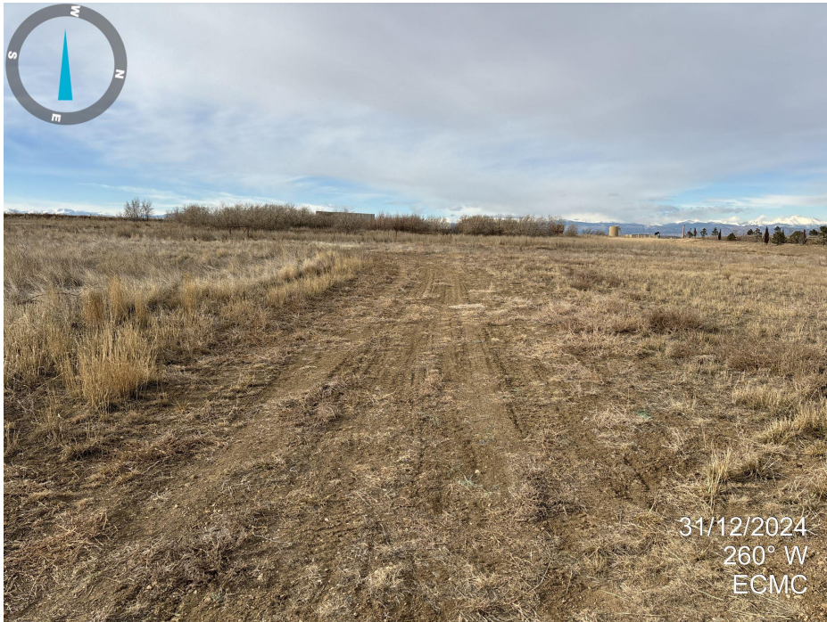
Photo 1. Photo taken from east side of site looking west. No oil and gas equipment remains on site. Appears to have been reclamation activity such as recontouring and reseeding. Desirable vegetation is progressing outside of access road. Undesirable weedy annual Kochia is present on location.