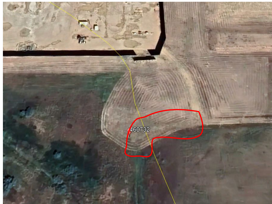
Photo 4. Google earth image taken 08/2021. Illustrating reclamation work over former tank battery location. A section of the former access road may need additional reclamation work (red circle).