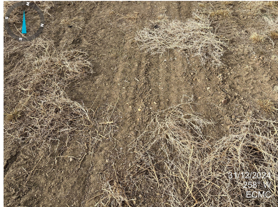
Photo 2. See Photo 1 comments. Former access road may need additional decompaction and reclamation work.