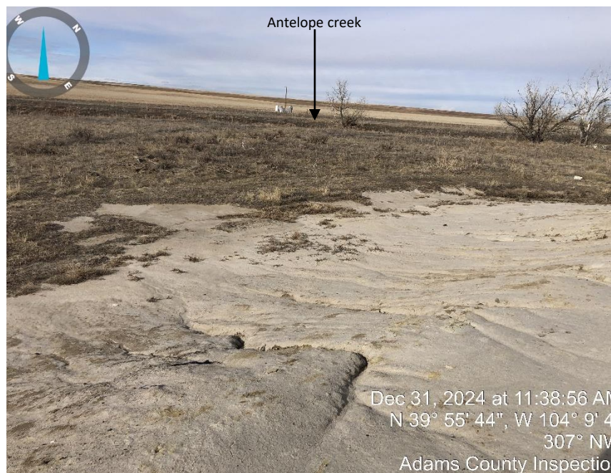
Photo #9 Erosion/fisher on west of pit facing west away from pit toward Antelope creek.