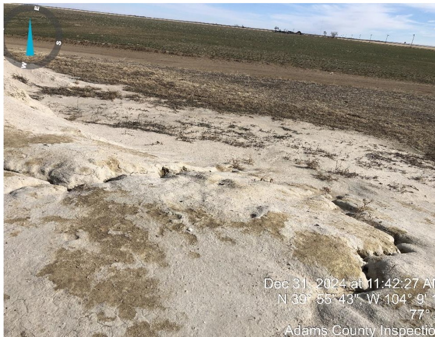
Photo # 15 Erosion/fishers south east side of pit facing east & away from pit.