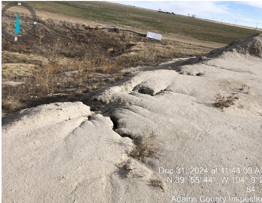
Photo #13 Erosion/fisher north side of pit facing east and away from pit.