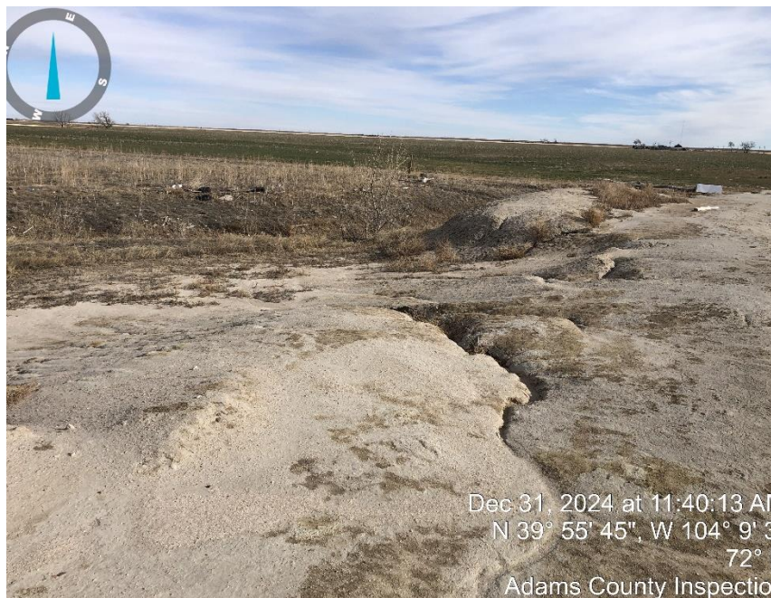
Photo #11 Erosion on the north side of pit facing north/east away from pit.