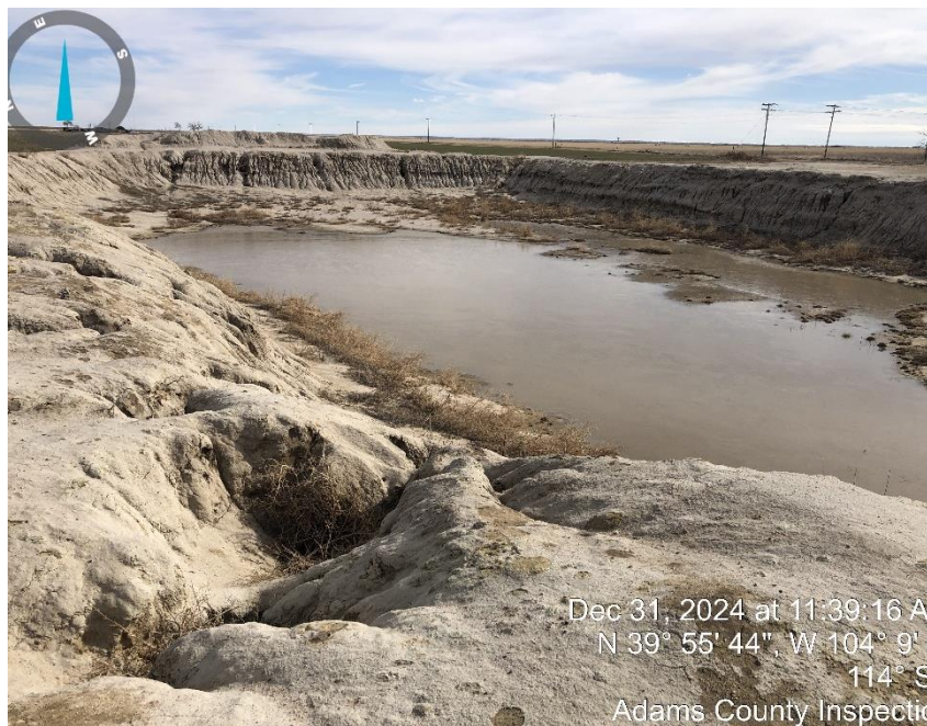
Photo #10 Erosion/fisher in pit on the west side facing south east.