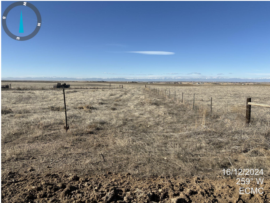
Photo 1. Photo taken looking west along access road. Road has not been recontoured. Gravel remains on access road and location. Undesirable annual plant species are present (Kochia, Cheatgrass).