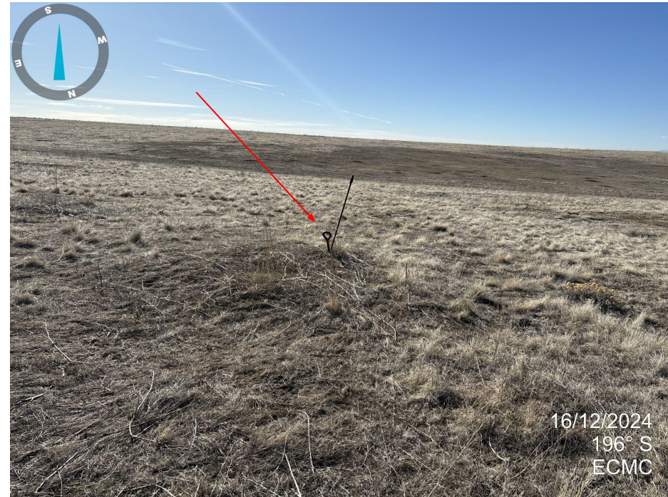
Photo 6. Looking south at southern edge of well location. Guyline anchor remains in place (red arrow).