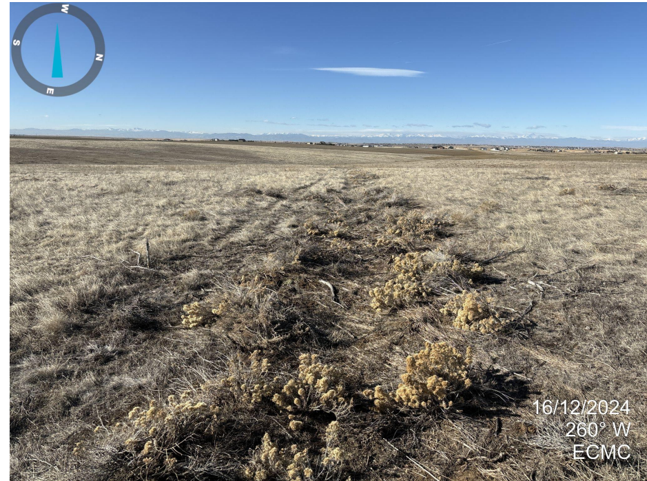
Photo 2. Midpoint of access road looking west. See Photo 1 comments.