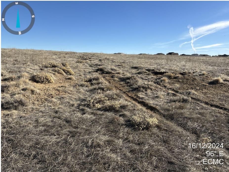
Photo 3. Looking east from well location. Well pad and access road have not been recontoured. Noxious weeds (Cheatgrass, Mullein) are present on location as well as Kochia and Russian thistle.