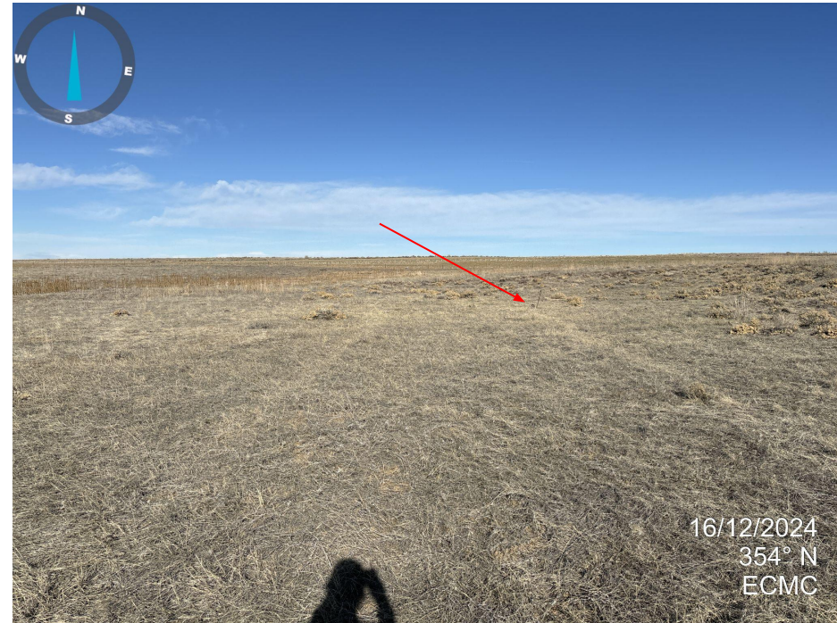
Photo 4. Photo taken from well location looking north. Perimeter guyline anchors remain in place (red arrow). See Photo 3 comments.