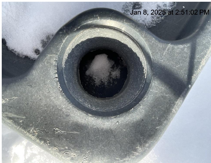
Photo # 7485 Failure to maintain chemical BMP - Chemical tank containment approximately 2/3 to 3/4 full of fluid/BMP insufficient to contain possible spill