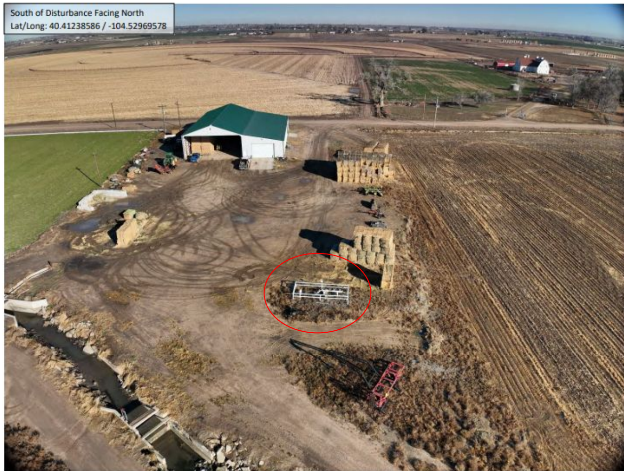
Photo 2. Screenshot taken from the drone closure report (Page 15; doc #404016974) illustrating overview of the land use change and disturbance areas. Midstream equipment (circled in red) near the former tank battery facility.