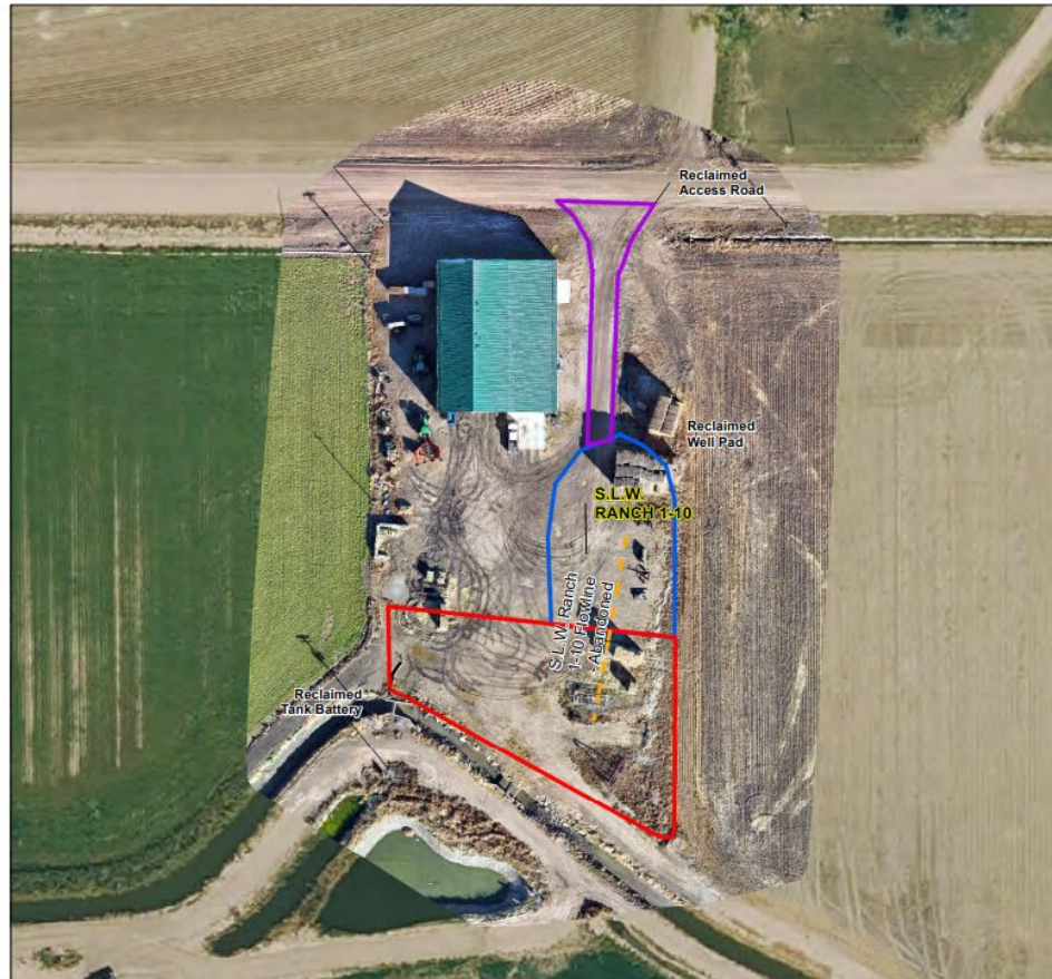
Photo 1. Screenshot taken from the drone closure report (Page 13; doc #404016974) illustrating overview of the land use change and disturbance areas.