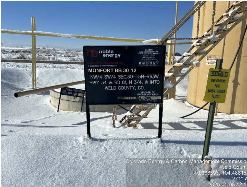
Photo #5 Monfort BB 30-12 Battery site Inactive | Shut-down Battery sign