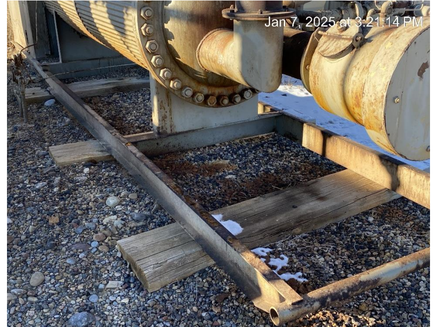
Oily waste and stained soil