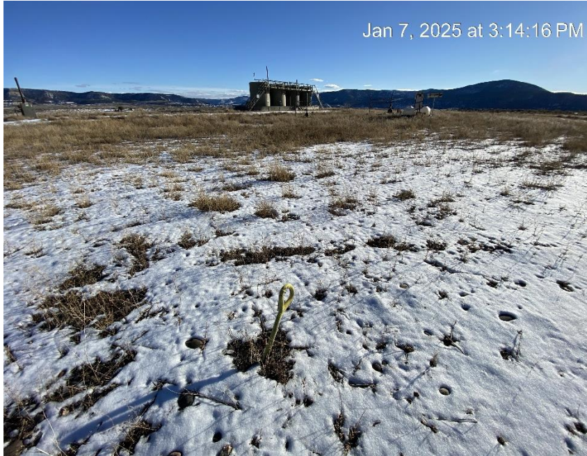
Location from Northwest corner