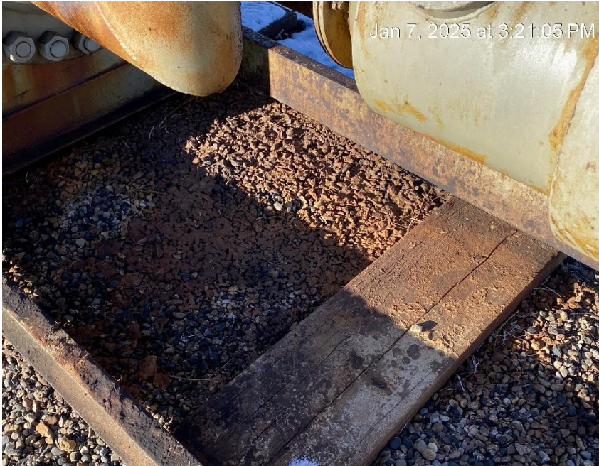
Oily waste and stained soil