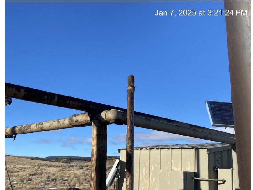
Relief riser cap missing