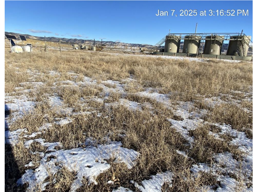
Location from Southwest corner