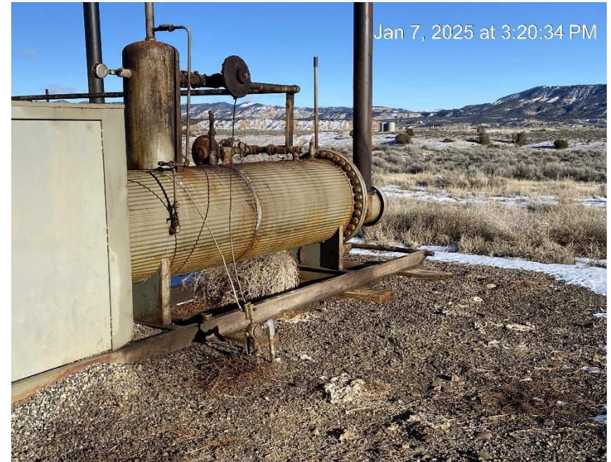
Oily waste and stained soil