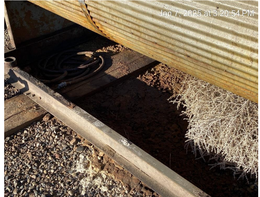
Oily waste and stained soil