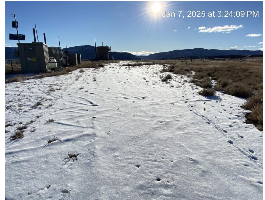
Location from Northeast corner