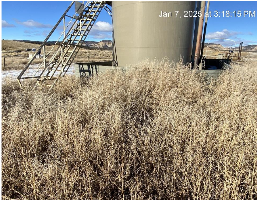
Location from Southeast corner