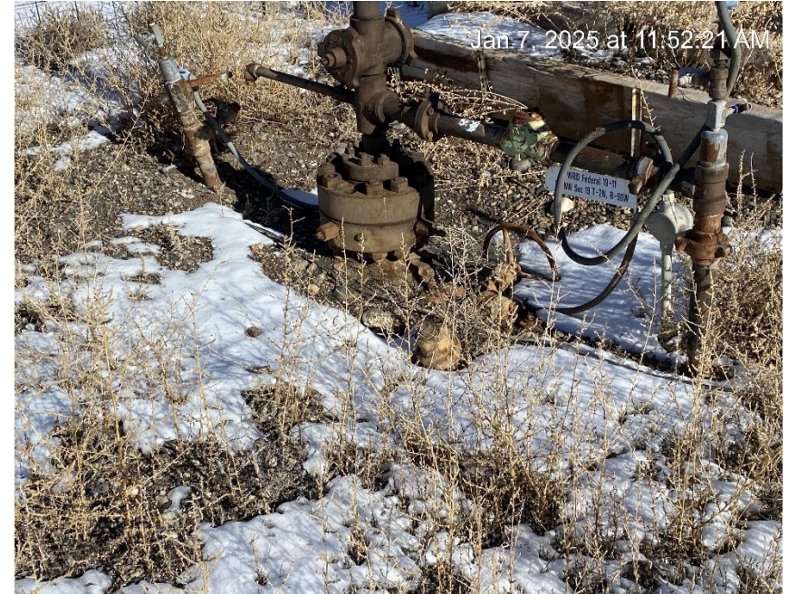
When sign is replaced additional information is required