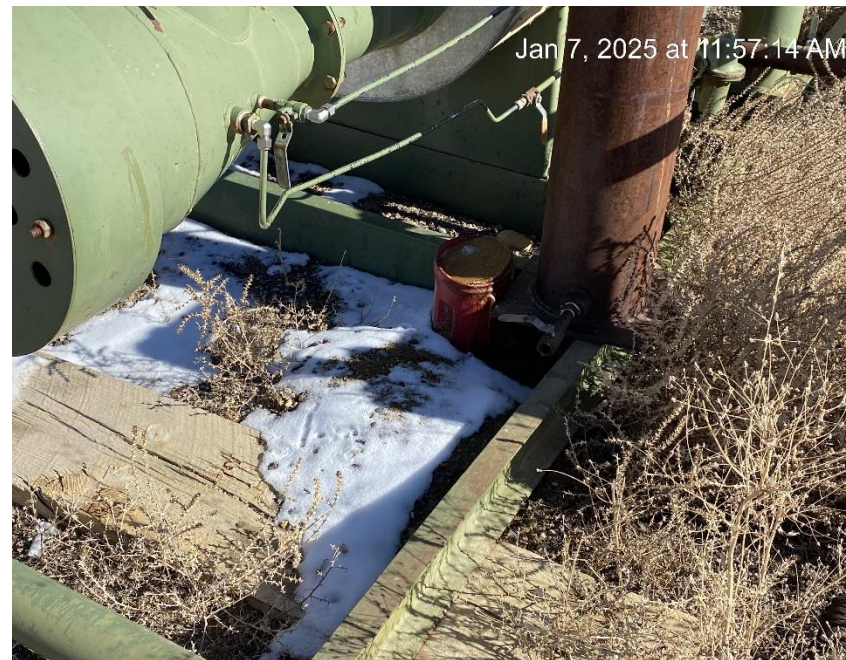
Oily waste container open to wildlife