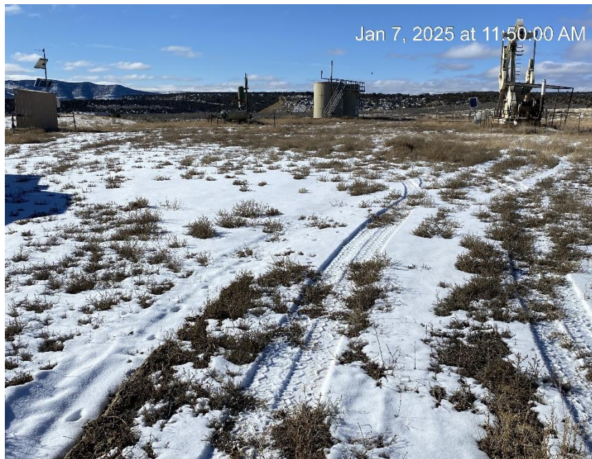
Location from Northeast corner and entrance