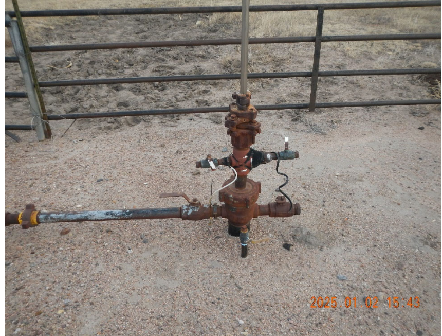
2. View of wellhead.