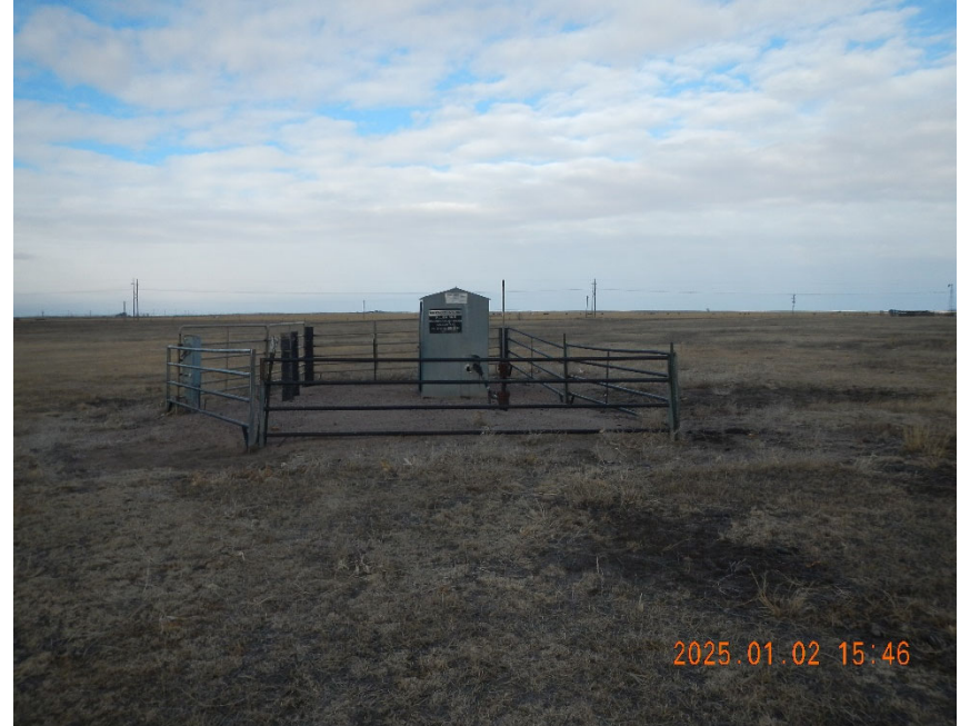
6. Location overview.