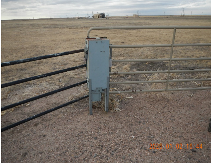
3. Power and control panel for removed Pump Jack.