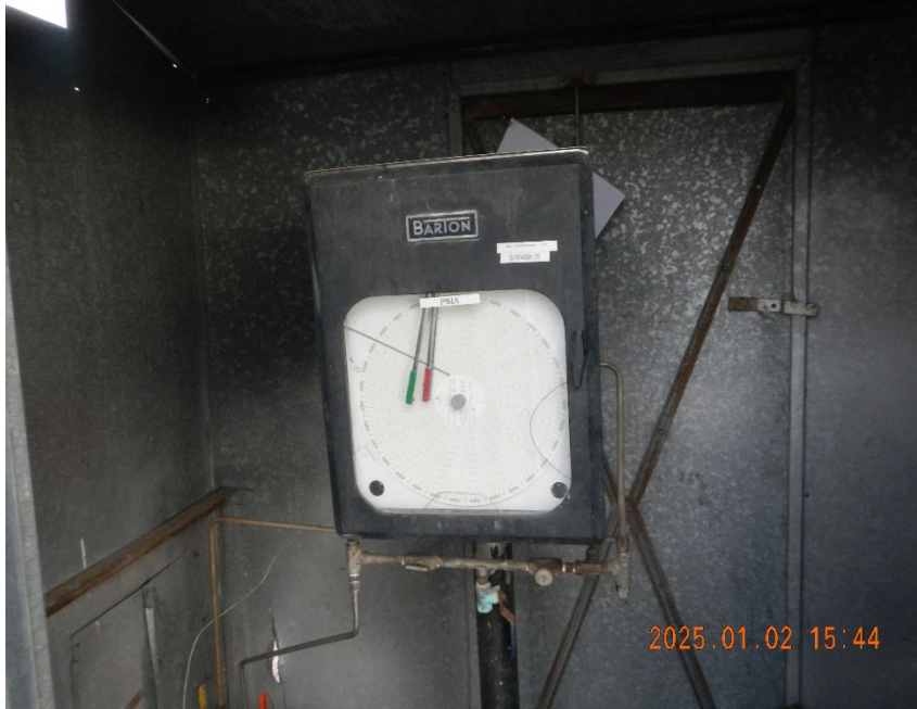
5. Gas meter inside meter shed.