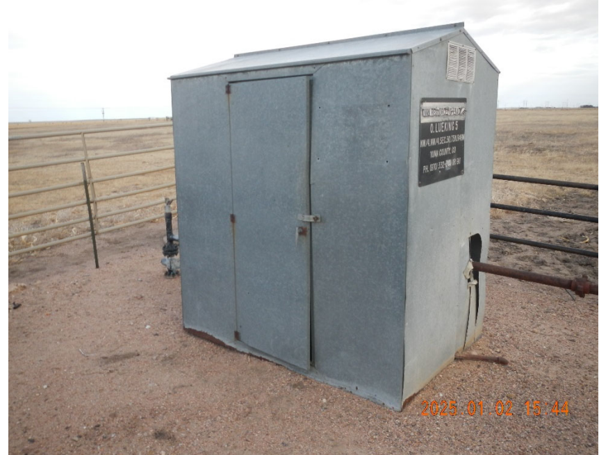
4. Gas meter shed.