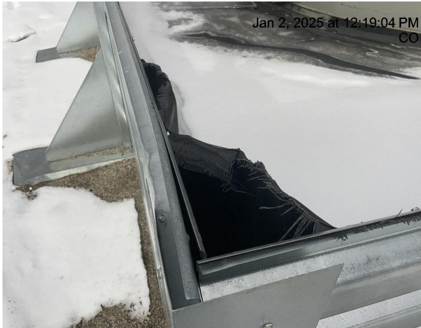
Photo # 6500 Secondary containment liner showing signs of damage/disrepair near top of metal containment ring