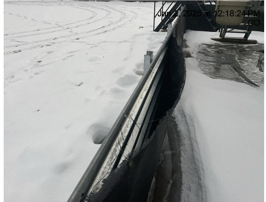
Photo # 6499 Secondary containment liner showing signs of damage/disrepair near top of metal containment ring