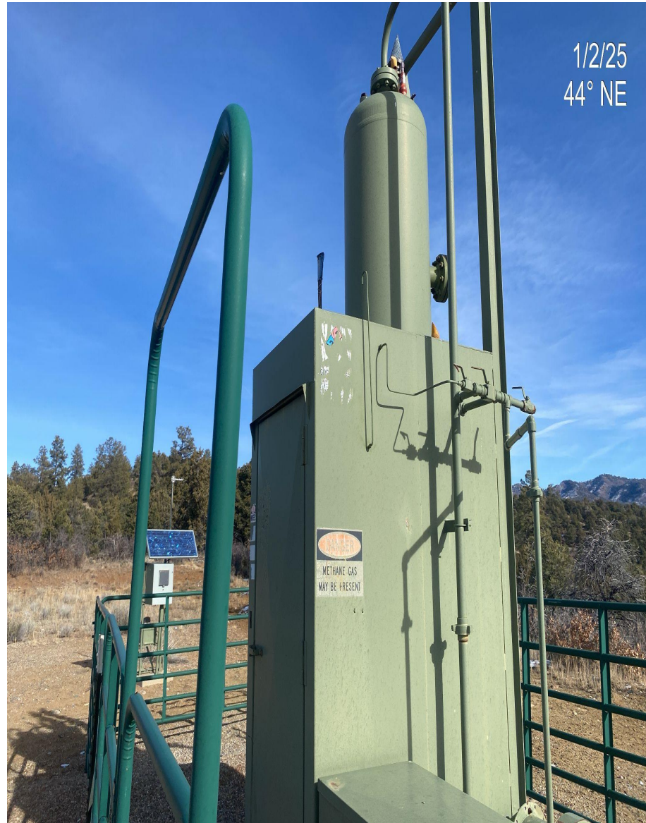
Photo 2. Signs/placards at separators have deteriorated and are no longer legible.