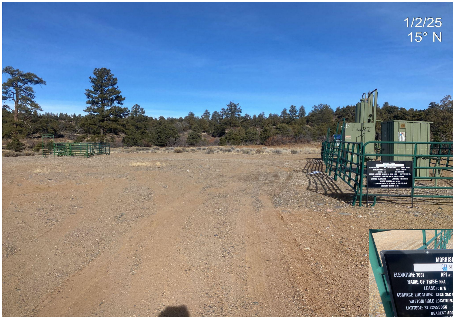
Photo 1. View of the well pad taken from the access point facing center.