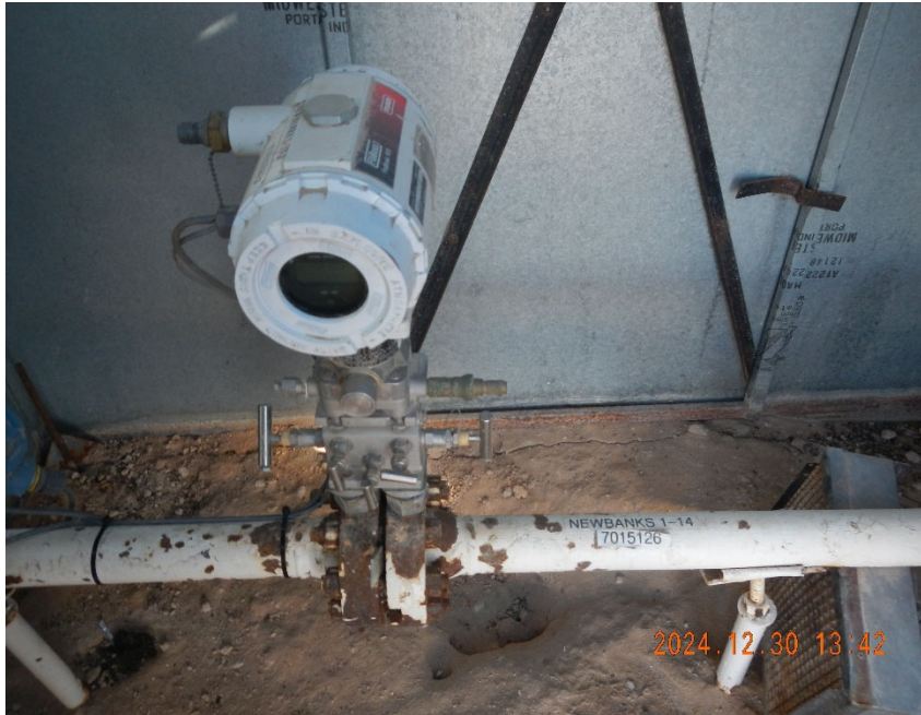
3. Gas meter inside meter shed.