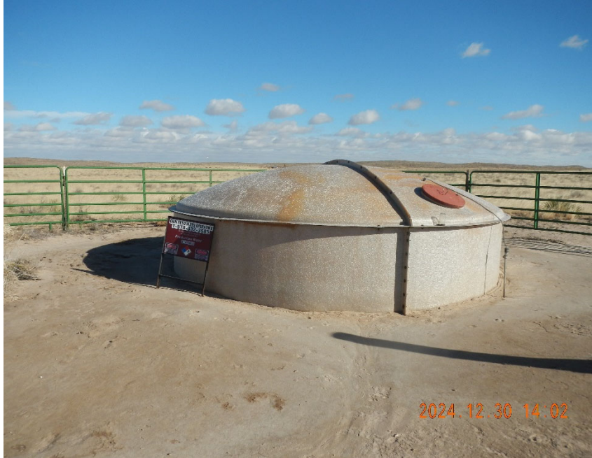
5. Produced water tank.