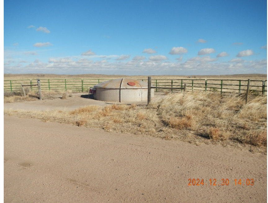
6. Produced water tank location overview on CR T.