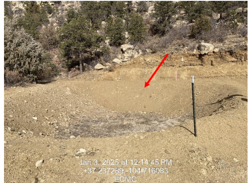
Photo 4 – 24-19 Pit north east side of pit was impacted by Stormwater BMP