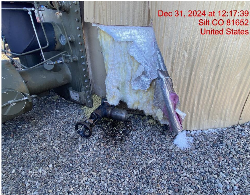
Damaged Tank Insulation – Photo #05682