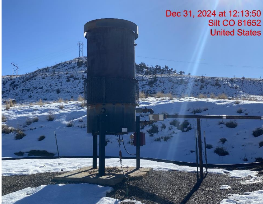
Location – Photo #05672