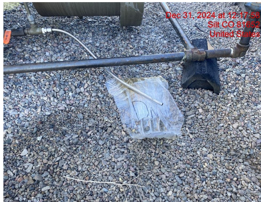
Trash/PRV Discharge Line – Photo #05684