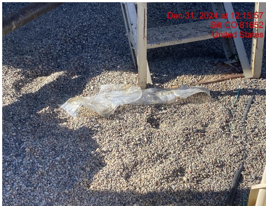
Trash – Photo #05674