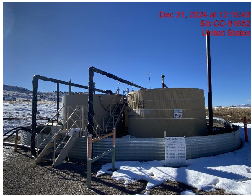
Location – Photo #05671

Dec 31, 2024 at 12:15:43 Silt CO 81652 United States