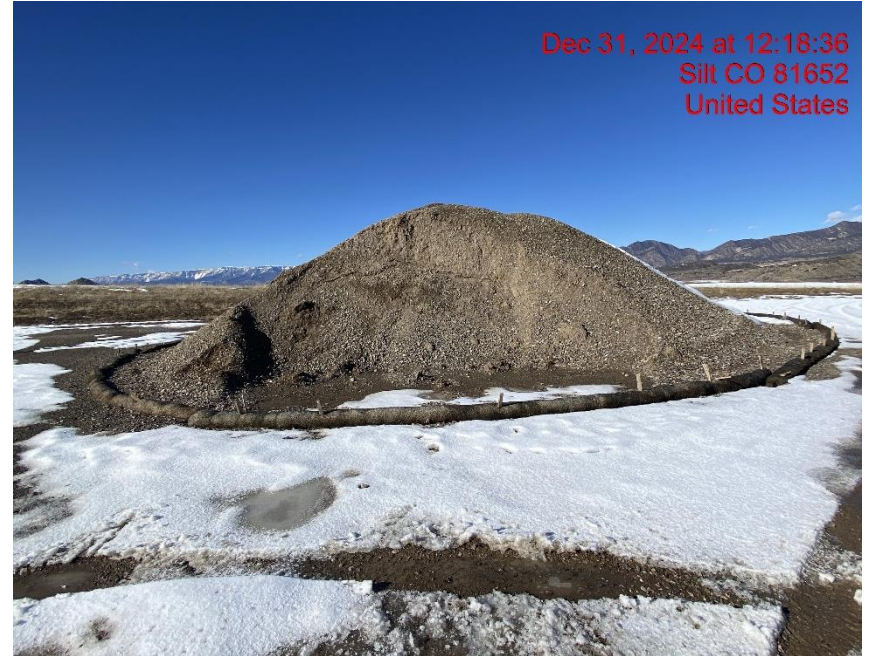
Location – Photo #05685