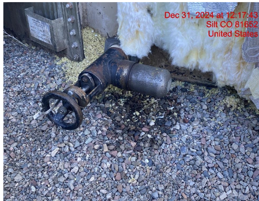
Stained Soil – Photo #05683