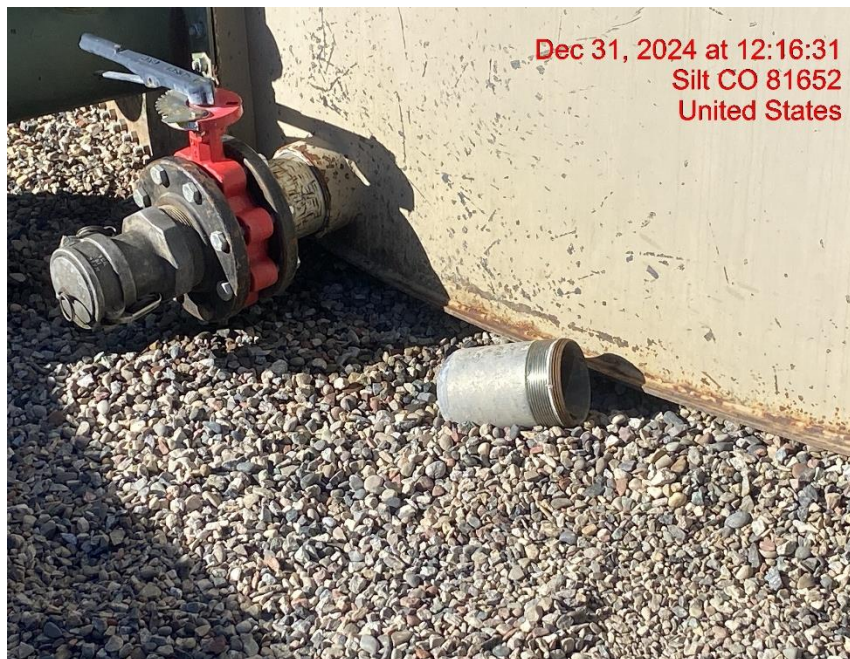
Stored Supplies – Photo #05678