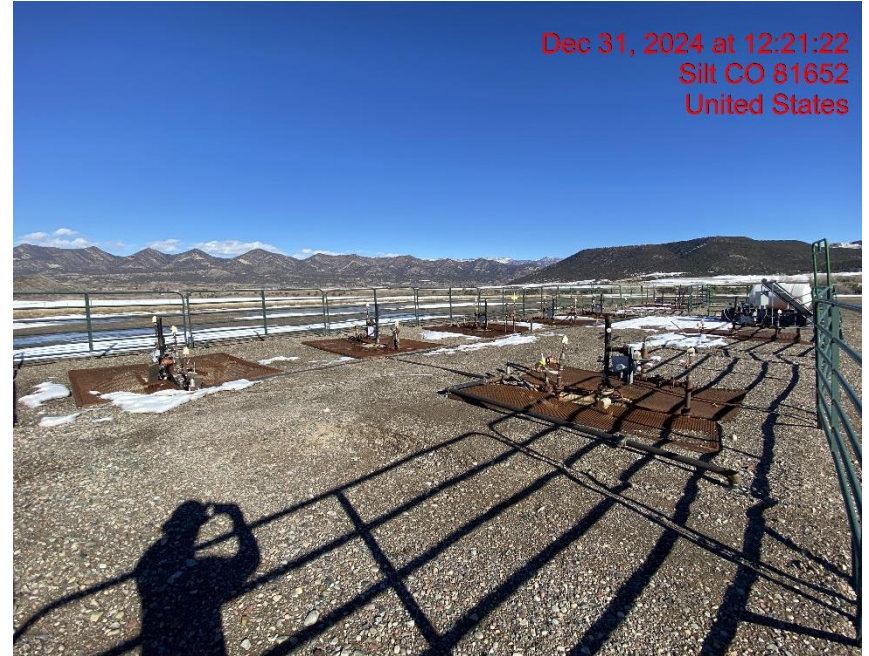
Location Overview – Photo #05670

Dec 31, 2024 at 12:21:22 Silt CO 81652 United States