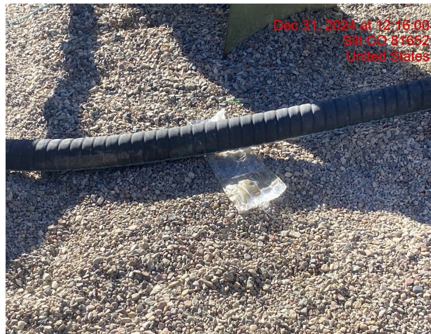
Trash – Photo #05675