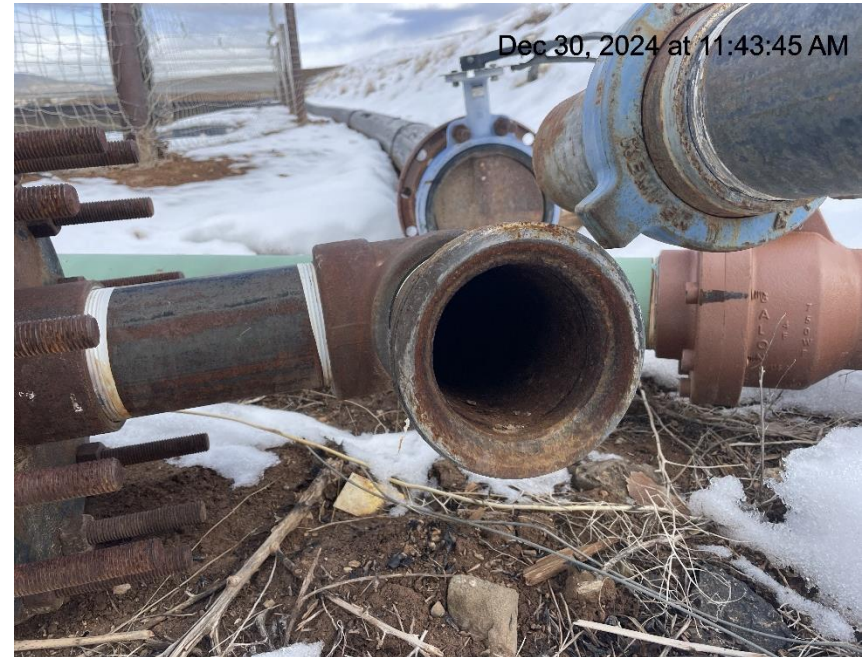
Photo # 5654 Open ended piping/wildlife hazard/available for entry by wildlife