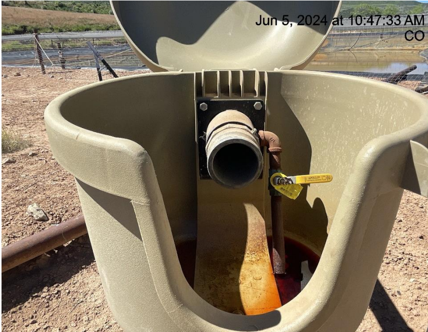
Photo # 9377 From inspection 708903976 conducted on 06/05/2024 Open ended load line