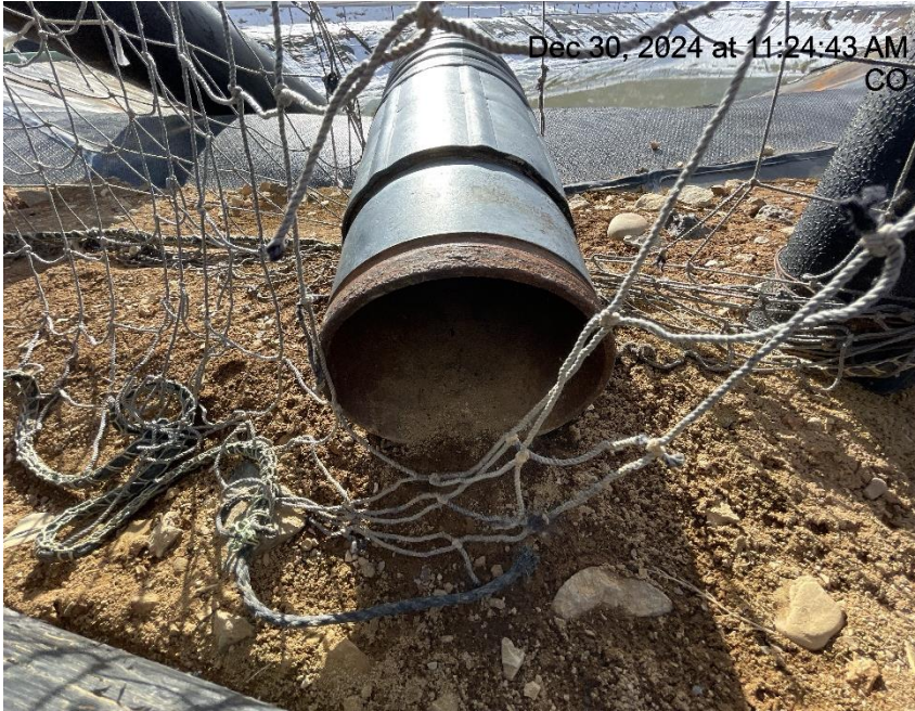
Photo # 5656 Open ended piping & netting also needs maintenance/available for entry by wildlife/wildlife hazards