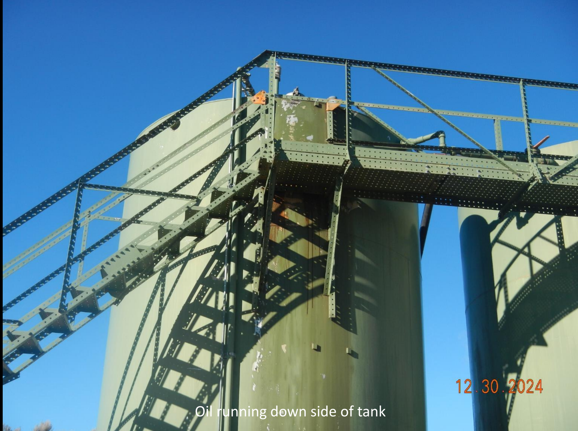
Oil running down side of tank