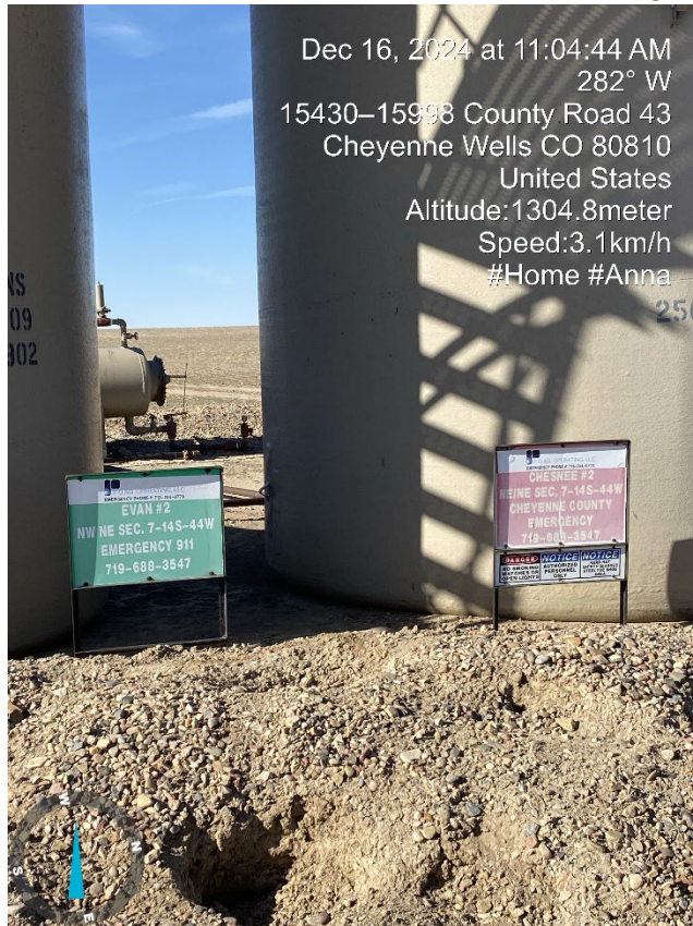
1. Lease sign by battery