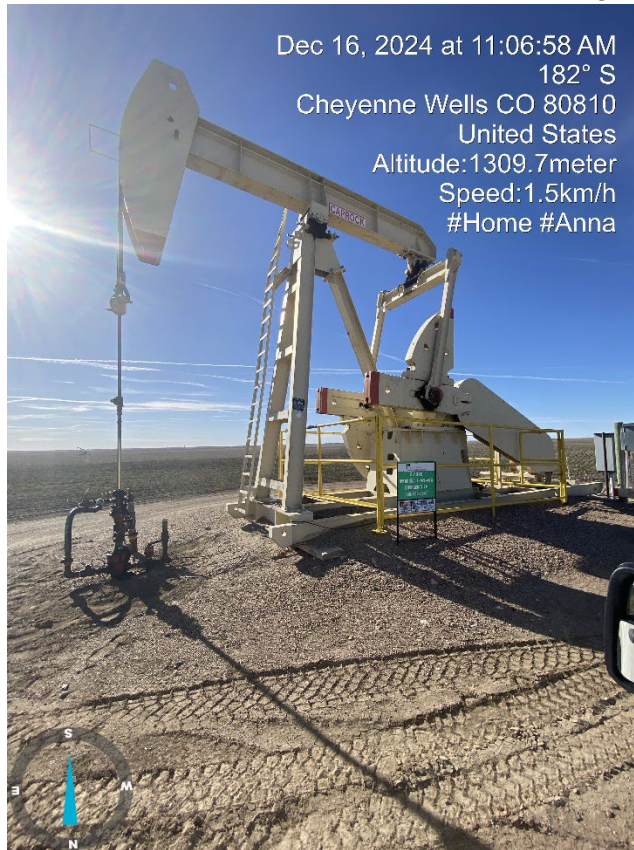
3. Wellhead equipment