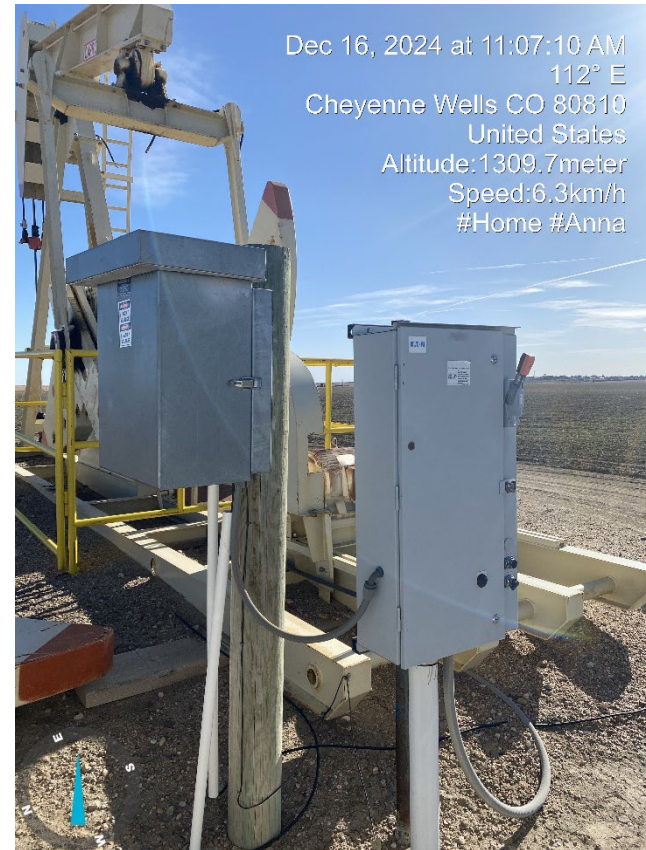
4. Elec panel, Cathodic Rectifier