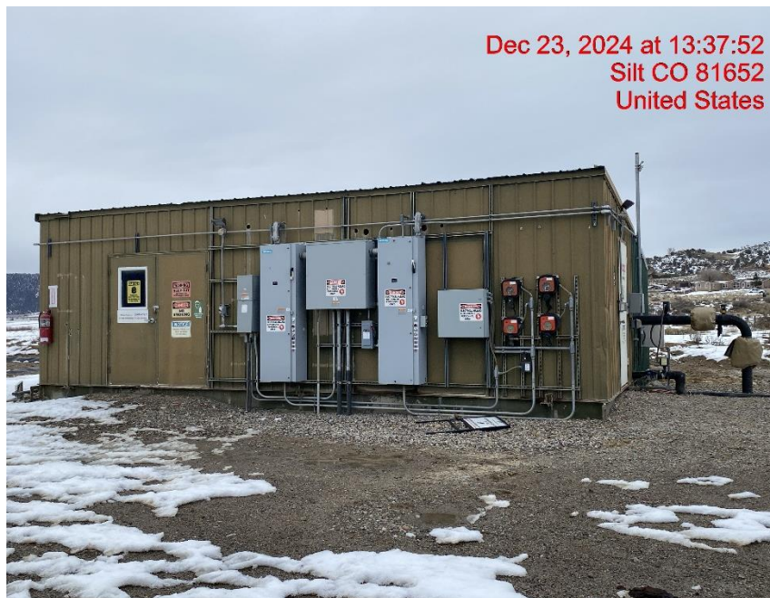
Location – Photo #05614