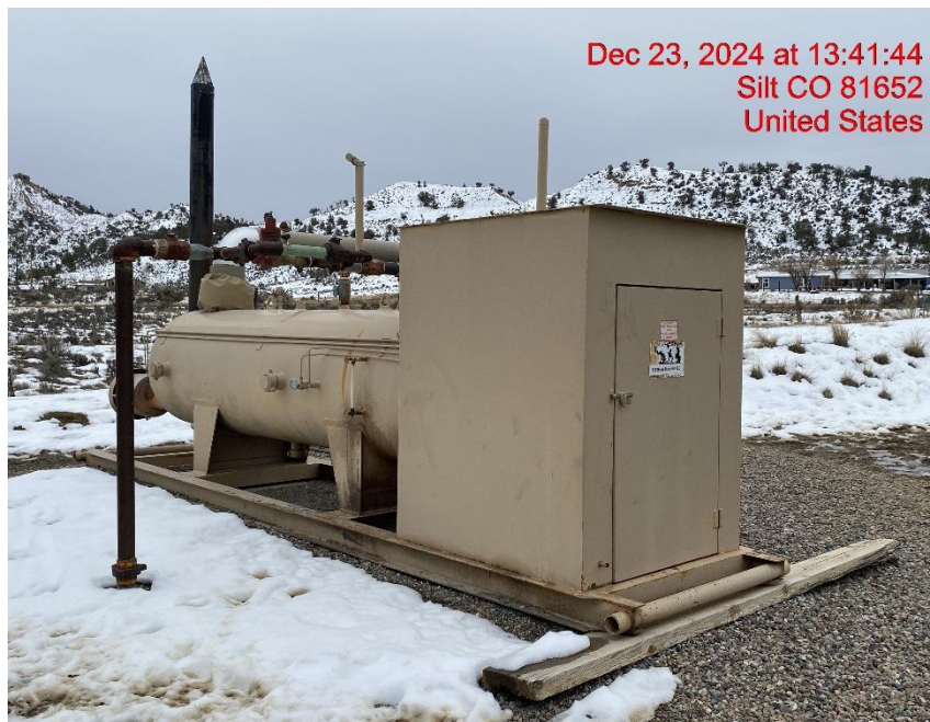
Location – Photo #05626