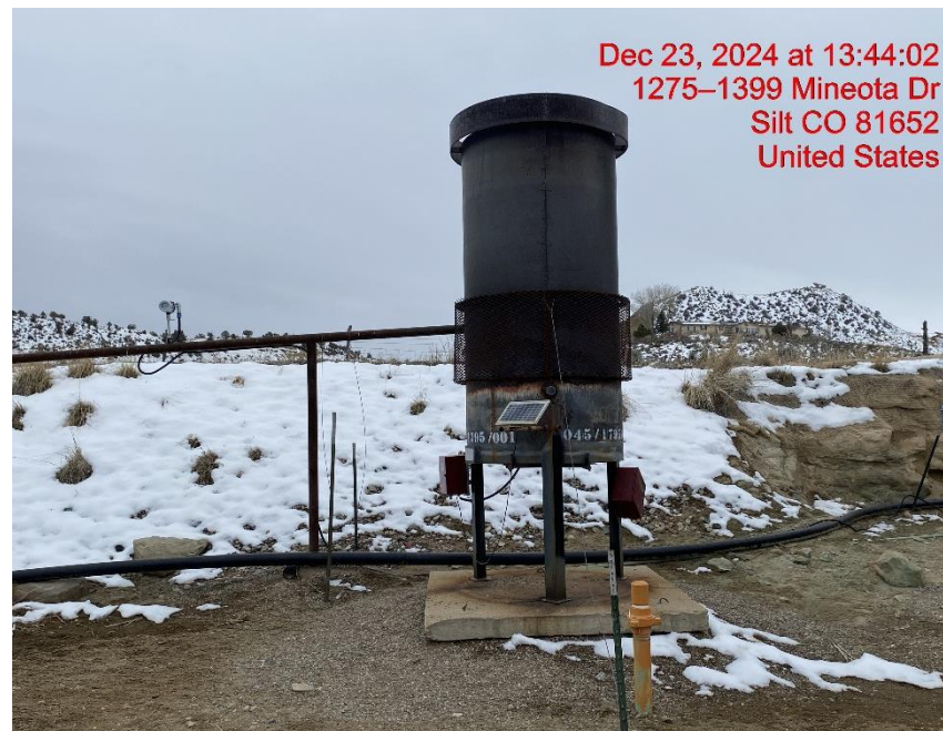
Location – Photo #05628

Dec 23, 2024 at 13:44:02 1275-1399 Mineota Dr Silt CO 81652 United States