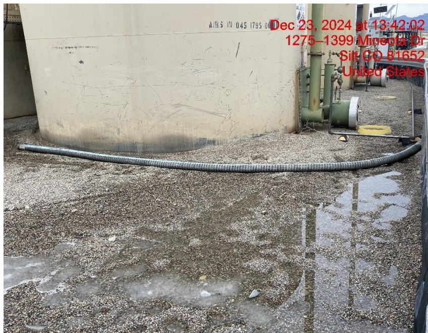
Stored Supplies – Photo #05627