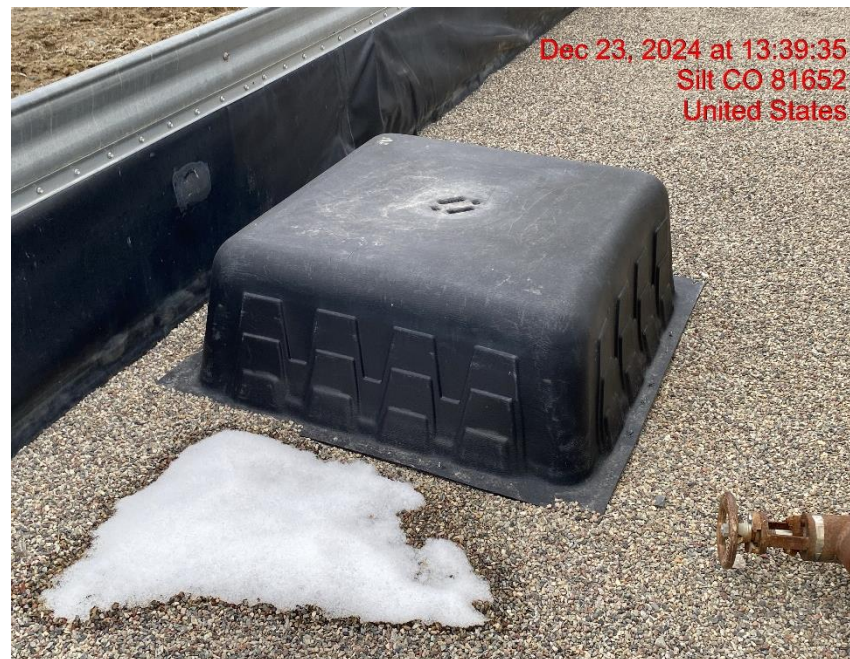
Stored Supplies – Photo #05617