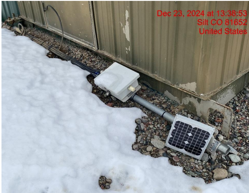
Stored Supplies – Photo #05615