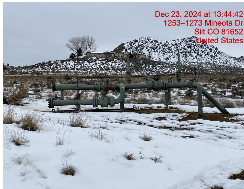
Location – Photo #05637