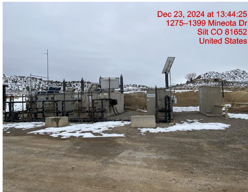
Location – Photo #05612

Dec 23, 2024 at 13:44:25 1275–1399 Mineota Dr Silt CO 81652 United States