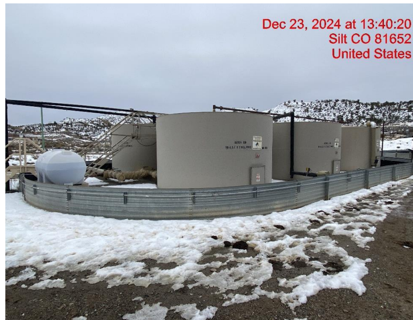
Location – Photo #05619