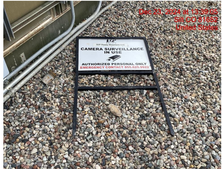
Stored Supplies – Photo #05616