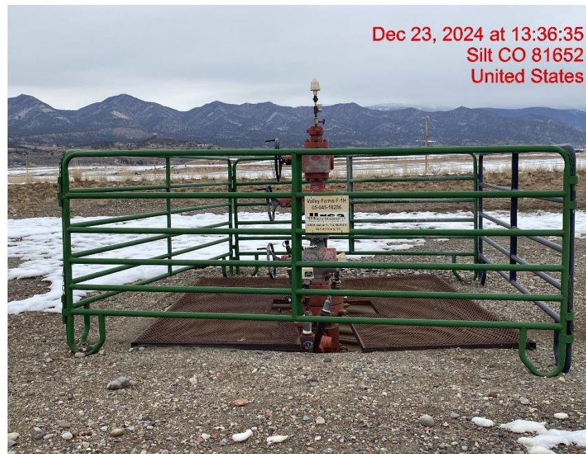
Location Overview – Photo #05609

Dec 23, 2024 at 13:36:35 Silt CO 81652 United States