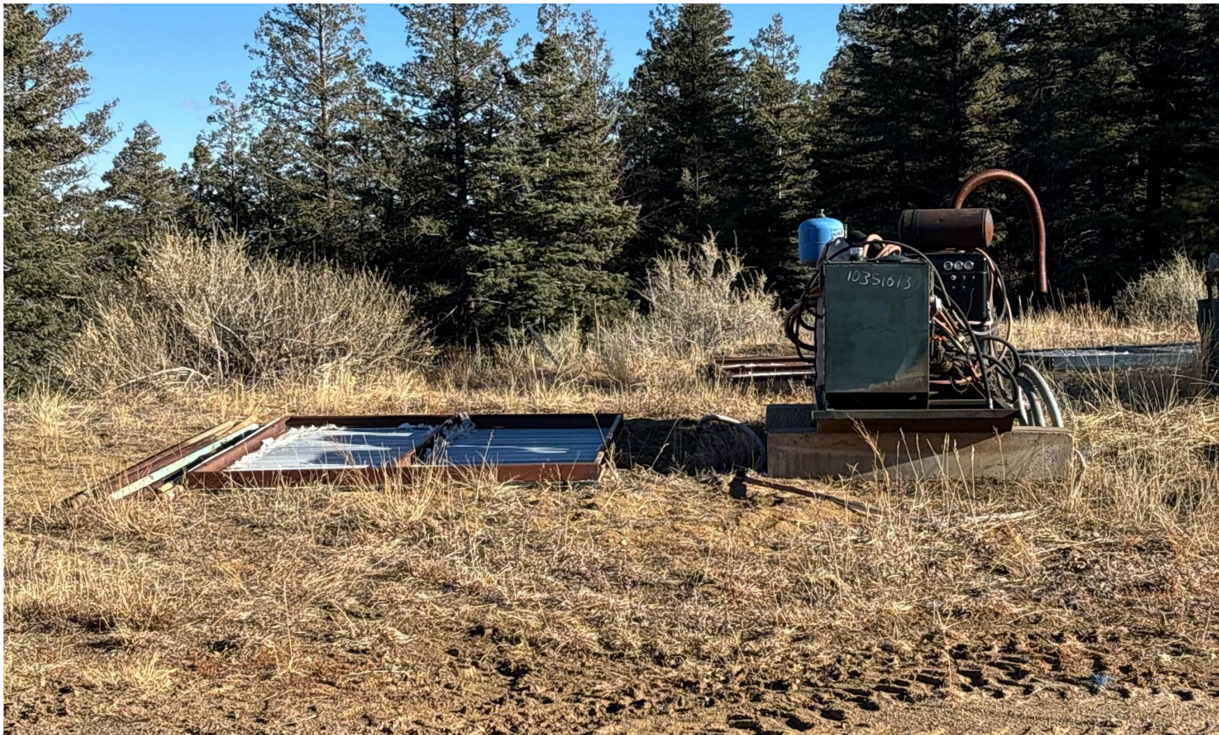
PHOTO 5: UNUSED EQUIPMENT STORED ON LOCATION (SOUND WALL PANELS & PROVE MOVER SKID). REMOVE UNUSED EQUIPMENT PER RULE 606. CA DATE 1-9-25.