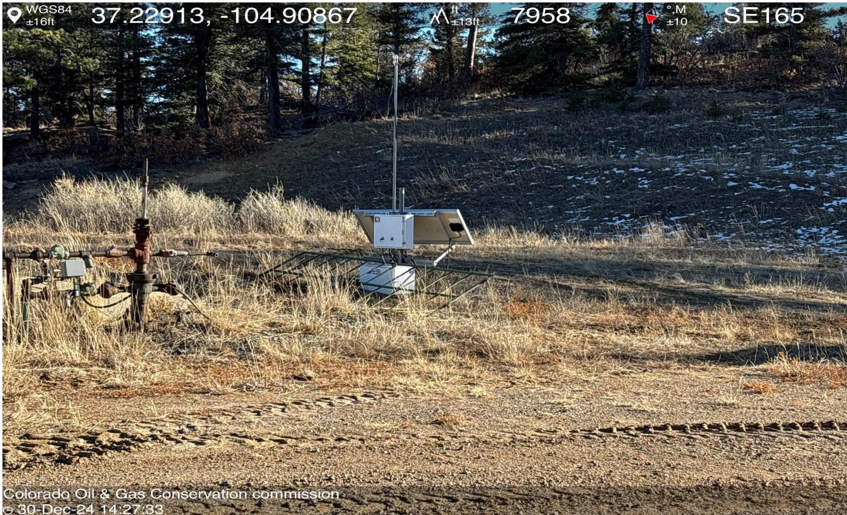
PHOTO 7: UNUSED EQUIPMENT STORED ON LOCATION (FENCE PANEL). REMOVE UNUSED EQUIPMENT PER RULE 606. CA DATE 1-9-25.