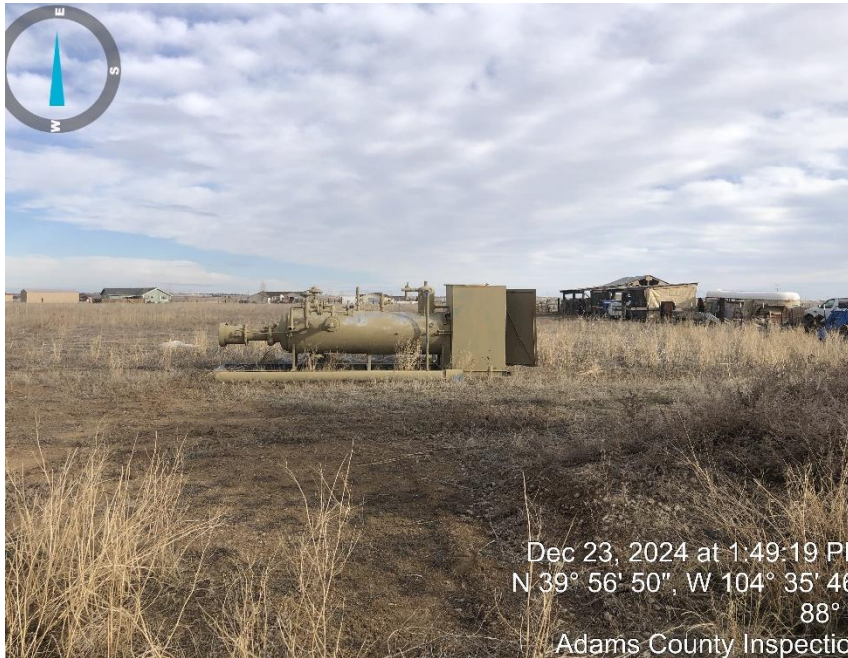
Photo #3 Separator (appears to have been moved to the East side of location).