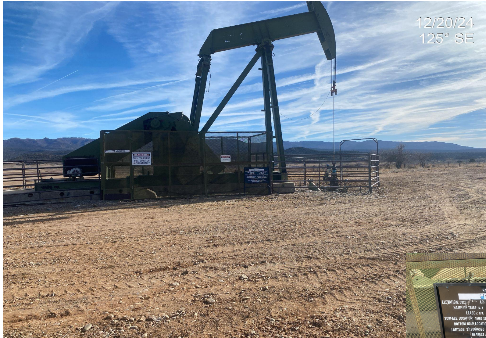
Photo 1. View of well pad taken from the access point facing center.